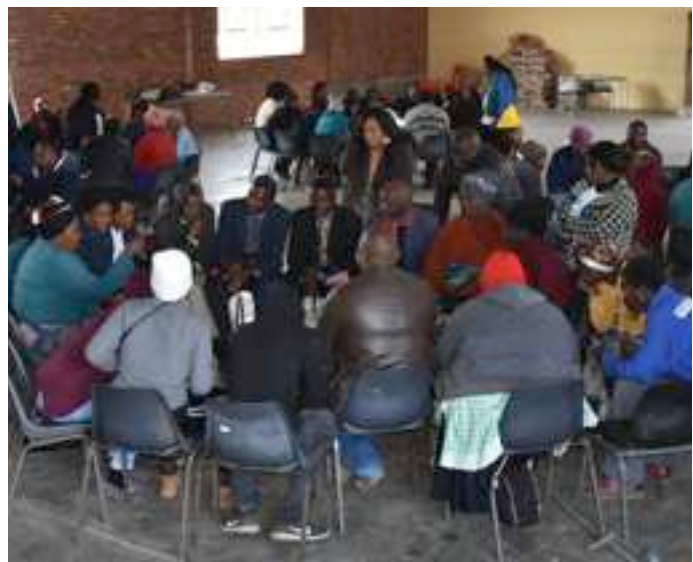
Parents dialogues on teenage pregnancy at Tjakastad.