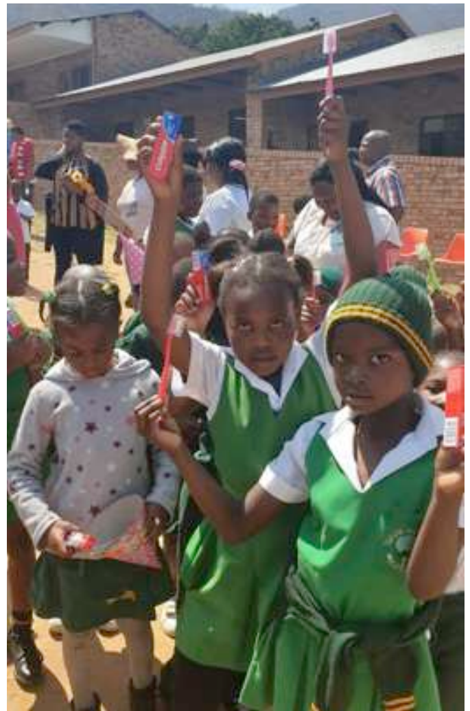
Tenteleli Primary School kids after receiving tooth brushing kits