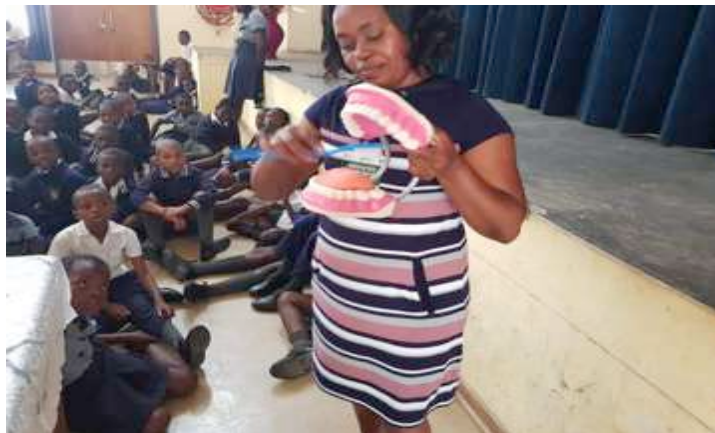
Mbokodo primary school kids learned more about proper brushing of teeth