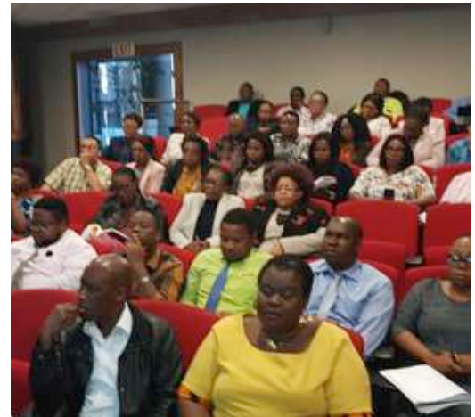
Patient safety workshop at Gert Sibande District

The objective for these workshops is to inculcate a patient safety culture that promotes partnership with patients, encourages reporting and learning from errors, and creates a blame-free environment where health workers are empowered and trained to reduce errors.