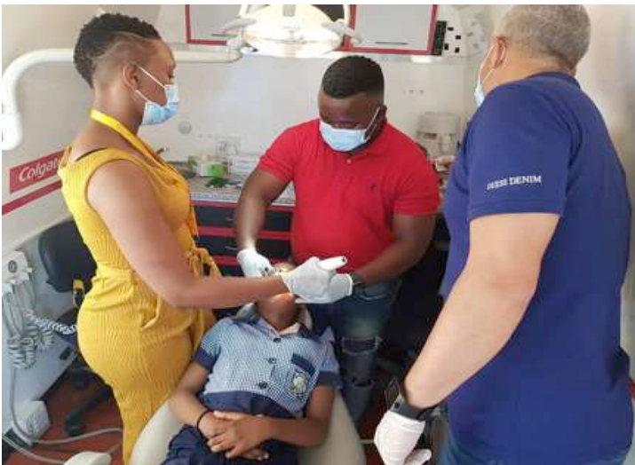
John Mdluli Primary School kid getting her teeth cleaned by dental specialists