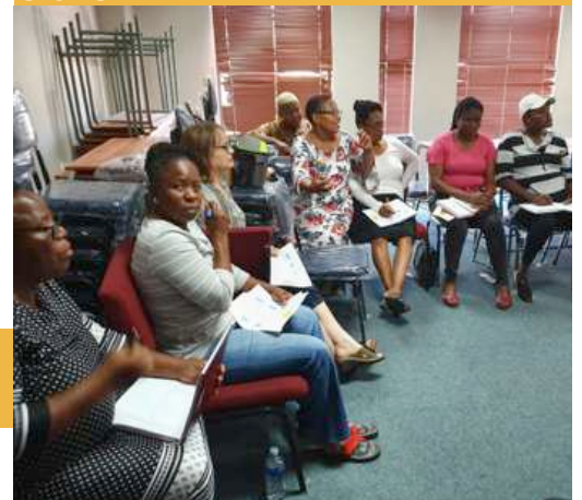
Patient safety workshop Commissions Ehlanzeni District