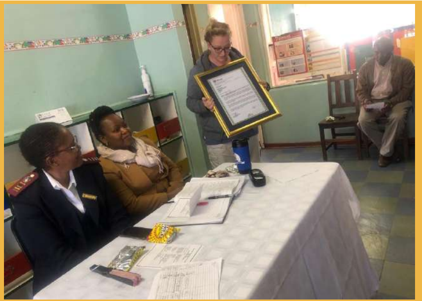
Barbeton hospital staff after accepting the appreciation certificate in the presence interfaith organisations