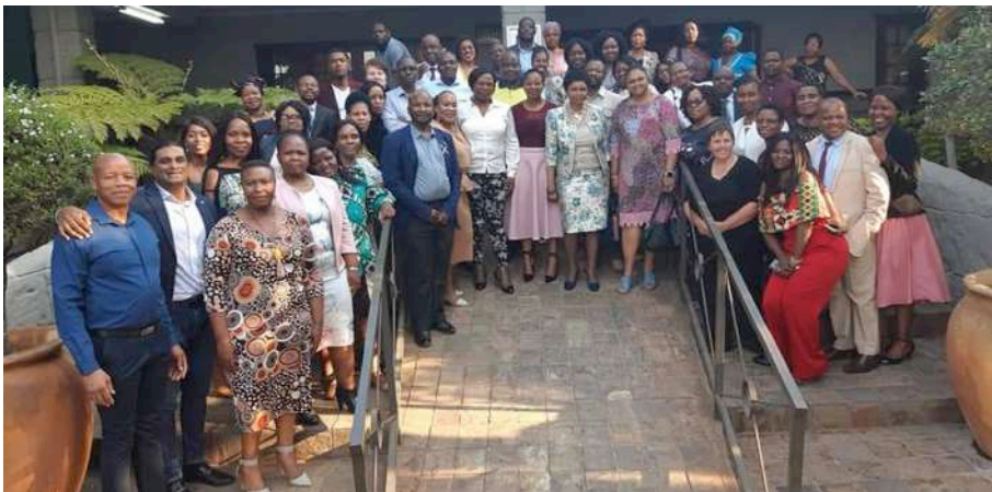
Group picture: attendees of the Healthcare Quality and Patient Safety Mini Academy workshop