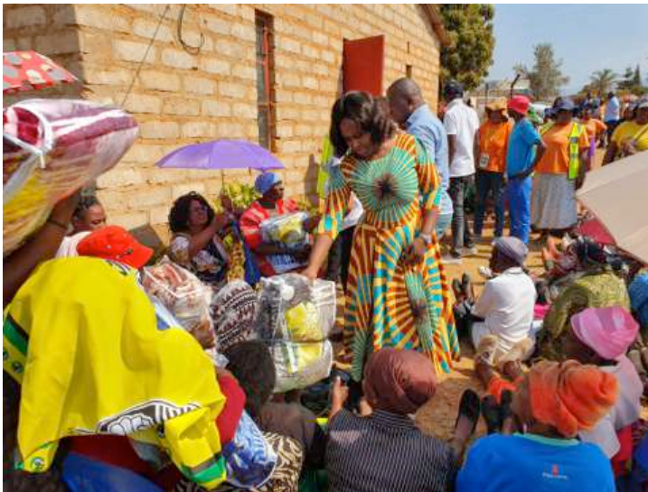
MEC Sasekani Manzini donating blankets to elderly people