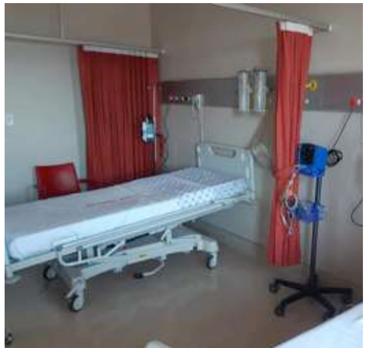
Oncology ward at Rob Ferreira hospital.