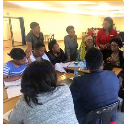
Patient safety workshop commissions Nkangala District Commissions