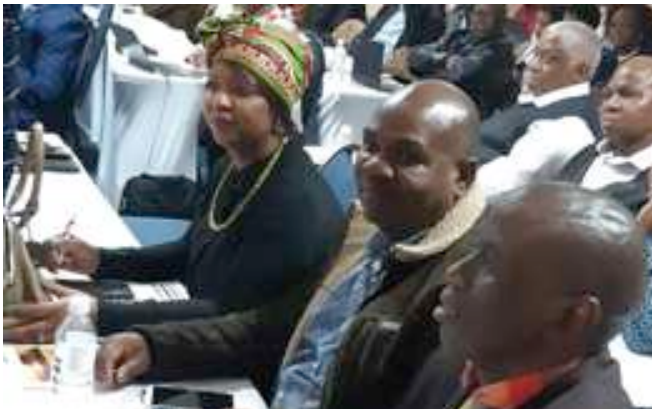
Some of the delegates at the strategic planning session.

Remember we are called public servants for the fact that we have to serve our people and hence we are not driven by making profits like those in the private sector but to serve the people of the country and the province”.