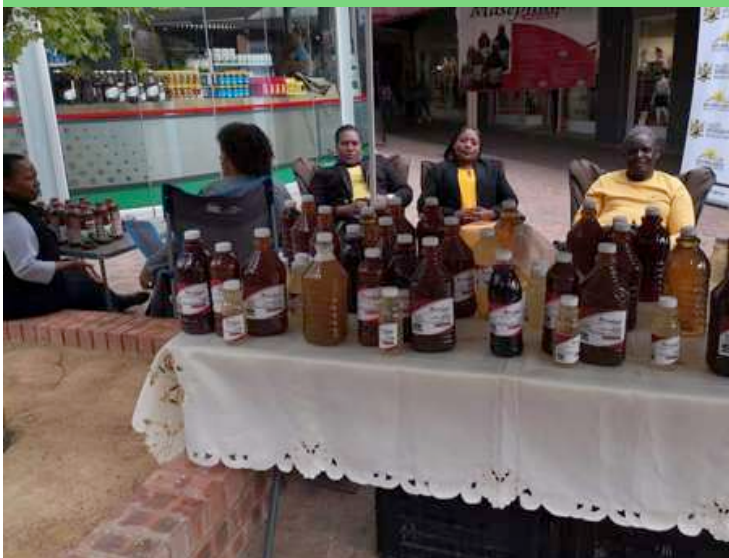
Bogogo displaying african medicine