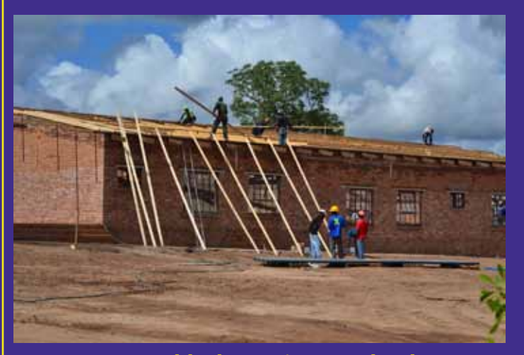
KaMhlushwa Primary School