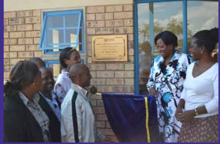
Cyril Clarke Secondary School