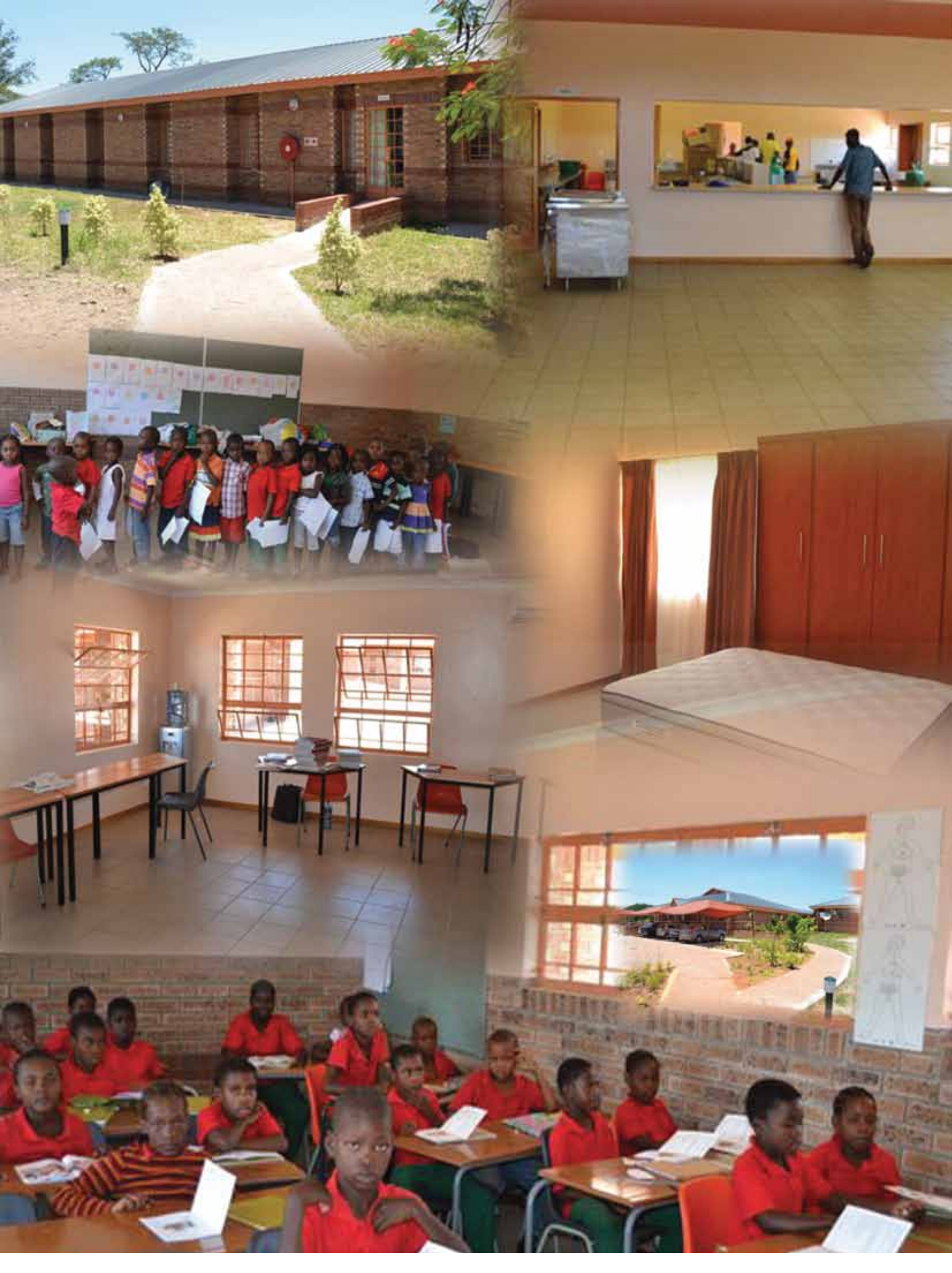
"We reiterate our position and willingness to ensure that all our schools are in a safe and sound condition for the enhancement of teaching and learning."