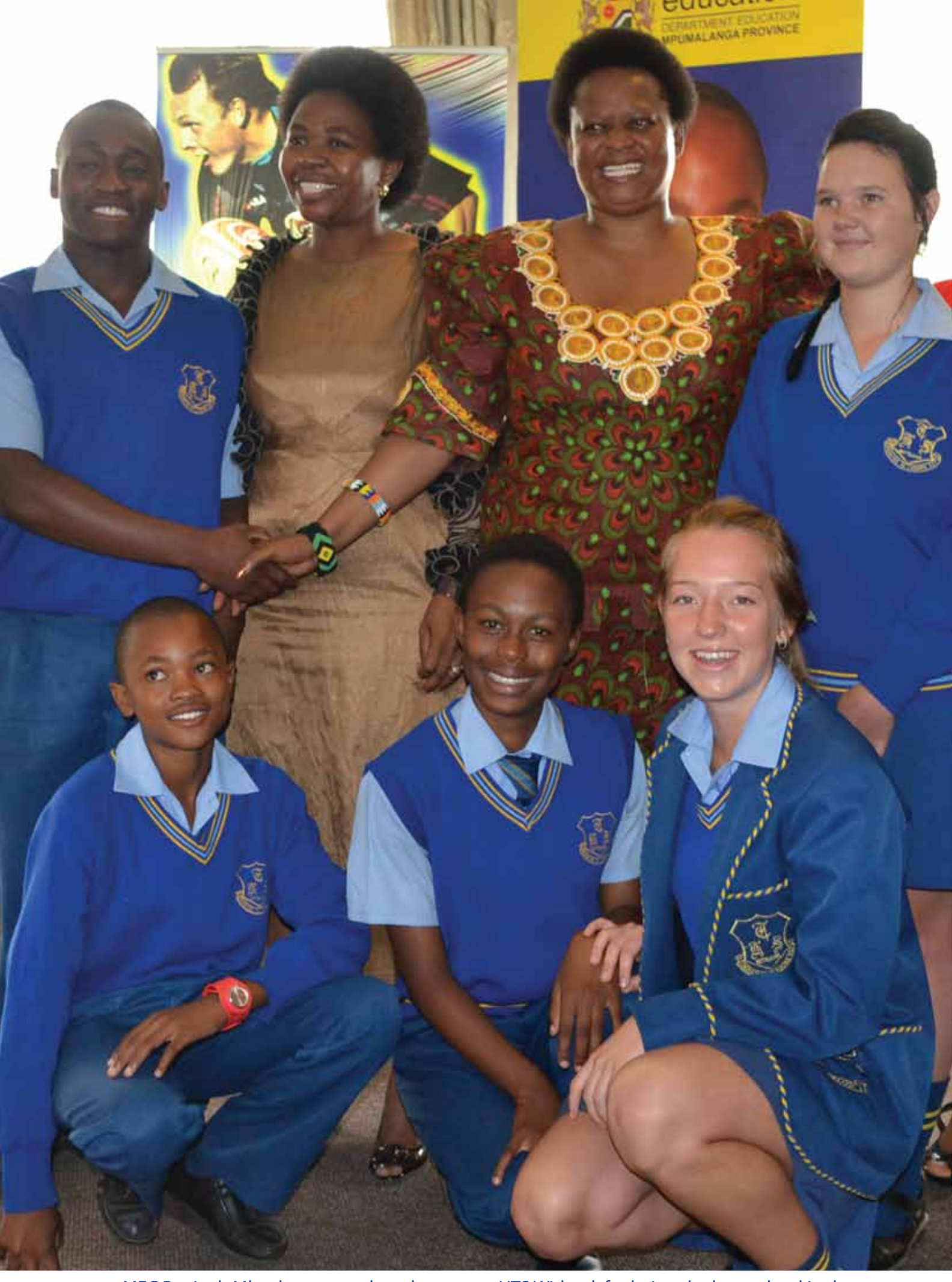
MEC Reginah Mhaule congratulates learners at HTS Witbank for being the best school in the Province following the 2011 Grade 12 Examinations in the presence of the Executive Mayor of Emalahleni Municipality, Cllr Salome Sithole