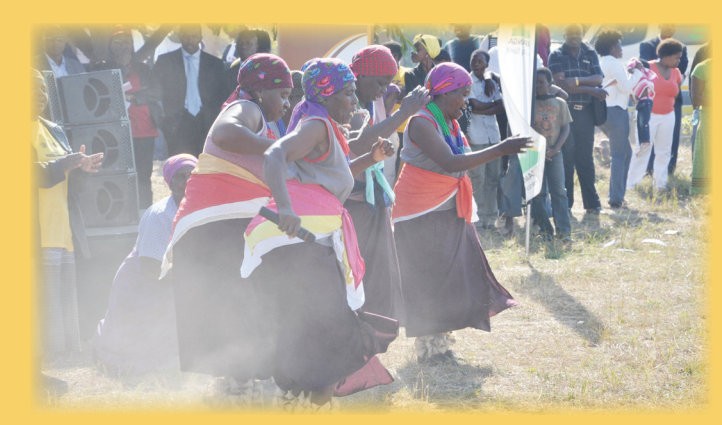
DANCING FOR SERVICES: Senior citizens of Casteel welcome the launch of services in style.