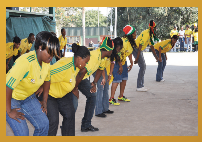
COUNT DOWN: COGTA official do the Diski dance during a competition in the Lowveld Show Ground.