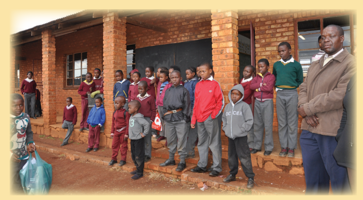
HOPEFUL: Learners at the Hountenbek Primary school waited patiently for the delivery of the uniforms for their under priviledged school mates.

The uniforms included two sets for each child of school shoes, shirts, jerseys, socks, skirts and trousers were handed over to two high school students from Tonteldoos Secondary School and three from Hountenbek Primary school.