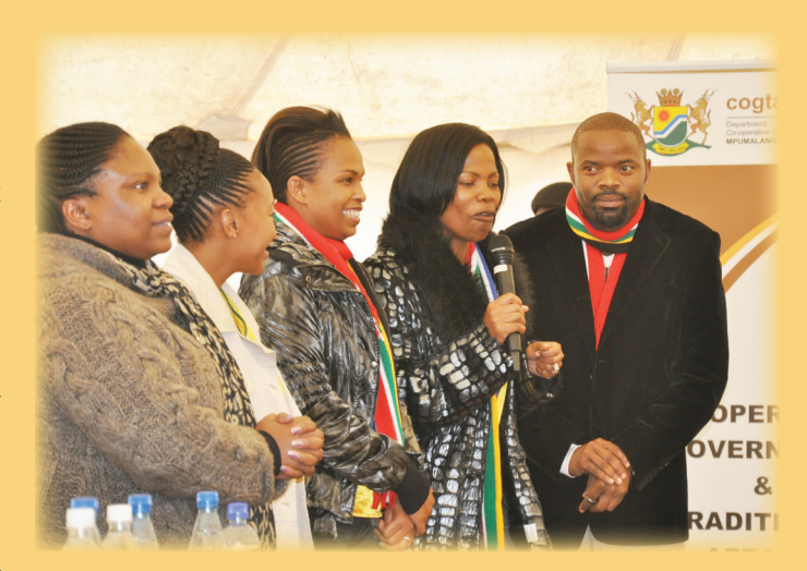
SUPPORTING ACT: Generations stars graced the occasion.

The function was marked by the presence of Generations stars and Ligwalagwala FM Presenters. The switching on of the transmitters will also benefit residents of Josephsdaal, Nhlaba, Sternsdorp and Bossiville.