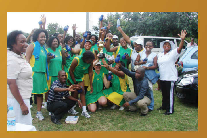
TRIUMPH: Cogta Netball Team celebrates victory after winning the annual Inter-Departmental games by beating the Premier's Office Netball team.