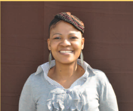
Cllr. Matsidiso Marajana Mayor: Lekwa Local Municipality