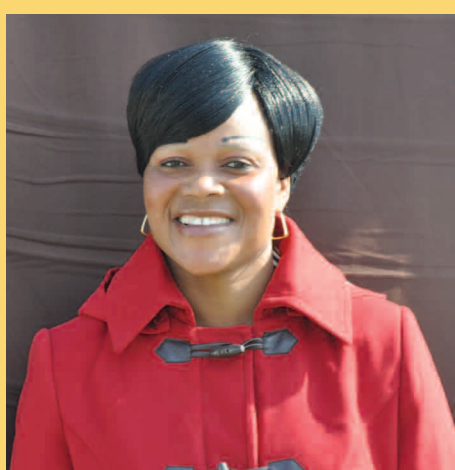
Cllr. Thulisile Khoza Mayor: Nkomazi Local Municipality