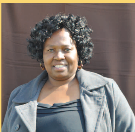
Cllr. Lettie Masina Mayor: Govan Mbeki Local Municipality