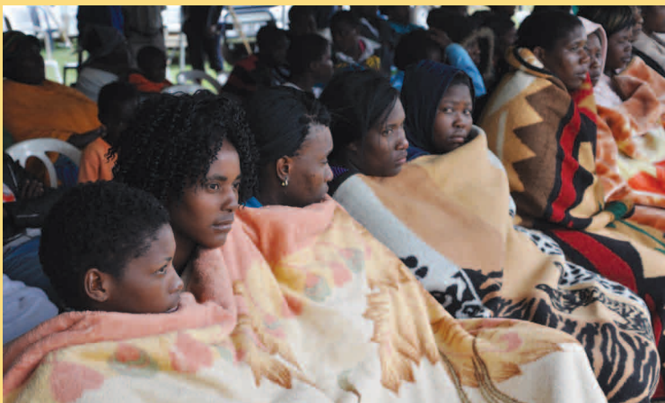
UNFAVOURABLE WEATHER: Local residents defied the cold weather to attend the Mantjolo cultural pilgrimage.