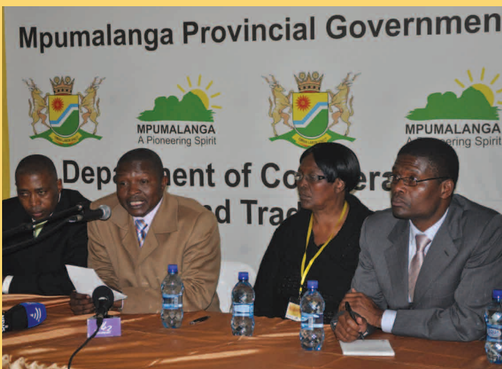
SOUND BYTE: Premier David Mabuza addresses the media during the local government inaugural indaba at the Mbombela Stadium. He is flanked by MEC Masuku and Ehlanzeni Mayor, Cllr Letta Shongwe (right) and Nkangala District Mayor, Cllr Speedy Mashilo.