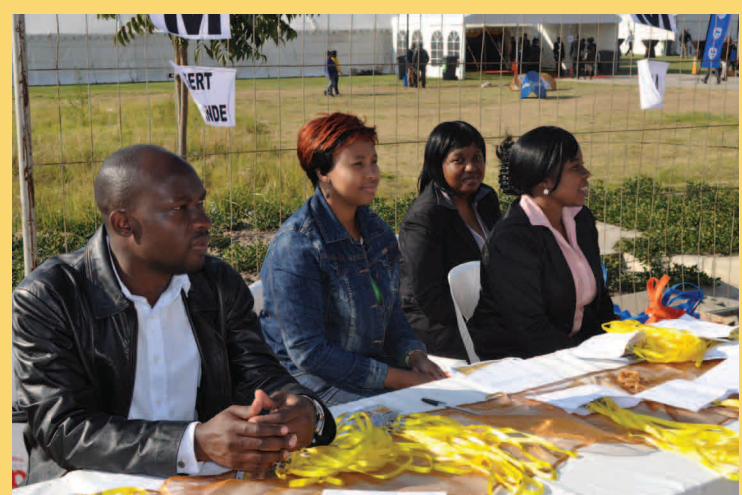
CONFIRMATION: COGTA's officials prepare logistics ahead of the Local Government Inaugural Indaba at the Mbombela Stadium