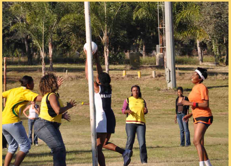
PHYSICALLY FIT: COGTA's officials playing netball during the health and wellness day at Lowveld Agricultural College