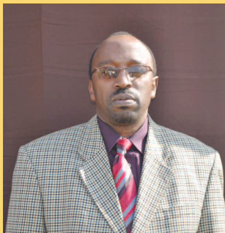
Cllr. Sipho Bongwe Mayor: Msukaligwa Local Municipality