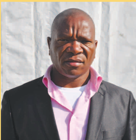
Cllr. Bhekabani Mtshali Mayor: Mkhondo Local Municipality