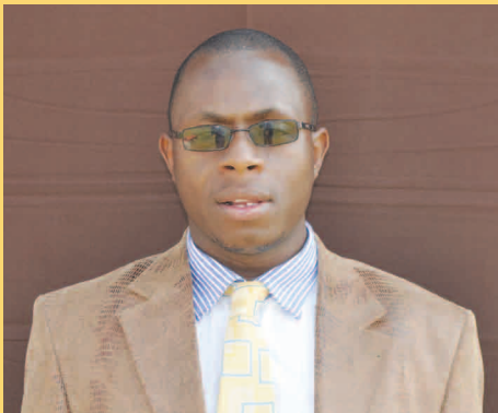
Cllr. Hamza Ngwenya Mayor: Emakhazeni Local Municipality