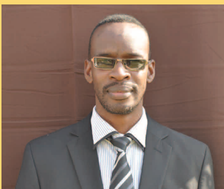
Cllr. Phalaborwa Malatsi Mayor: Pixley Ka Isaka Seme Local Municipality