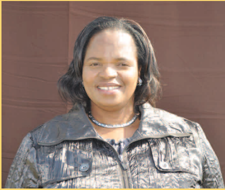
Cllr. Cathrine Dlamini Mayor: Mbombela Local Municipality