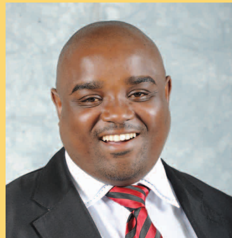
Cllr. Kgotso Motloun Mayor: Gert Sibande District Municipality