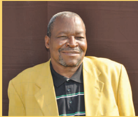
Cllr. Ndaweni Mahlangu Mayor: Thembisile Hani Local Municipality