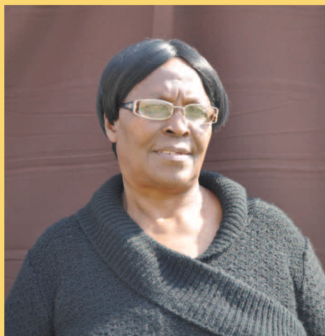
Cllr. Lettah Shongwe Mayor: Ehlanzeni District Municipality