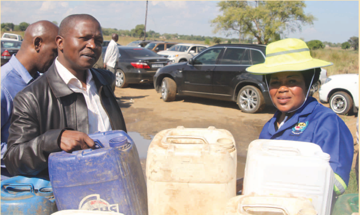
WATER SOLUTION: Premier Mabuza investigates the source of water crisis in the Nkomazi region. He is accompanied by the Nkomazi Executive Mayor, Cllr Thabisile Khoza.

To address the escalating water crisis in the province, Mpumalanga Premier David Mabuza has tasked the Mpumalanga Economic Growth Agency (MEGA) to investigate as to how much it would cost to upgrade the existing and to build a new water infrastructure where necessary for the province.