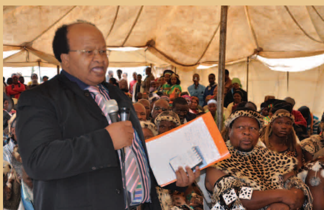
ROYAL CLAIM: A community member of the KwaNgabulo neighbourhood makes a presentation before the committee during public hearings for the recognition of the Ntombela-Mahlobo Kingship.