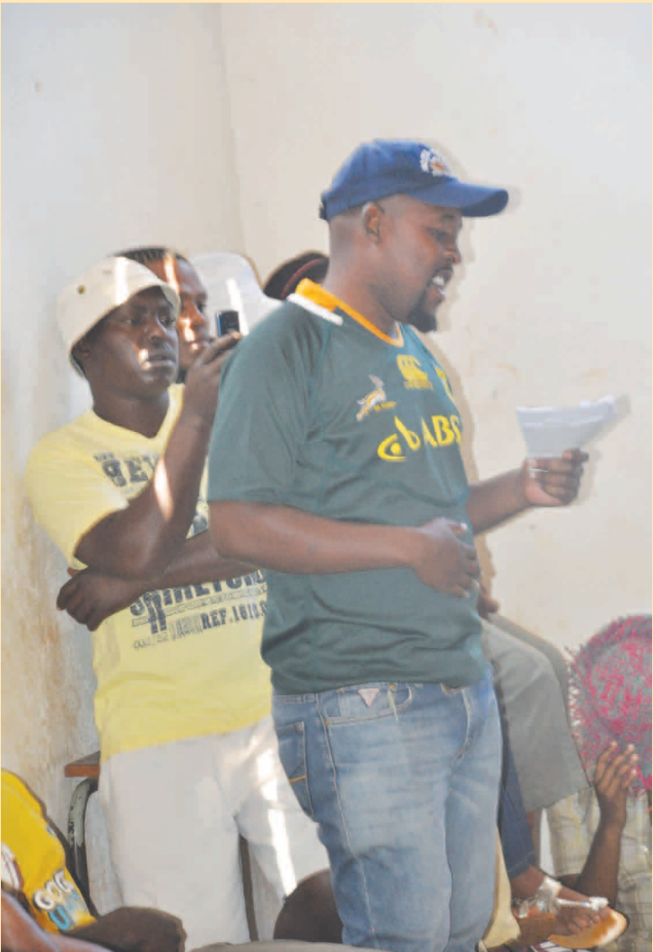
DEBATE: Young people engage health experts about the dangers of drugs in Leroro.