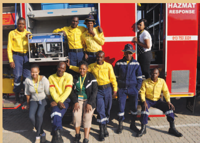
PREVENTION: COGTA's officials team up with fire-fighters to assemble a machine in a truck during a display session at the end of a fire-fighting workshop at the Disaster Management Centre.