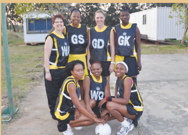
TEAM SPIRIT: COGTA's Netball Team prepares to play against the Department of Public Works, Roads and Transport in a friendly game.