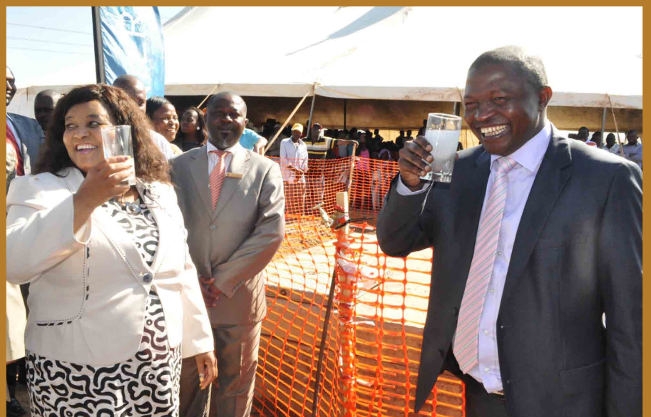
WATER FOR ALL: Minister Molewa and Premier Mabuza taste water from Inyaka Dam.

Premier David Mabuza who accompanied Minister Molewa in Bushbuckridge, reassured residents that all households should have access to water by January 2014. "I want you to have water for drinking, cooking, washing and for bathing. For Mpumalanga to grow, we need water", Mabuza said. He further urged residents to use water sparingly. "Make sure that you do not waste it. Stop illegal connections," he urged them.