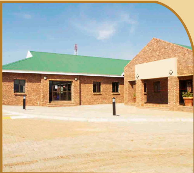
HOPE: The new Mashishing TSC is a catalyst of development for the local community.