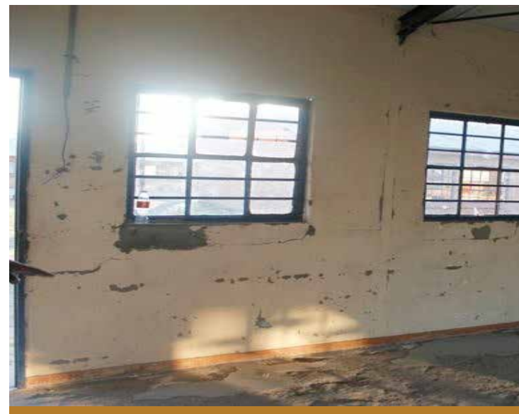
PRIORITY: The poor state of the Nthoroane Secondary School was improved in Balfour.

The power station says the implementation of the renovation of the school seeks to improve the lives of the local community and to improve learning conditions thereby encouraging learners to attend classes daily.