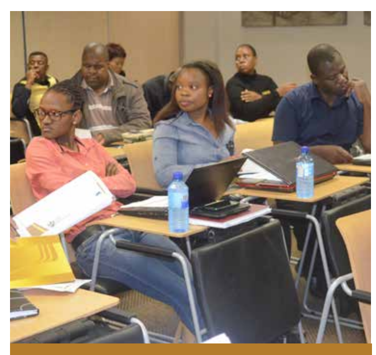
POINT TAKEN: COGTA officials listening attentively during the IDP assessments at Ehlanzeni District Municipality

fill the critical vacant posts of section 56/57 managers thus improving institutional development. National and provincial sector support remains critical for Integrated Development Planning.