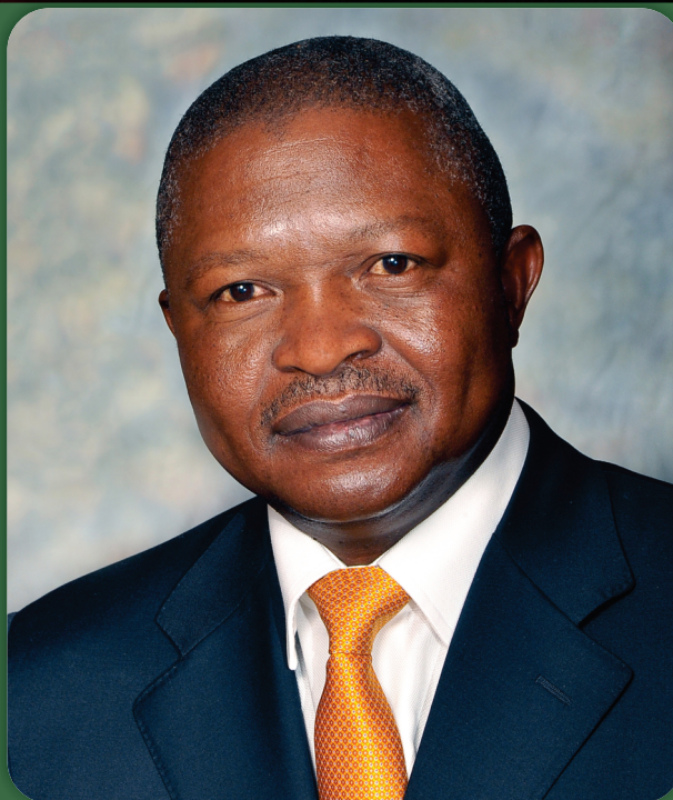
Hon Premier DD Mabuza, Mpumalanga Province

“ W hen the ANC declared the Year 2017 as the year of Oliver Tambo, it was not a statement of convenience – but a clarion call for all South Africans to reflect on the life of this selfless servant of our country as we confront and tackle the challenges of our times.