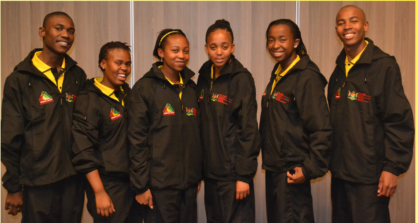
Mpumalanga Road Safety Ambassadors who represented the province at National Road Safety Debates held in Durban recently.

M pumalanga Road Safety Ambassadors have made it to the semi-final in the National Road Safety debate in KwaZulu Natal. Representing the Mpumalanga Province, at least six learners from different regions of the province and schools carried the flag of the province to compete with other learners from other provinces.