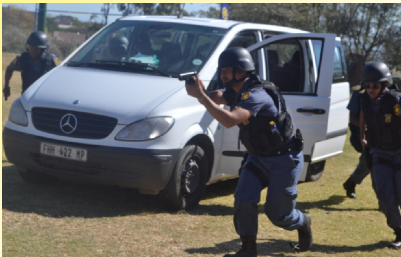
Chikunga has called for police to protect themselves when their lives are in danger.