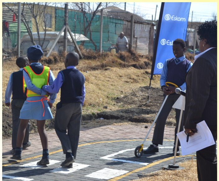
Some of the learners who participated during the launch of JTTC in Gert Sibande Region.