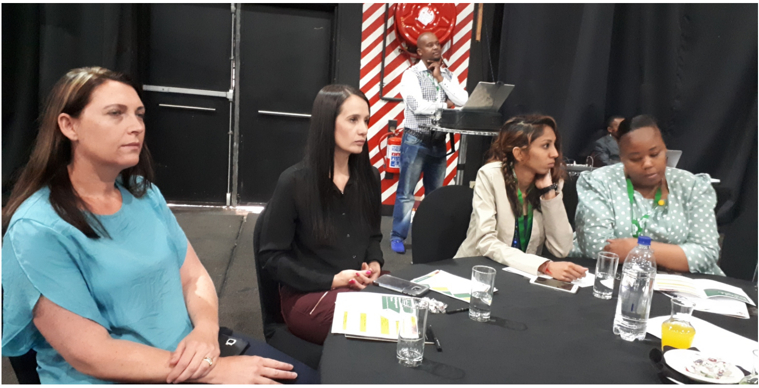
Delegates listening attentively to the presentations during the Internal Audit and Risk Management Forum held at Graceland on the 14th September 2017