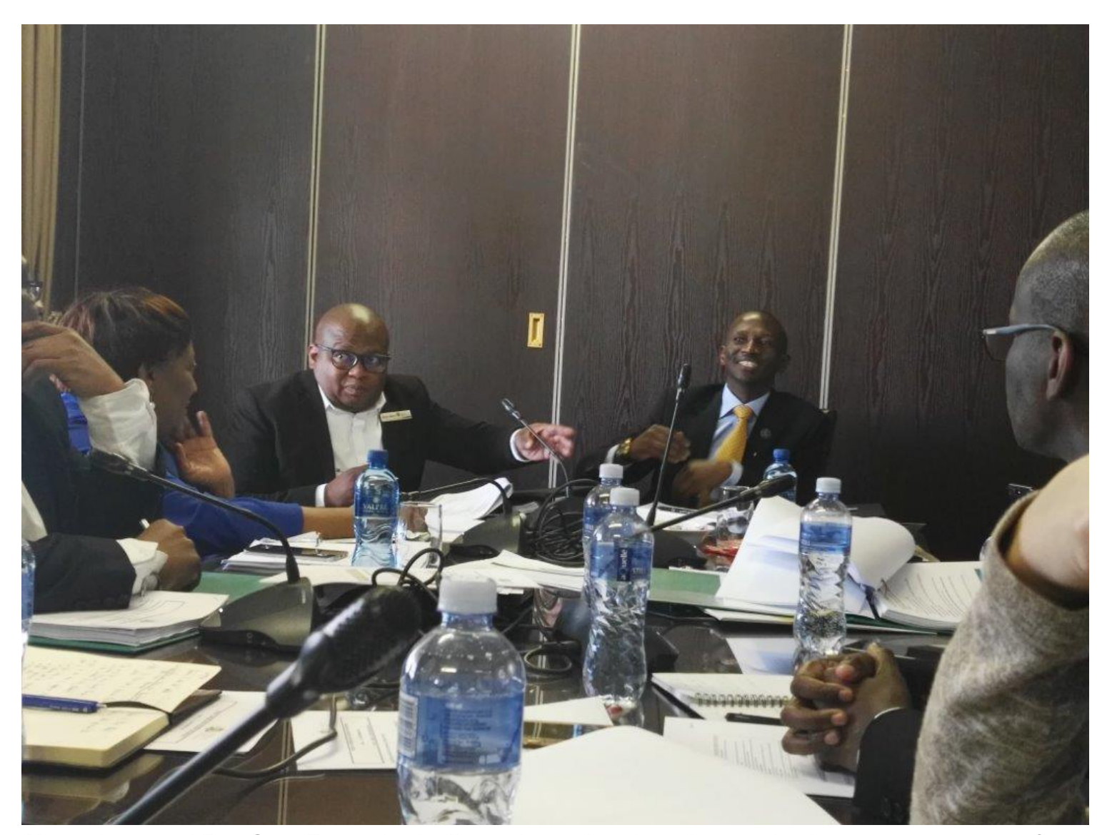
Mpumalanga and Free State Treasuries in discussion on how best they can implement procurement reforms