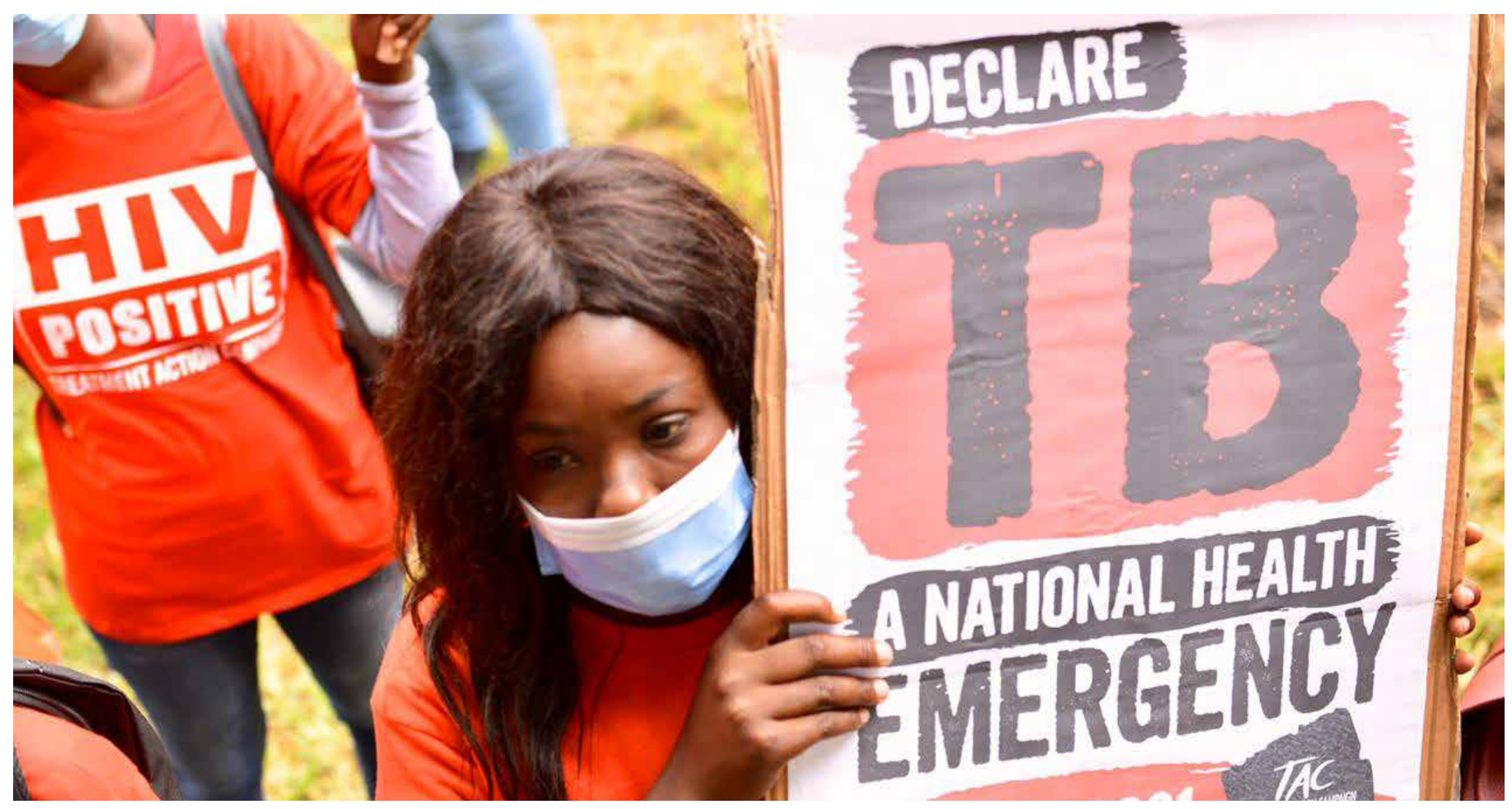
TAC member holding a placard demanding for TB to be treated as a health emergency.