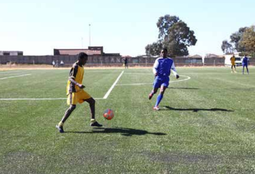
(L) A community member works out at the outdoor gym. (R) Napoli FC and Young Madrid FC christen the artificial turf in an exhibition match.