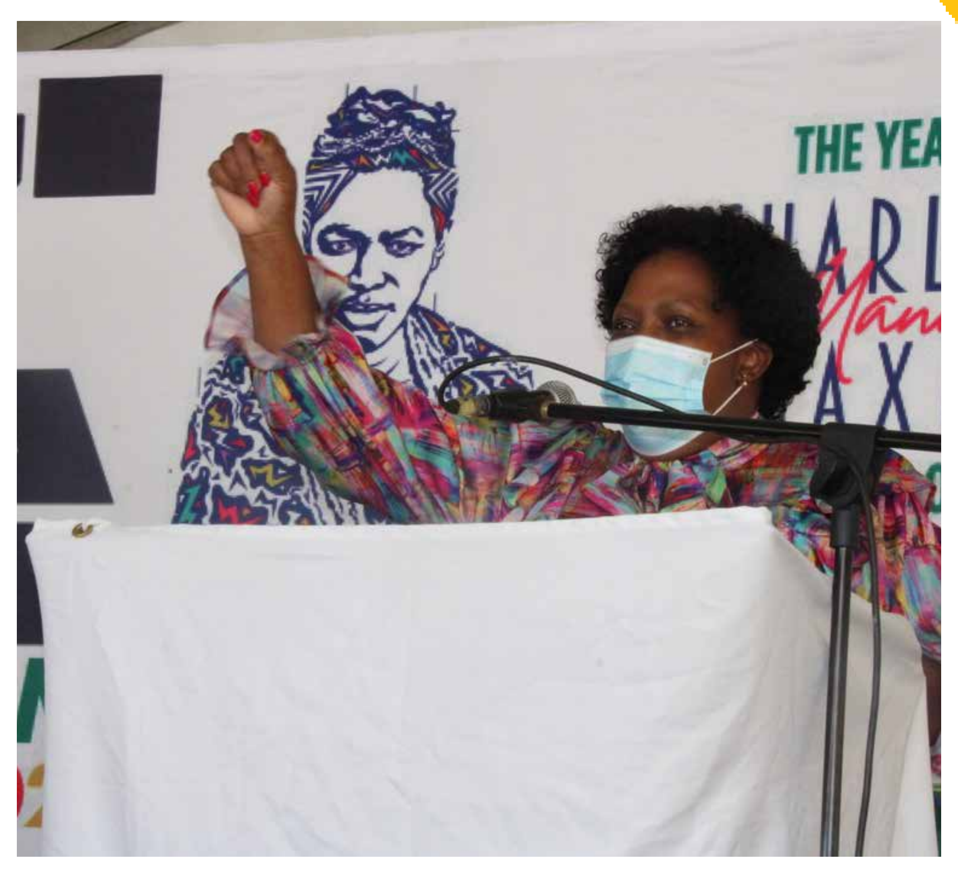
Premier Refilwe Mtshweni-Tsipane raising her clenched fist during the Freedom Day celebration at Balfor, Dipaleseng Municipality.