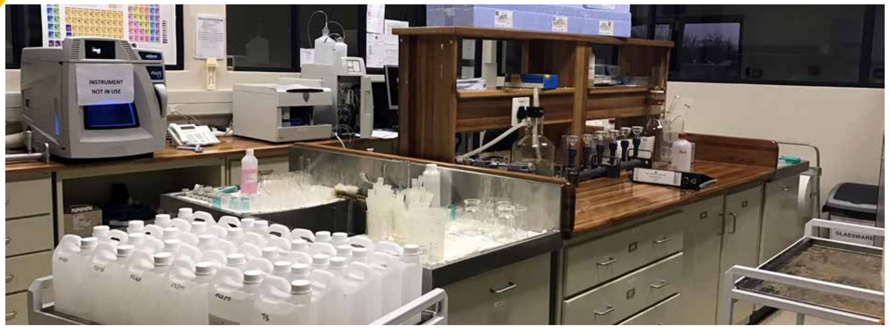
Water Quality Testing Laboratory front view.