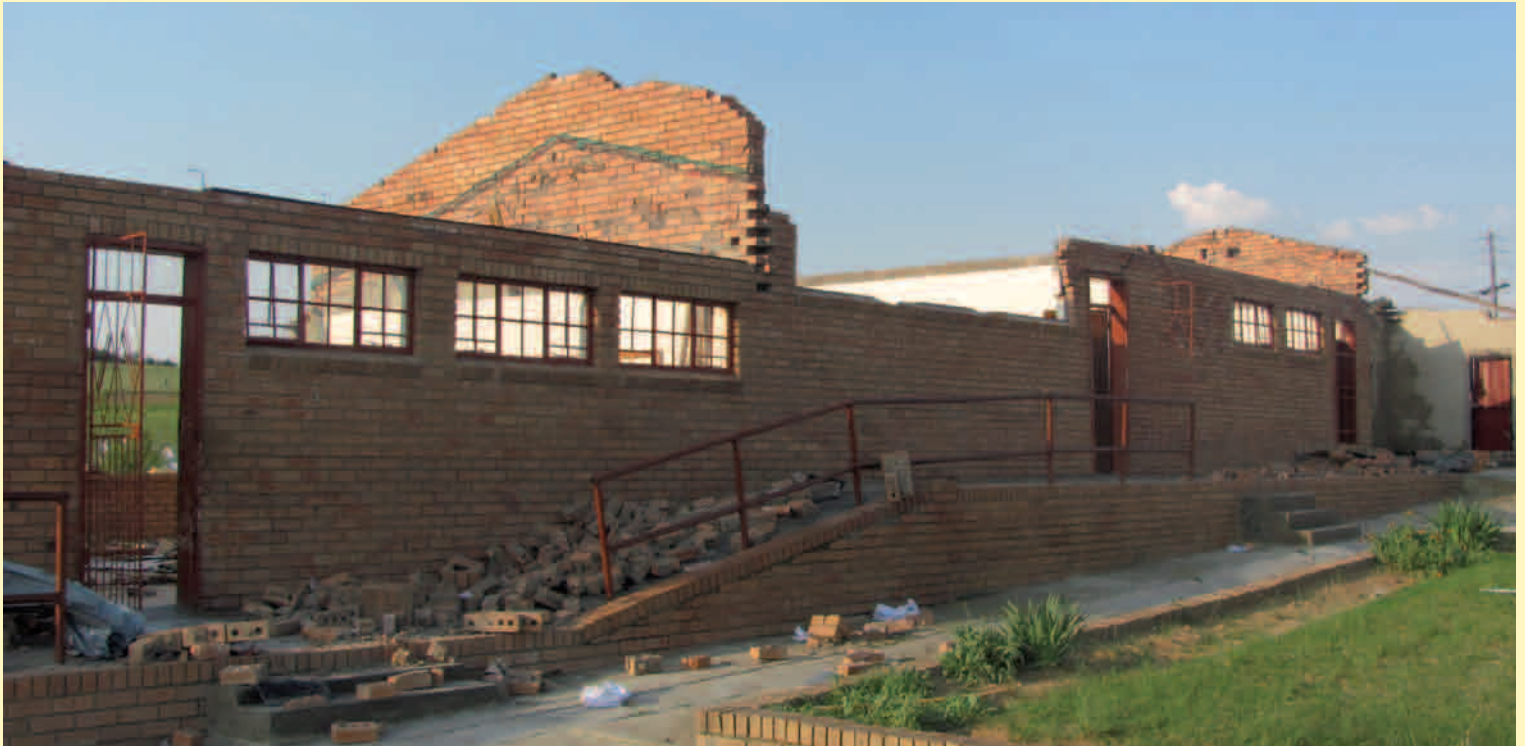
DEVASTATION: The Syde Primary School was left with no roof top when a tornado ravaged Dundonald.

Local residents of Dundonald in the Albert Luthuli Local Municipality bore the brunt of a storm which left a trail of devastation. Several families were left homeless as the storm blew away roof tops of their houses. The affected families had to salvage what was left as their furniture and other belongings were also blown away. Domestic animals became casualties. Several goats, chicken and dogs were found dead while others sustained injuries. Electricity poles were swept away due to the persistent rain, leaving residents without power. Trees were uprooted.