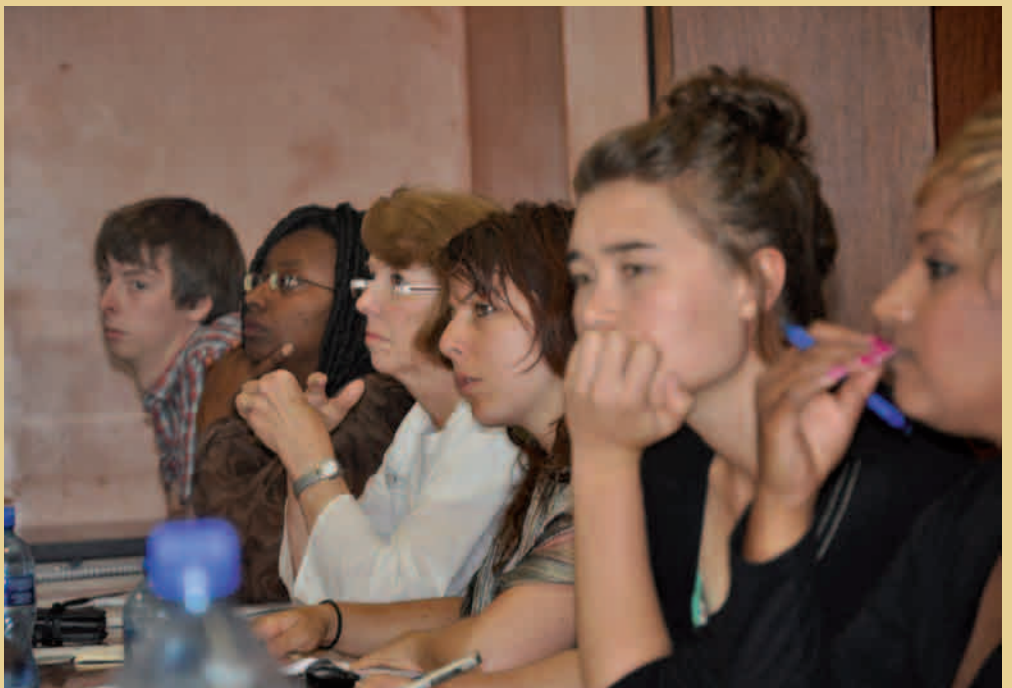
SPELL BOUND: Australian students take keen interest of discussions during the visit.