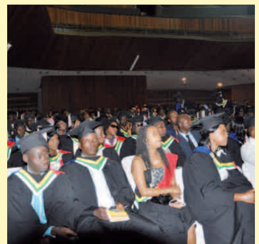
CATALYSTS OF CHANGE: A group of Community Development Workers attended the graduation ceremony at eMalahleni's Civic Theatre.

CDWs are expected to perform their duties with passion about community development. They are also expected to know people better and their circumstances and deepen insight into people's needs and resource and have good interpersonal skills so that they interact easily with them based on their cultural backgrounds.