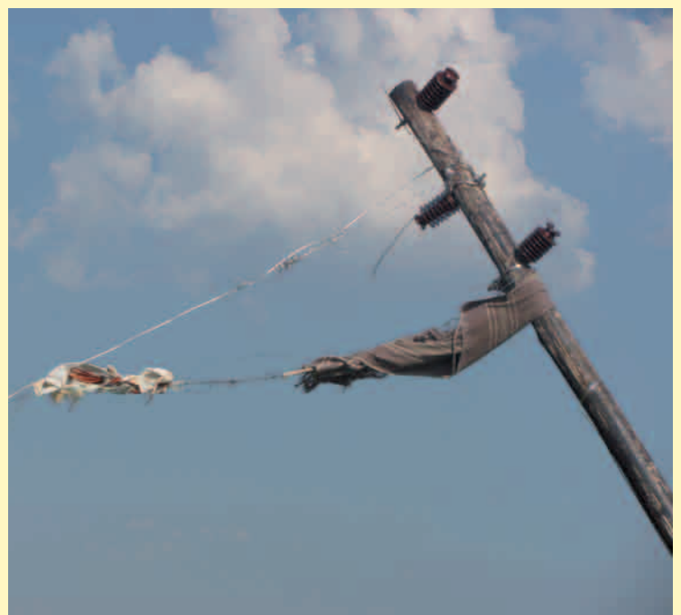
POWERLESS: Residents were left without power when electricity poles were swept away by the storm.

The Department appeals to communities to report any disaster in their area by phoning the following Disaster Toll Free number: 0800 202 507