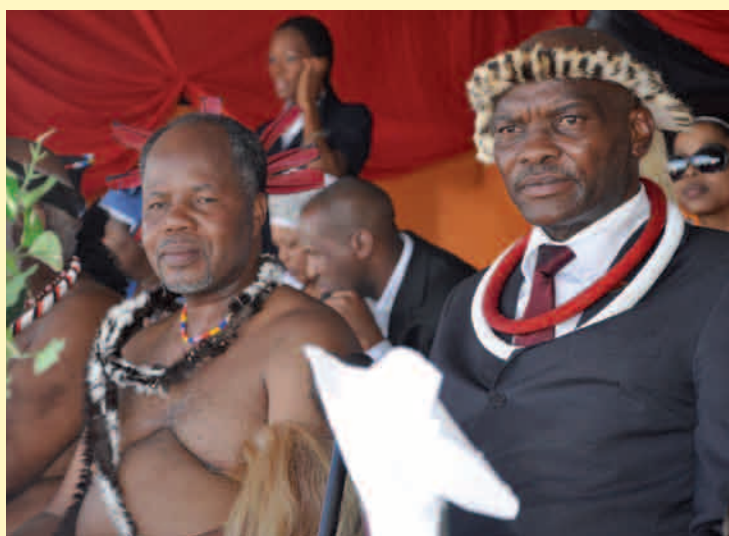
CULTURAL MIX: Chief Makhosonke Dlamini of Embhuleni welcomes King Makhosoke II of AmaNdebele during a traditional pilgrimage in Badplaas.