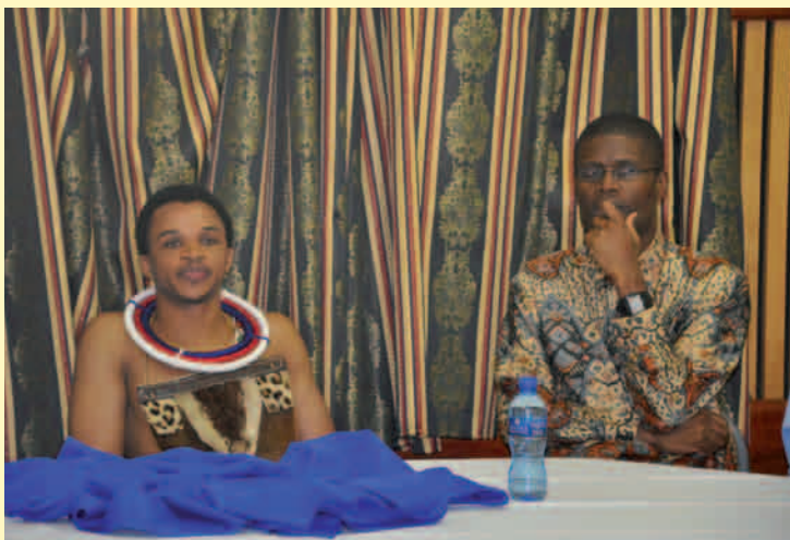
PARTNERSHIP: King Mabhoko III of the Nzunza clan and MEC Madala Masuku wait for the start of proceedings ahead of the Ministerial visit to the King in Kwamhlanga.