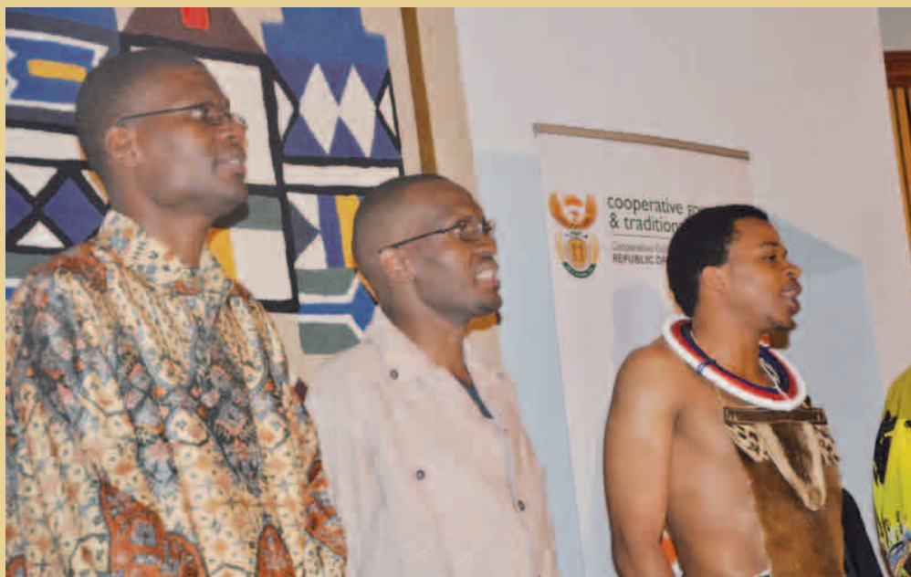
TRIBUTE: MEC Madala Masuku and Minister Shiceka pay homage to King Mabhoko III as they sing a traditional song for him.

The Minister of Co-operative Governance and Traditional Affairs (Cogta), Mr Sicelo Shiceka has appealed to King Mabhoko III to help develop his people. Mr Shiceka was addressing a function during a visit to the King in Kwamhlanga Government Legislature, as part of his Ministerial visit to Kings to discuss service delivery and governance.