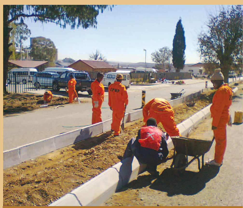
ROAD WORKS: Paving of the road island at Pertunia street became part of the road construction in Balfour.

The construction of the road provided the much-needed income relief to the local communities facing an acute shortage of jobs and training opportunities. Although sixteen job opportunities were created, however, it is still below the 258 target set by the municipality as a contribution to the Expanded Public Works Programme (EPWP). The number is expected to increase in view of the number of projects underway, which include the expansion of the Balfour Sewer Treatment Plant, the construction of a new Landfill site in Balfour/Siyathemba, upgrading of water reticulation and expansion of the sewer works in Grootvlei.