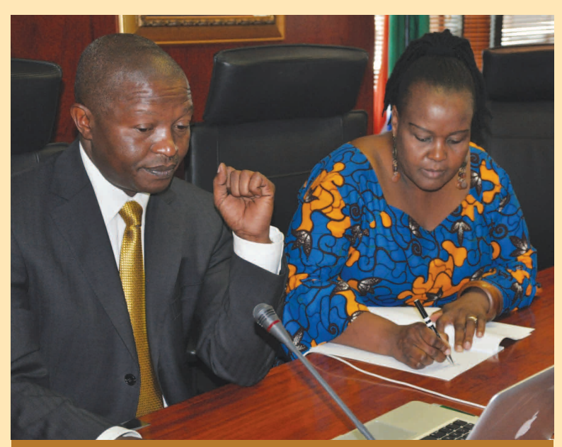
PRE-CURSOR: The signing of a Memorandum of understanding between Premier David Mabuza and Executive Mayors for water-delivery has resolved the shortage of water in Mpumalanga.

The commitment by Premier David Mabuza to prioritize water solution is gaining momentum. In his State of the Province address last year, Mabuza told the nation: "Our efforts will be geared towards increasing the storage capacity of the reservoirs, expand the bulk water treatment works, expanding the water source and increase the capacity of waste water treatment works".