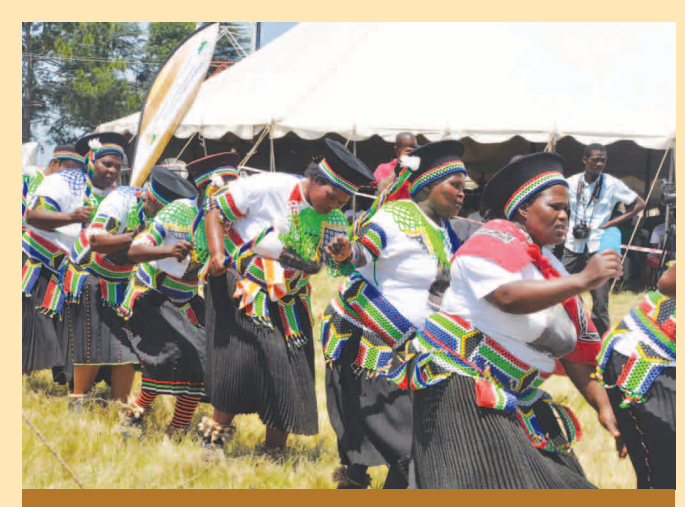
DANCING FOR THE KING: Women in traditional gear entertain guests during the Mahlobo inauguration.