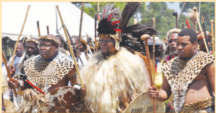
RECOGNITION: Local regiment of KwaNdwalaza sings traditional songs of celebration following the restoration of Inkosi Mahlobo.

The inauguration was attended by MECs, Executive Mayors, members of the various royal councils, Senior government officials and were entertained by traditional dances.