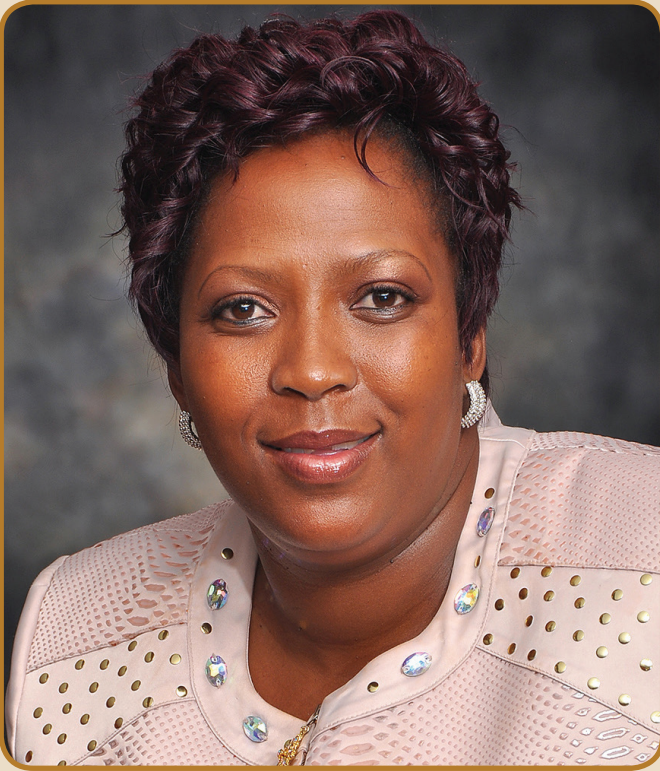
HON. RM MTSHWENI (MPL) MEC FOR COGTA

Our department is celebrating the clean audit outcome from the Auditor-General (A-G) for the 2013/14 financial year. This achievement is no mean feat and is proof enough that the department is committed to proper utilization of public funds. The A-G is a Chapter 9 institution with a mandate to verify independently the financial statements of all public institutions. This outcome could not be possible without the high level of commitment by the officials in the department at all levels. I would like to commend them for this achievement. We must make this a permanent objective in order to boost the public confidence about the utilization of their funds.