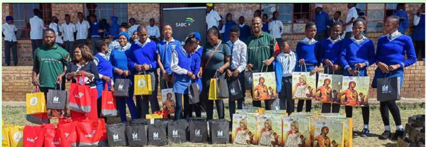
Gift of the Givers donated food parcels and learner support materials to the Engabezweni Secondary School learners under Emanzana Circuit on 05 May 2023