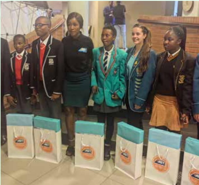
ABT World sponsored with ten laptops.