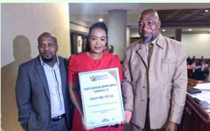
Old Mutual sponsored with ten travel cases.