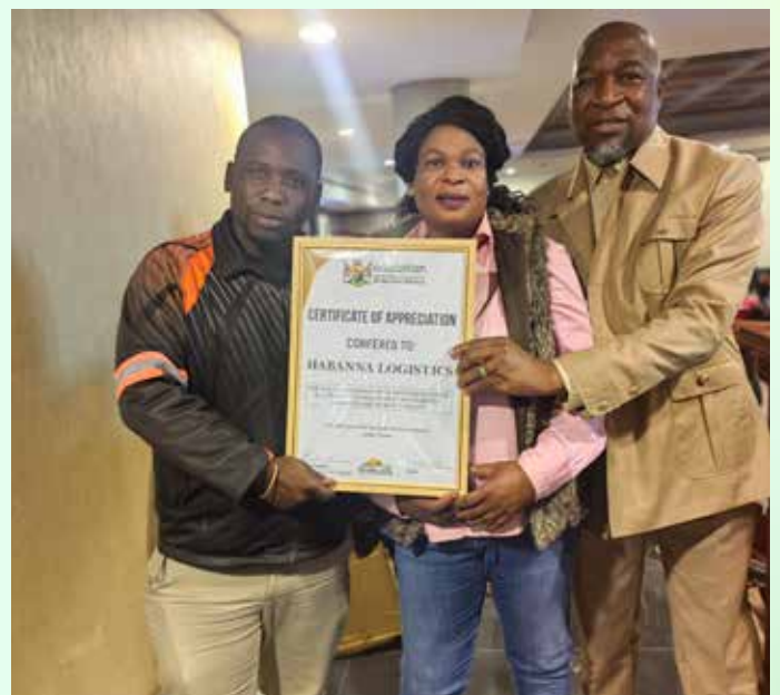
Habanna Trading PTY LTD sponsored with five Microwaves and ten Paninis.