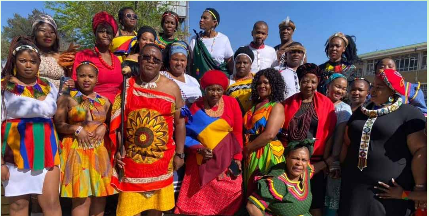
Petrus Maziya Primary School at Highveld Ridge West Circuit Celebrated its Heritage Day