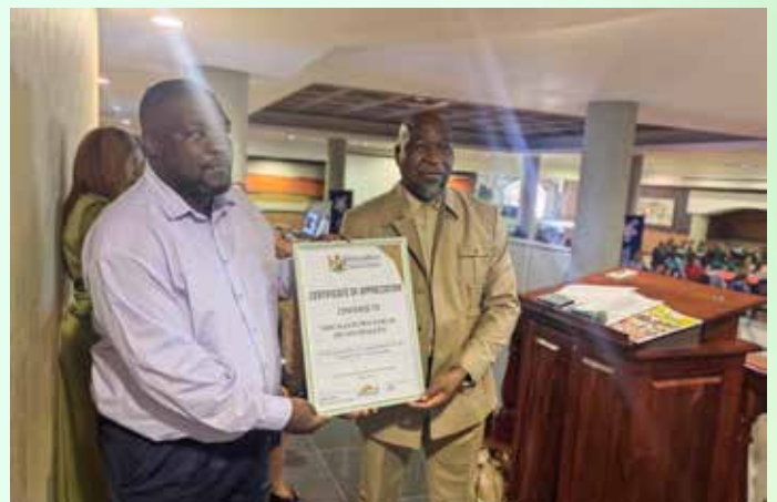
Msukaligwa Local Municipality sponsored with ten luggage bags to the Top Ten learners of their municipality.