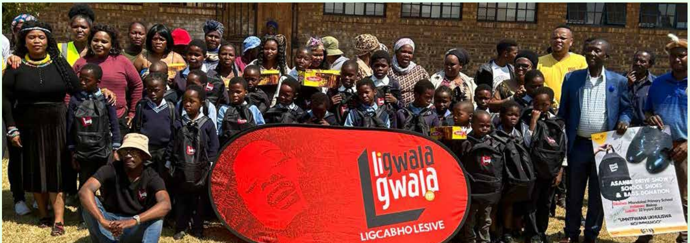
Ligwalagwala FM donated 30 Pair of shoes to Mlondozi Primary School learners under Mashishila Circuit on 22 September 2023