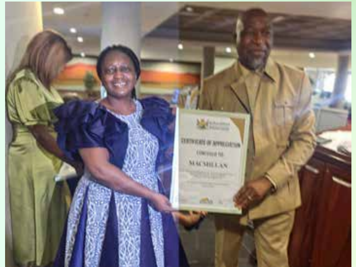
Macmillan sponsored with educator packs.