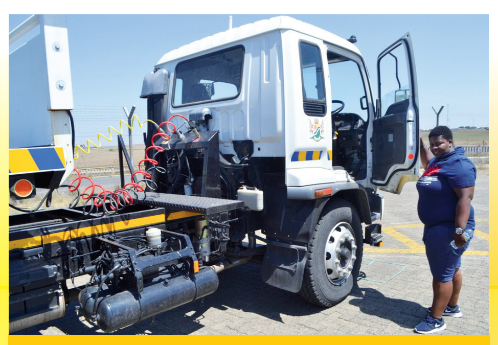
One of the competitors, Ms. Zandile Hlatshwayo doing a pre trip inspection before taking to the road.

Ithough the heavy motor vehicle industry is dominated by men, Mpumalanga female drivers say they are not threatened.