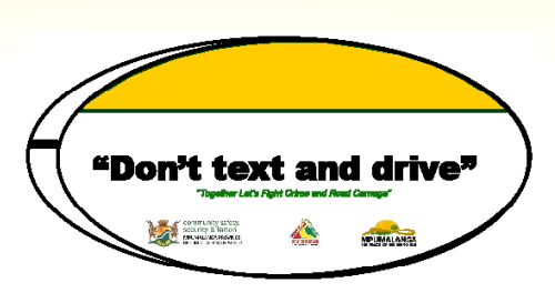
By: Justice Nyalunga

With Nyamsoro, motorists are allowed to pay on the spot through electronic payment system that is fitted in the vehicles.