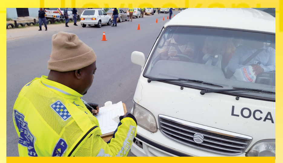
Public Transport operators should play their part in road safety by ensuring roadworthiness of their vehicles

He has further called on public transport owners to ensure that they transport learners in vehicles that are roadworthy.