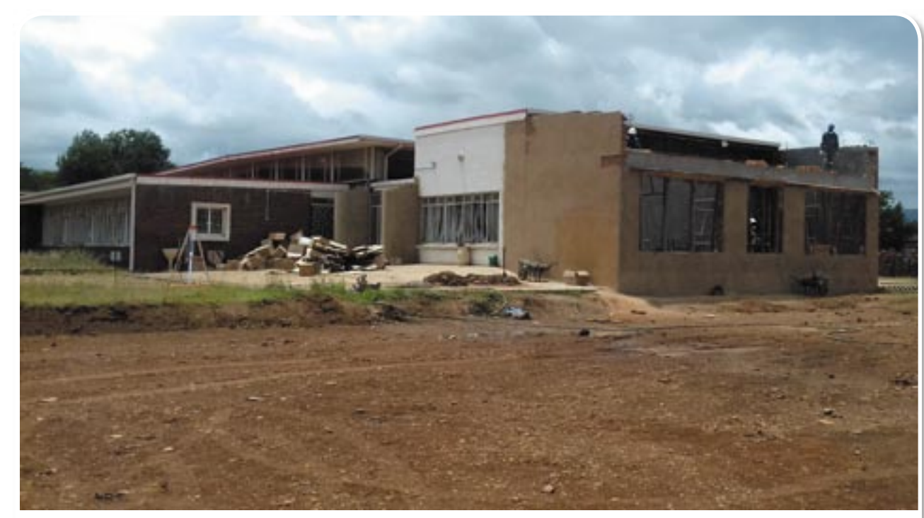
A READING NATION IS A SUCCESSFUL NATION: Mashishini Regional Library under construction.

wo communities from Thaba Chweu and Bushbuckridge Local Municipalities respectively stand to benefit from the construction of a new library and upgrading of another.