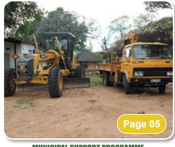
MUNICIPAL SUPPORT PROGRAMME A MAJOR BOOST ON ROAD MAINTENANCE