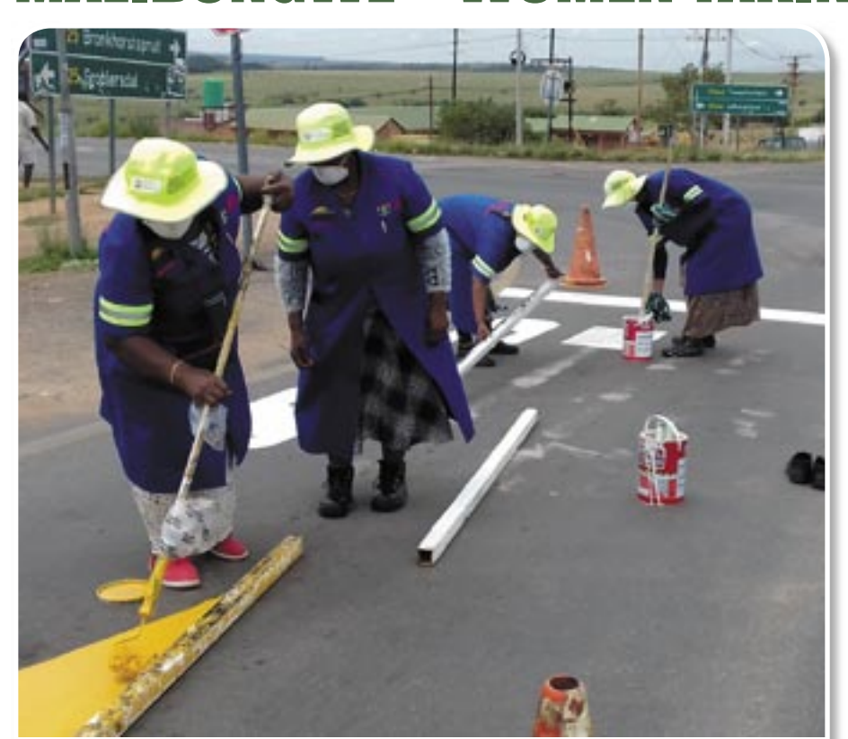
THE RIGHT MARK: Kwaggafontein Cost Centre officials marking P95 road near Verena.

he harsh working conditions on the roads will never deter the perseverance and commitment which a maintenance team from Kwaggafontein Cost Centre display when conducting their daily duties on the road. A maintenance team comprising of nine women is marking roads, cutting grass and clearing the cut ridge in some of the major roads around Nkangala District. The team was spotted marking the P95 road near Verena and explained to @Work how they manage to keep the roads around the district in a well maintained condition.