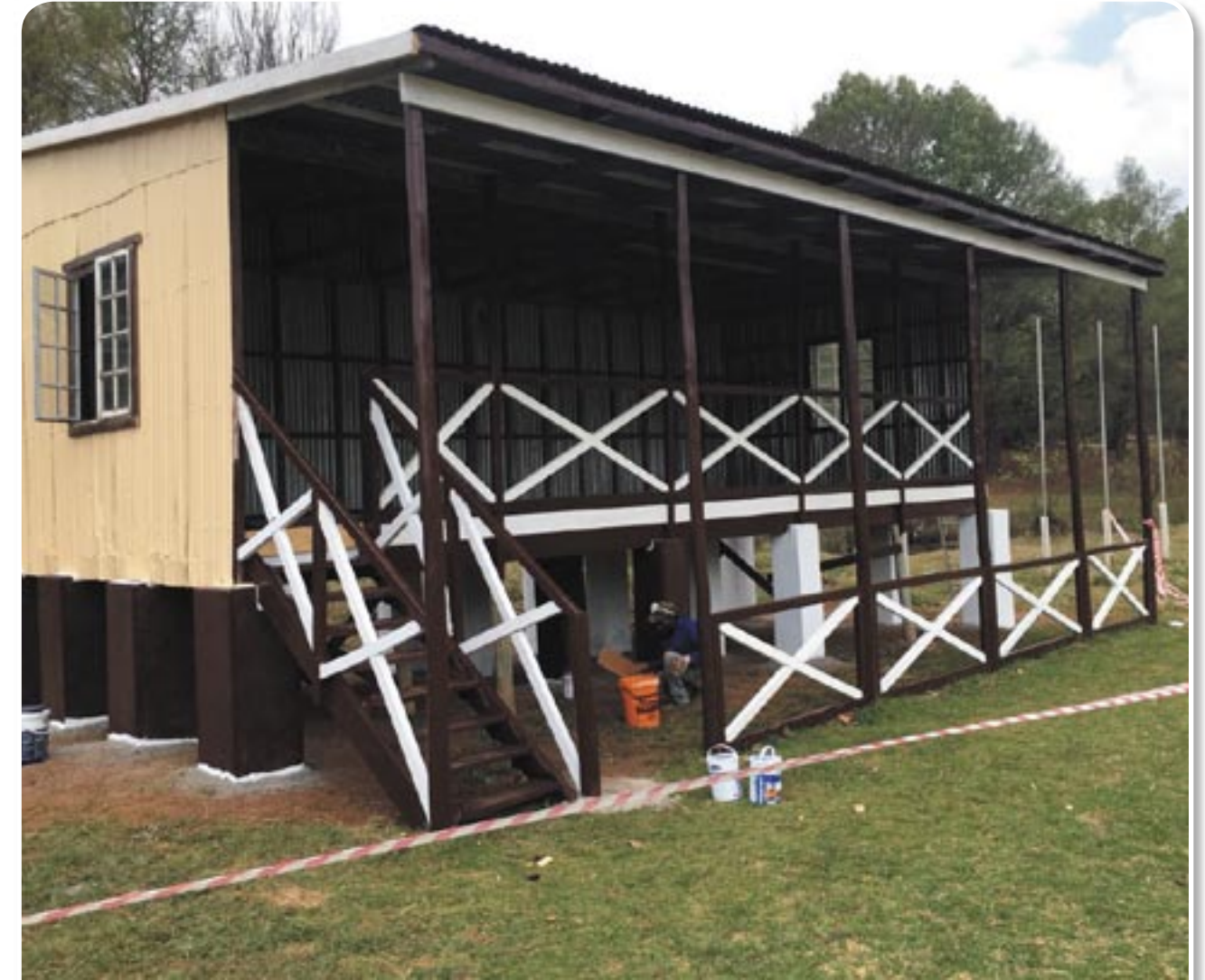
A NEW STAGE IS SET: Pilgrims' Rest restoration underway.

ilgrim's Rest is a small peri-urban village situated on the magnificent Panorama Route in the eastern escapement region of Mpumalanga. The village was declared a National Monument in 1986. The area is richly imbued with diversity of natural, cultural and historic gems. The uniqueness of this historic village is vividly