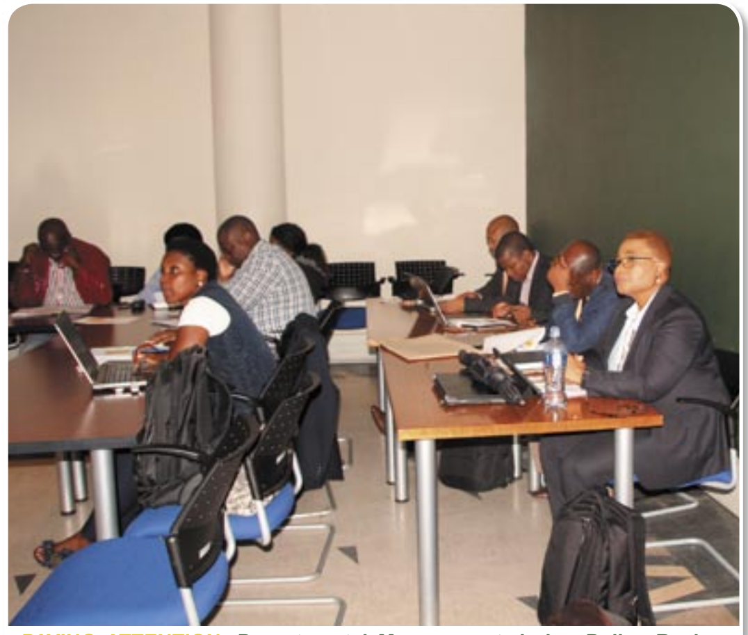
PAYING ATTENTION: Departmental Management during Policy Review Programme.