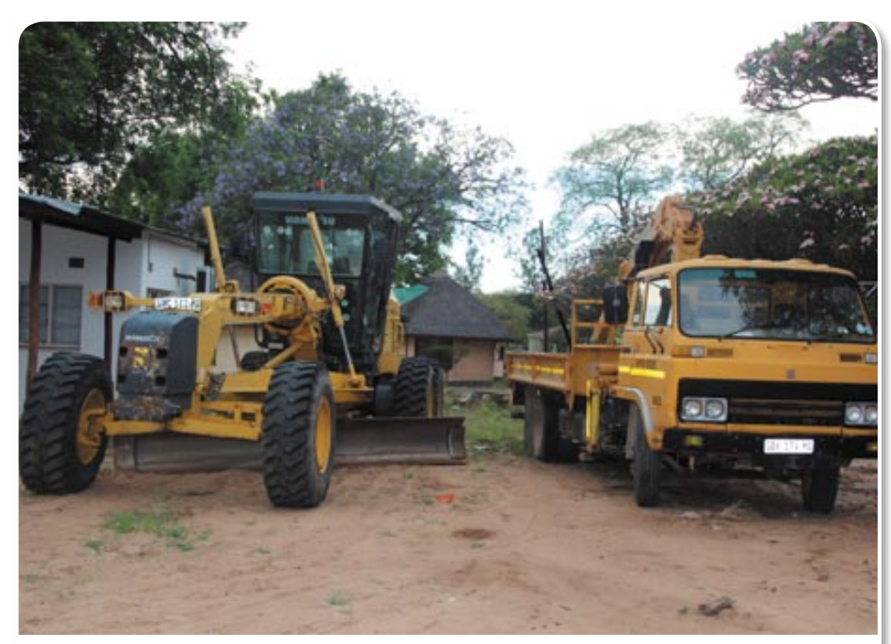
READY TO ROLL: Yellow fleet awaiting service delivery.

he Local Municipalities in Mpumalanga Province are reaping the rewards of the Municipal Support Programme, which assists them with maintenance of roads infrastructure. The programme was introduced in 2013 by the Department of Public Works, Roads and Transport seeing that communities in the rural areas are battling to reach public amenities such as grave yards, clinics and schools. The Department through the programme managed to re-gravel 1081.78 km of the roads and graded about 4936.23 km with 163421.98 square meter of roads patched in the province in the 2016/17 financial year at a cost of R55million.