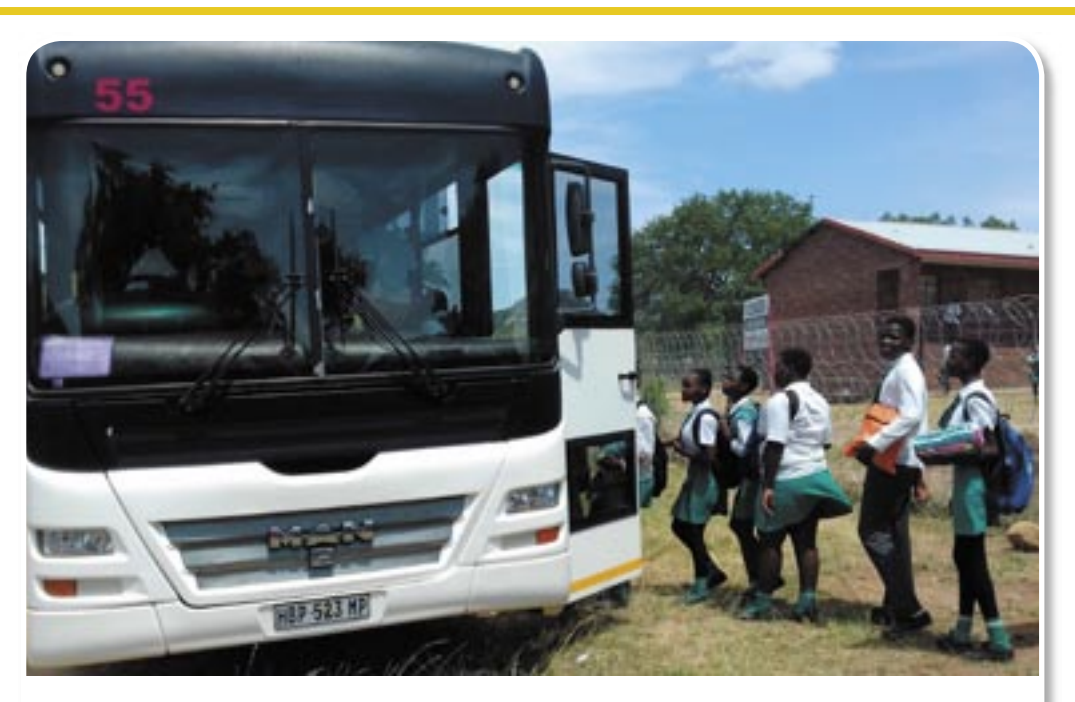
LAYING THE FOUNDATION: Sidunge High School learners boarding a scholar transport bus.

The Department is assuring parents of learners that are using scholar that the Department is committed to assist in the promotion of access to education, improving culture of learning and teaching through (5) kilometres from the nearest the provision of an effective and efficient scholar transport.