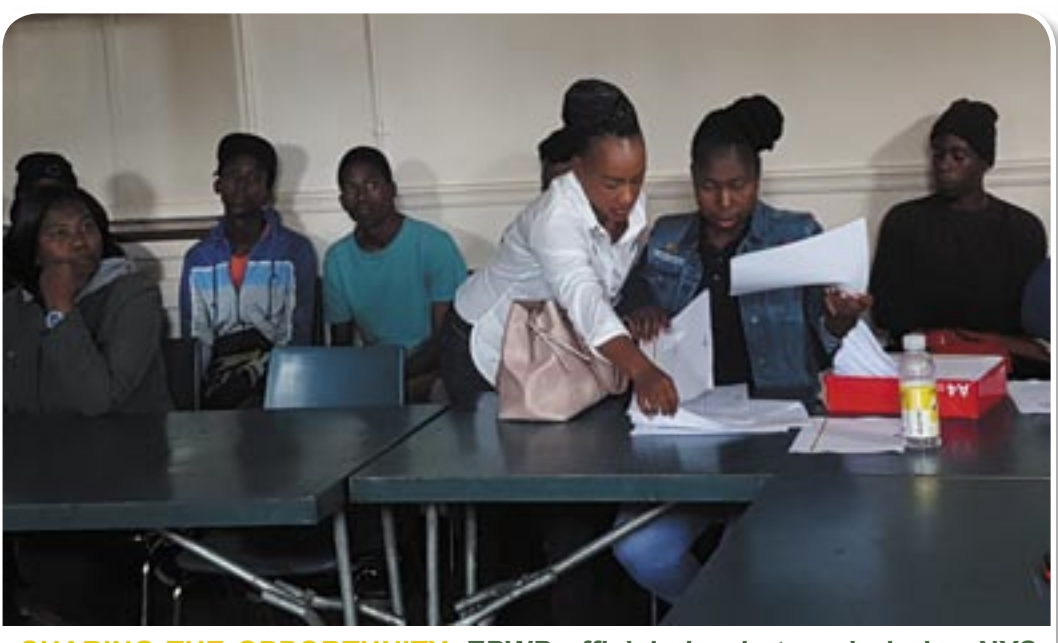
SHARING THE OPPORTUNITY: EPWP officials hard at work during NYS recruitment drive.