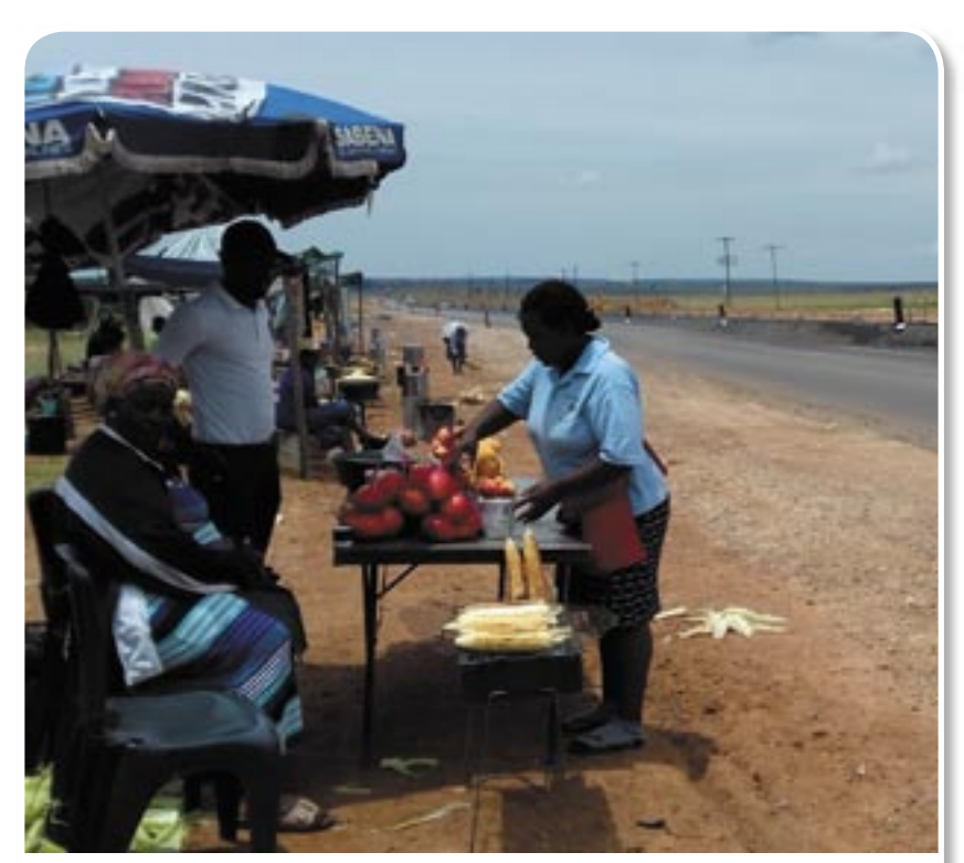
LAYING THE FOUNDATION: Road construction bringing about economic opportunities.

usiness is booming along the Moloto Development Corridor as business people are reaping the rewards of the construction project with workers on site queuing to enjoy a variety of African cuisine flavours sold on countless stalls erected adjacent to the construction site. Government's cooperation and commitment in working with local SMMEs and communities is bearing fruit as many are now able to put bread on the table thanks to the harmonious relationship between the Provincial Government and SANRAL.