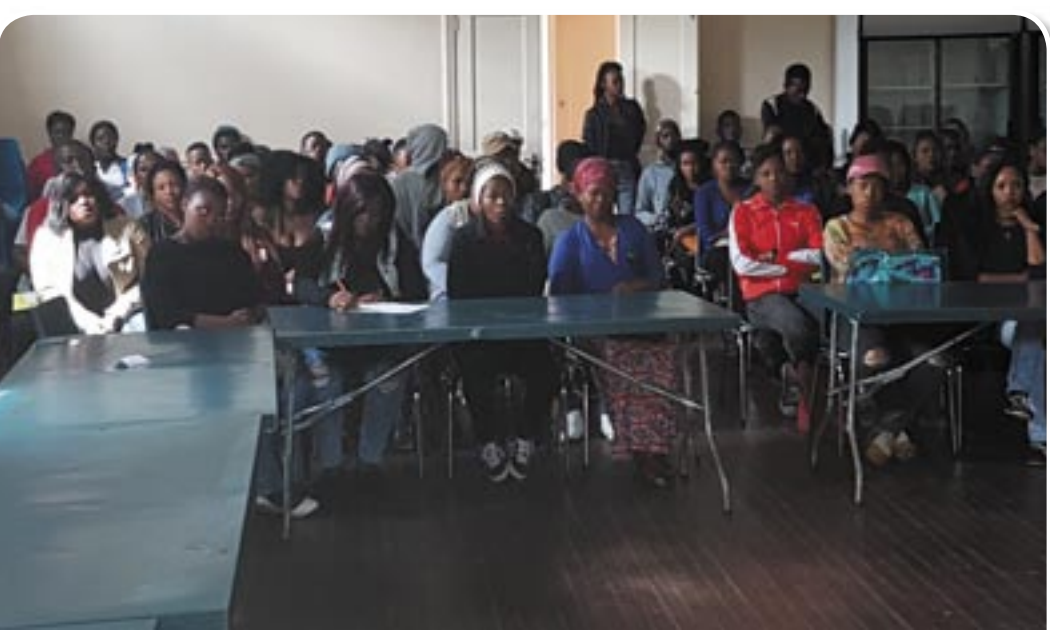
LISTENING ATTENTIVELY: NYS recruitment drive at Lekwa Local Municipality.

During the 12 months training period, participants are deployed to infrastructure projects within 50km radius of their areas of stay; receive R4000 stipend and would be grouped into cooporatives as part of their exit strategy. This opportunity also offers them a chance to accumulate required experience to do trade test.