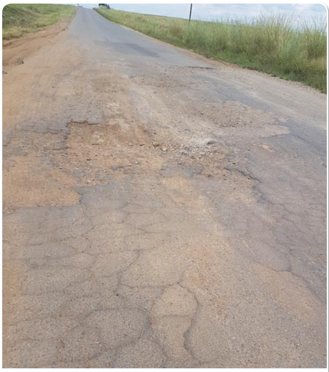
LAYING THE FOUNDATION: Badly damaged P36/2 road soon to undergo major facelift.

The project commenced in January 2018 and is expected to be completed by July 2019. Road construction is Government's investment in communities and is aimed to stimulate socioeconomic progress thereby breeding confidence communities local and businesses. The local Department is implementing Social Enterprise Development Model through infrastructure delivery announced which was by the Honourable MEC