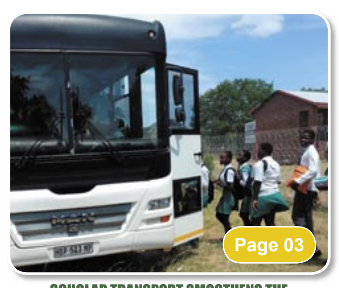
SCHOLAR TRANSPORT SMOOTHENS THE JOURNEY OF LEARNING