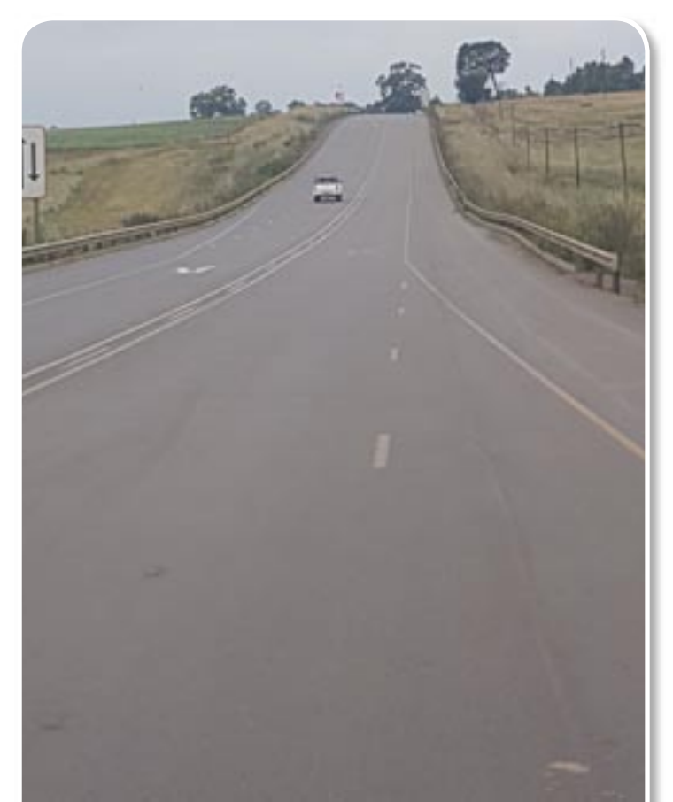
LAYING THE FOUNDATION: New state-of-theart road between Ermelo and Breyten.

or a long time, the road between Ermelo and Breyten was a nightmare for motorists. This is one of the busiest roads which links the southern part of Mpumalanga with the north. It is also used extensively by trucks transporting coal to nearby power stations from coal mines. Within its limited fiscal resources, The Department of Public Works, Roads and Transport began with major rehabilitation of the road which began in January 2015 and was completed in June 2017.