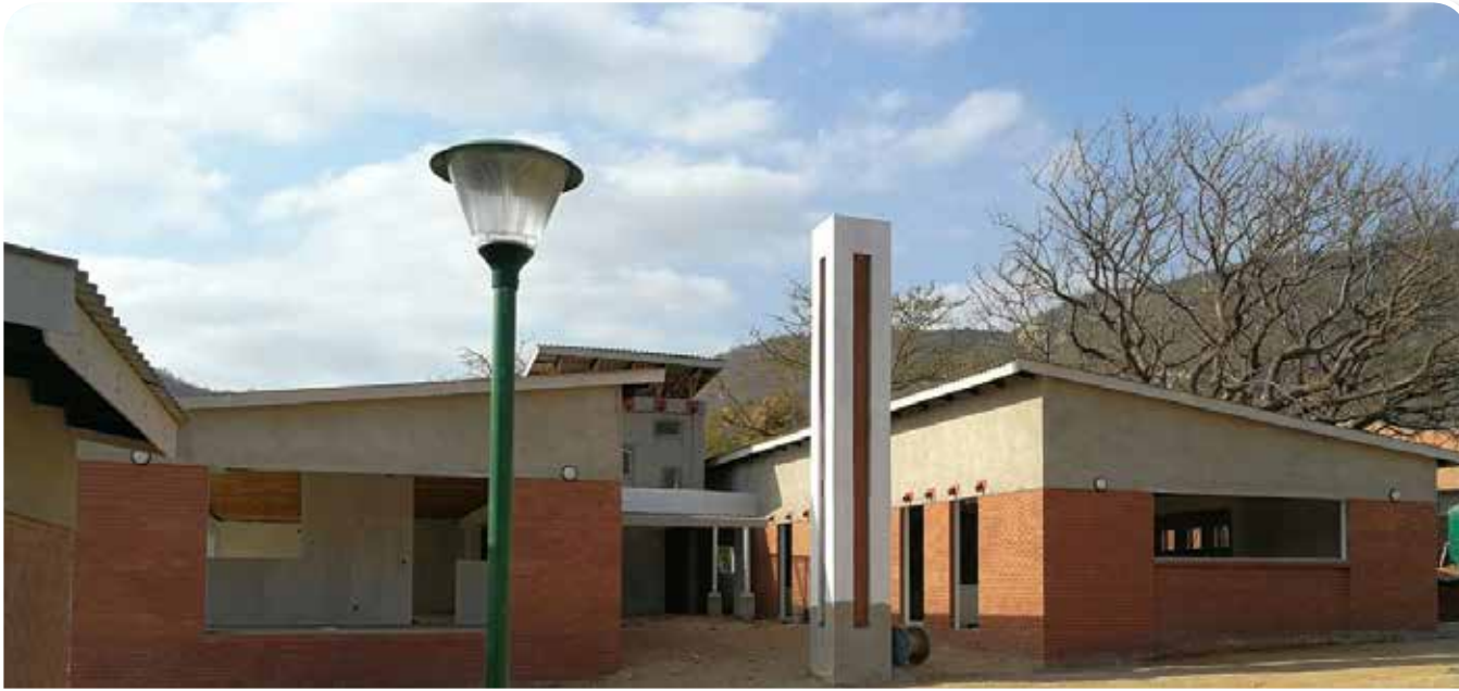
NEW SOURCE OF KNOWLEDGE: Kanyamazane library to its final stage.

The Department is reaching a milestone in providing state-of-the-art libraries across the Province in a bid to empower the citizens with information. This follows the construction of a new public library in Kanyamazane Township outside city of Mbombela. Approximately R13 million project started in May 2017 and it is set to be completed by September 2018. The work entails amongst others,