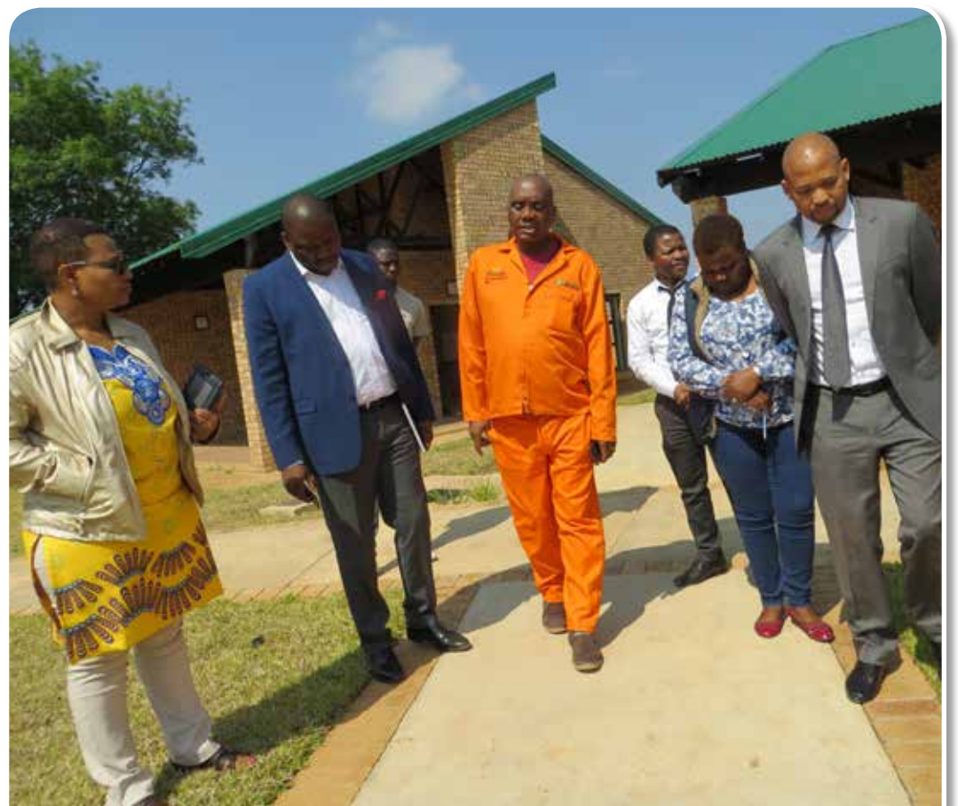
OPERATION SIYAHLOLA: MEC Gillion Mashego with Departmental senior officials inspecting progress at Swartfontein Treatment Centre.

Apart from the project visits to fast-track service delivery, the Honourable MEC also met with various institutions and civil formations to tackle issues of common interest with the view of improving the Department's socio-economic impact. In not so much words but in action, the MEC has sent a clear signal that the tide has turned. This is business unusual.