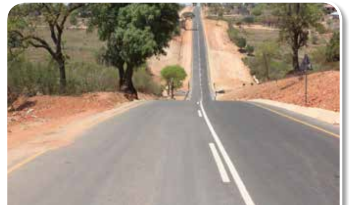
WORK IN PROGRESS: D3928 road, one of the projects visited during TLP.