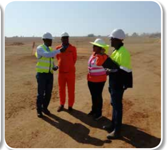
MUDDY PATH TO THE FUTURE: Labourers hard at work at Thaba Chweu Boarding School.