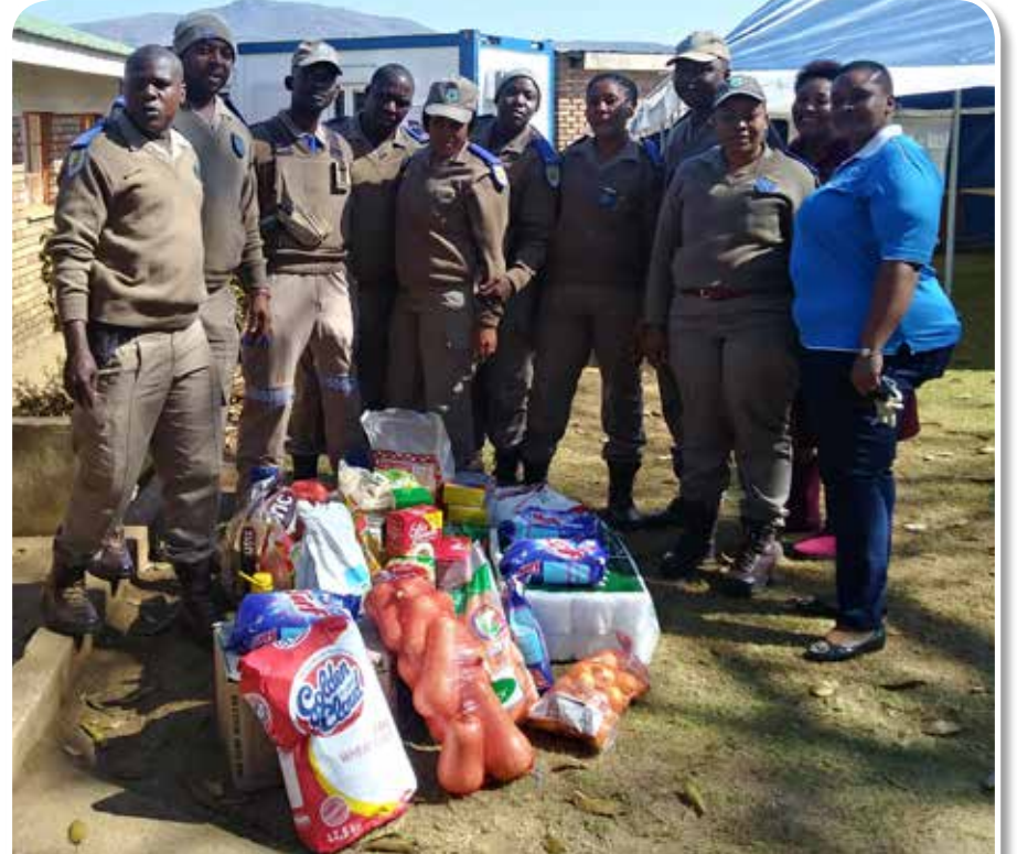
A HAND WITH A HEART: Bohlabela Transport Inspectorate ready to donate food parcels at Emmanuel's Family Home.

Bohlabela could not miss the opportunity to make a difference. The Inspectors marched to Emmanuel's Family Home in Graskop to donate food parcels inspired by the MEC's call to do more. The centre is a non-profit organization established in 2007 to care for vulnerable