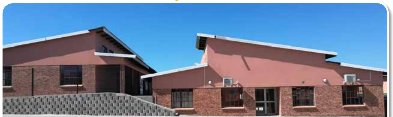
THE BRIGHT FUTURE: Newly constructed Mtfopheni Primary School almost ready to open the doors of education.

The 12 month internship programme commenced in May 2018 and will end in April 2019. The core purpose for the internship is to provide graduates with work experience and skills while receiving the much needed financial remuneration.