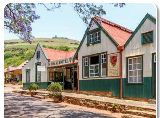
THE GEM OF LOWVELD: Pilgrims' Rest iconic buildings ready for business.

to address challenges facing the historic town,” she said.