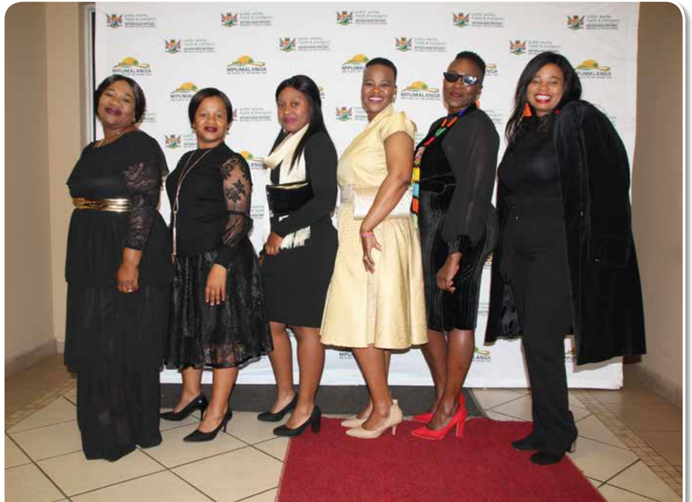
LADIES OF THE MOMENT: Some of the Departmental queens who graced the occasion to celebrate women’s struggle for liberation.

Dressed in black and gold which resonated with the theme of the gala evening, the ladies redefined the fashion industry as they commemorated the landmark march of the 9th of August 1956 where heroines such as Helen Joseph, Lillian Ngoyi, Rahima Moosa and Charlotte Maxeke amongst others, led a protest action against the pass laws