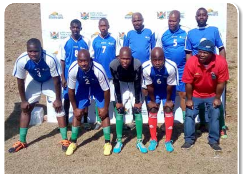
READY TO TACKLE: Nkangala District soccer team getting ready for perspiration.