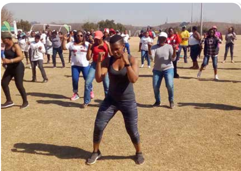
FITNESS CLUB: Departmental officials doing aerobics during the Wellness Day at Middelburg