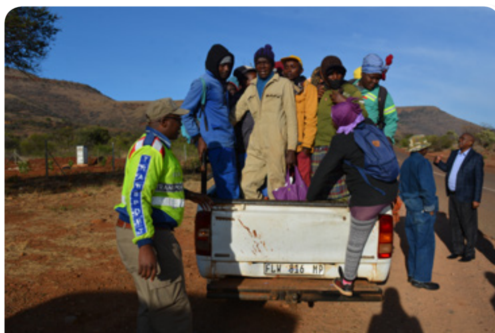
SHOCKING INCIDENT: Overloaded bakkie ferrying workers to work.