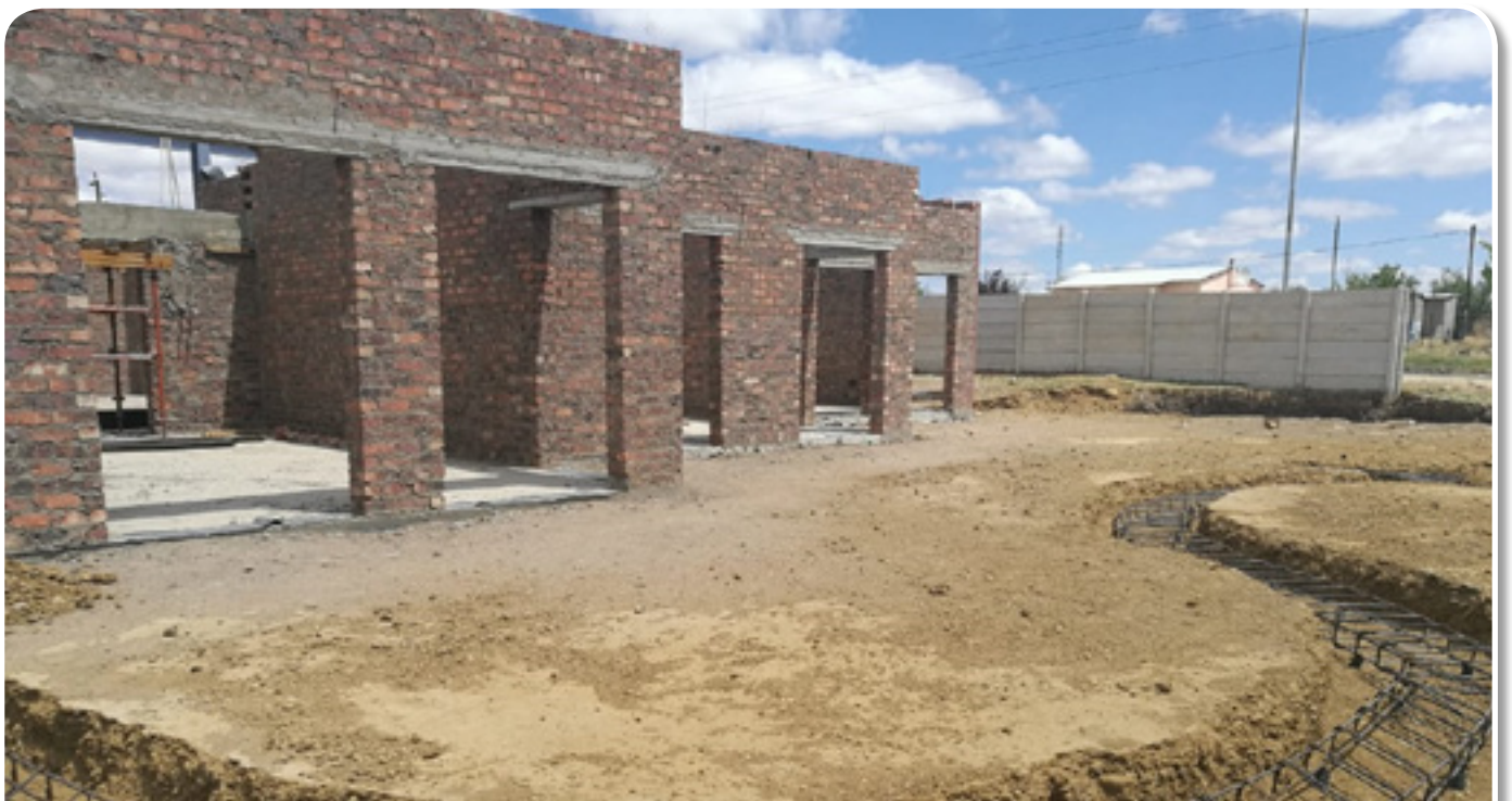
BRICK AND MOTAR: Construction of an Early Childhood Development Centre at Lekwa Local Municipality.

More than R5 million was invested into the project which commenced in June 2018 and is set to be completed in February 2019. During the construction, at least 12 work opportunities were created for the local community where youth and women benefited.