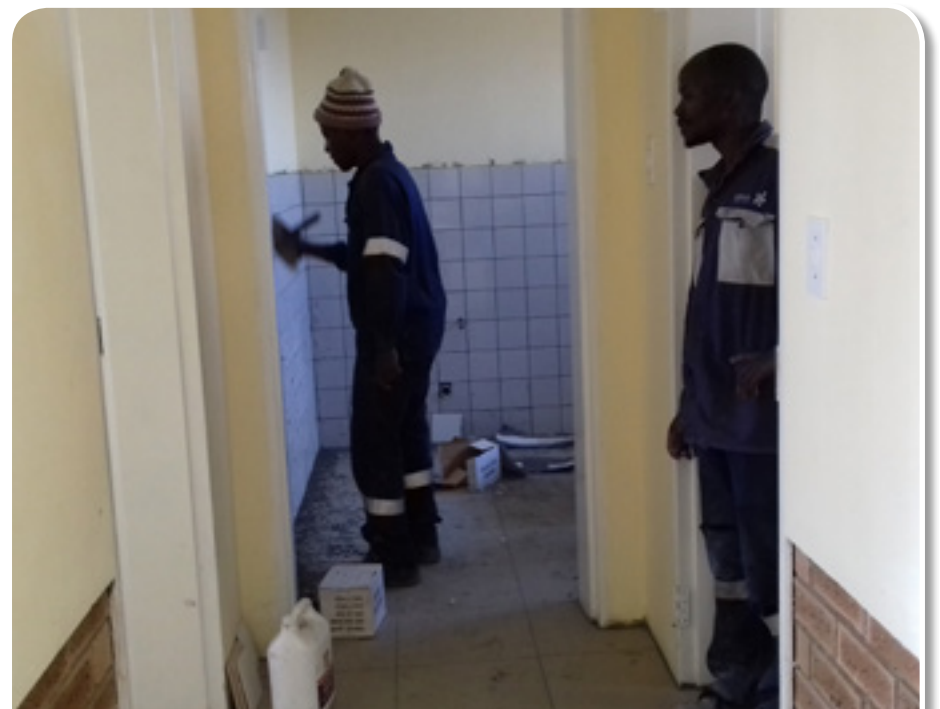
FINAL TOUCHES: Workers making final touches in Basizeni Special School.

The Department of Public Works, Roads and Transport is an implementing agent ensuring that government buildings are built effectively and efficiently on behalf of the client Department of Education.