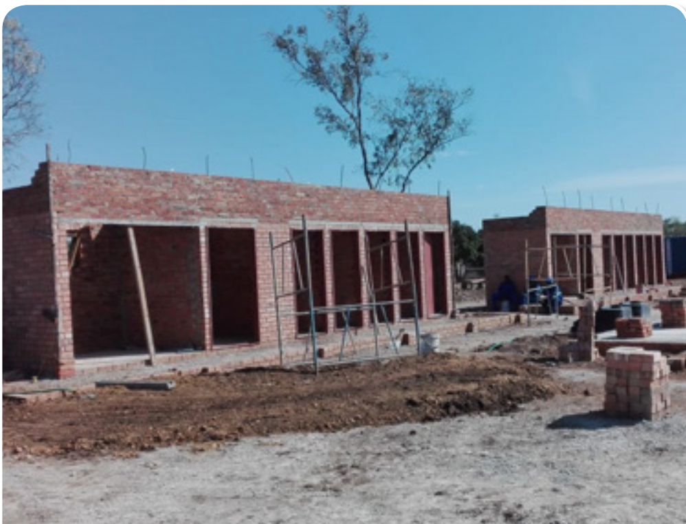
RESTORING DIGNITY: New enviroloo ablution facility under construction.

The Mpumalanga Provincial Government continues to live up to its service delivery mandate which include amongst others; providing basic right of health and hygiene services to the community. In recognition of the poor state of the ablution facilities at Mphoti Primary School in Mangweni, Nkomazi Local Municipality; the Department undertook an initiative of refurbishing and constructing new enviro-loo ablution facilities. The completion of the facilities will restore the dignity of learners previously subjected to substandard ablution facilities for years.