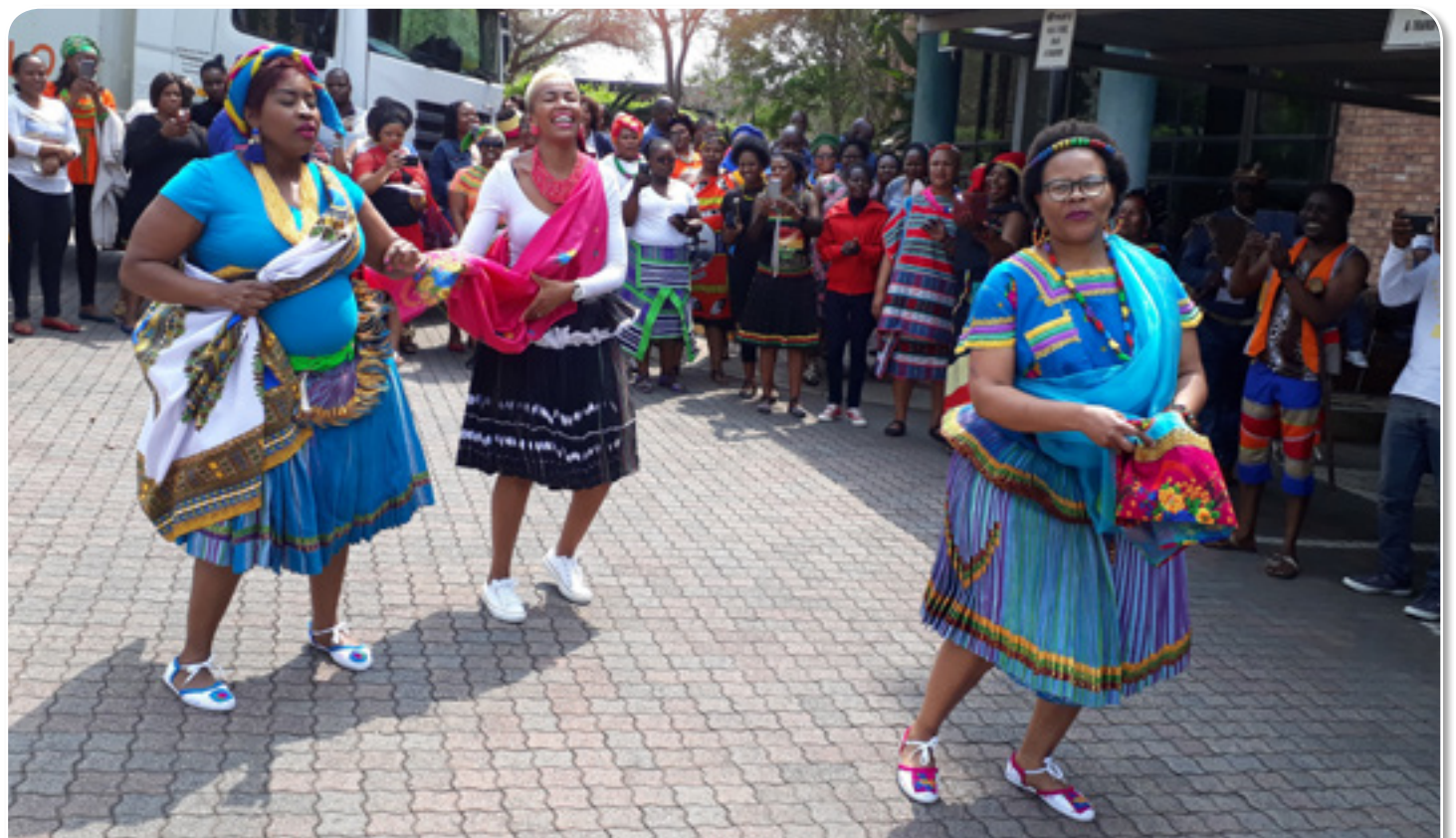
OUR HERITAGE: Head office officials showing off their moves during Heritage Day celebration.