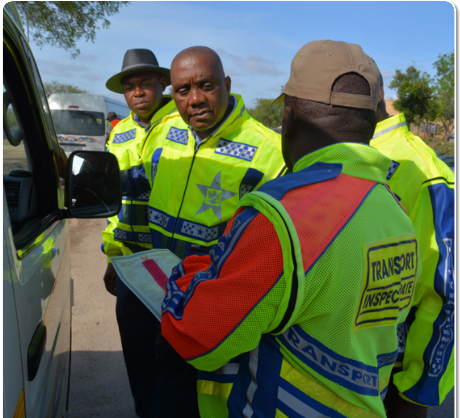
ENFORCING THE LAW: MEC Gillion Mashego inspecting public transport during law enforcement operation

As the festivities approach with a beehive of activities anticipated in celebration of the holiday season, so is traffic congestion on the road as holiday makers rush to various holiday destinations to enjoy a well deserved break. However, in all that commotion, road safety particularly in public transport is always the last thing in