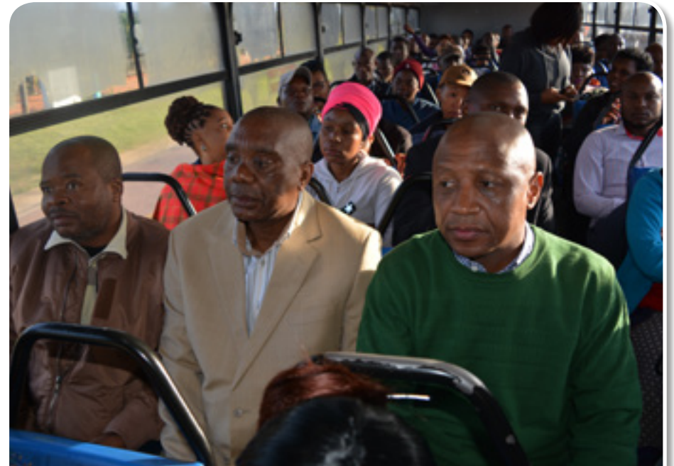
DAY TO DAY EXPERIENCE: MEC Gillion Mashego together with some of the Departmental Senior Management boarding public transport with commuters.

"Poor transport system would mean that over 400 000 economically active commuters we are subsidizing in the Province would not pursue their economic activities, and that is only one aspect of the impact of transport," said MEC Mashego.