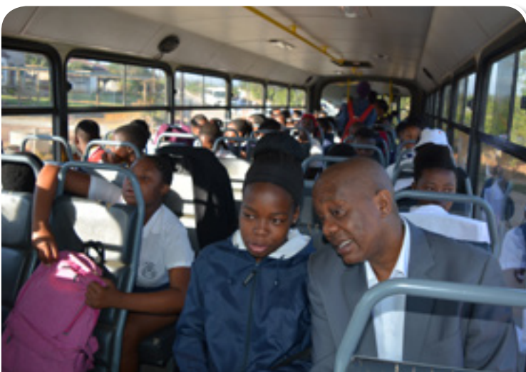
EARLY BIRDS: MEC Gillon Mashego interacting with learners on the way to school during scholar transport monitoring.

In many areas across Mpumalanga, scholar transport and access to education are synonymous terms that can never be separated. In an effort to prepare for the next academic year, MEC Gillon Mashego is on the ground inspecting scholar transport vehicles to get rid of “moving coffins.”