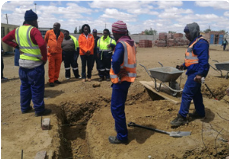
ON-SITE INSPECTION: MEC Gillion Mashego and officials of the Department during project visit.

Still under Lekwa Local Municipality there is a newly construction of an Early Childhood Development Centre which received special