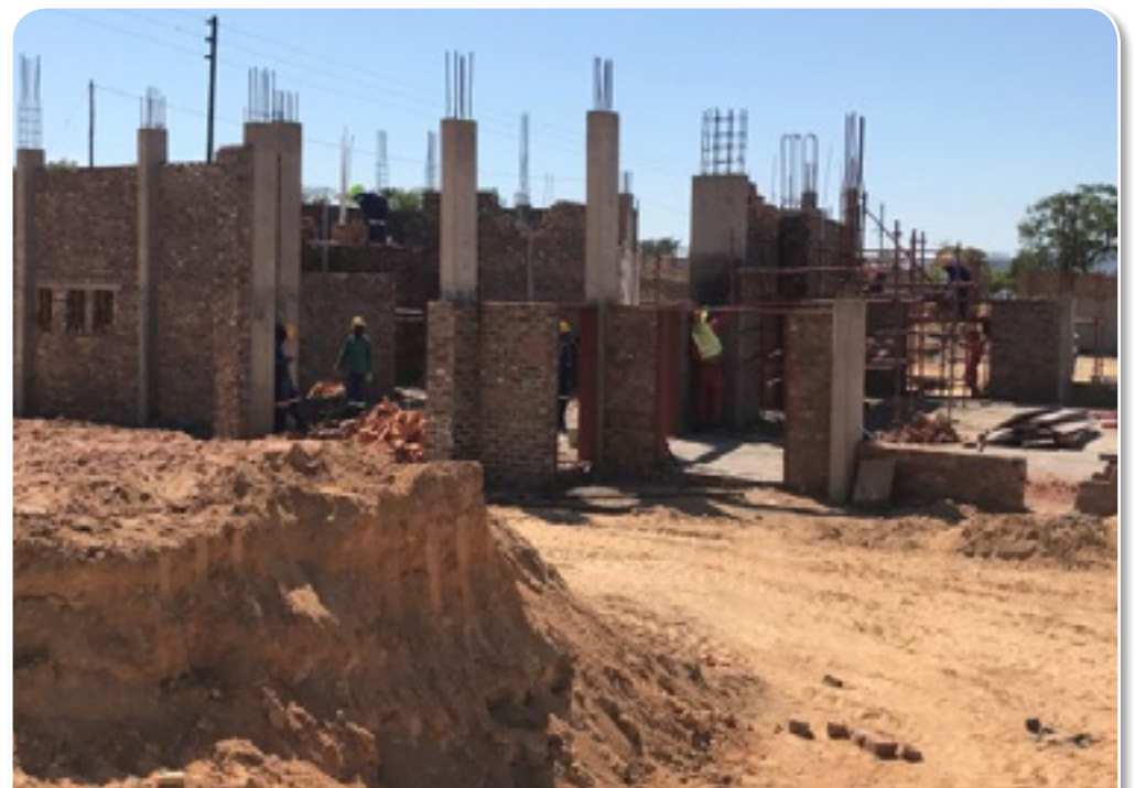
BETTER SERVICE DELIVERY: Construction of Daantjie Development Centre in progress.