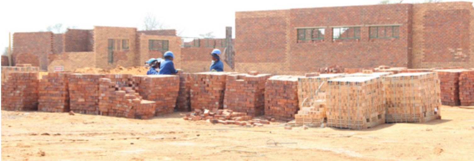
INVESTING IN HEALTHCARE: New construction of Pankop Clinic at Dr JS Moroka Local Municipality.

With government's commitment to the provision of world class health care infrastructure through cutting edge technologies, the Pankop Clinic will be a reflection of the Mpumalanga Provincial Government's investment in efficient, competitive and responsive economic infrastructure.