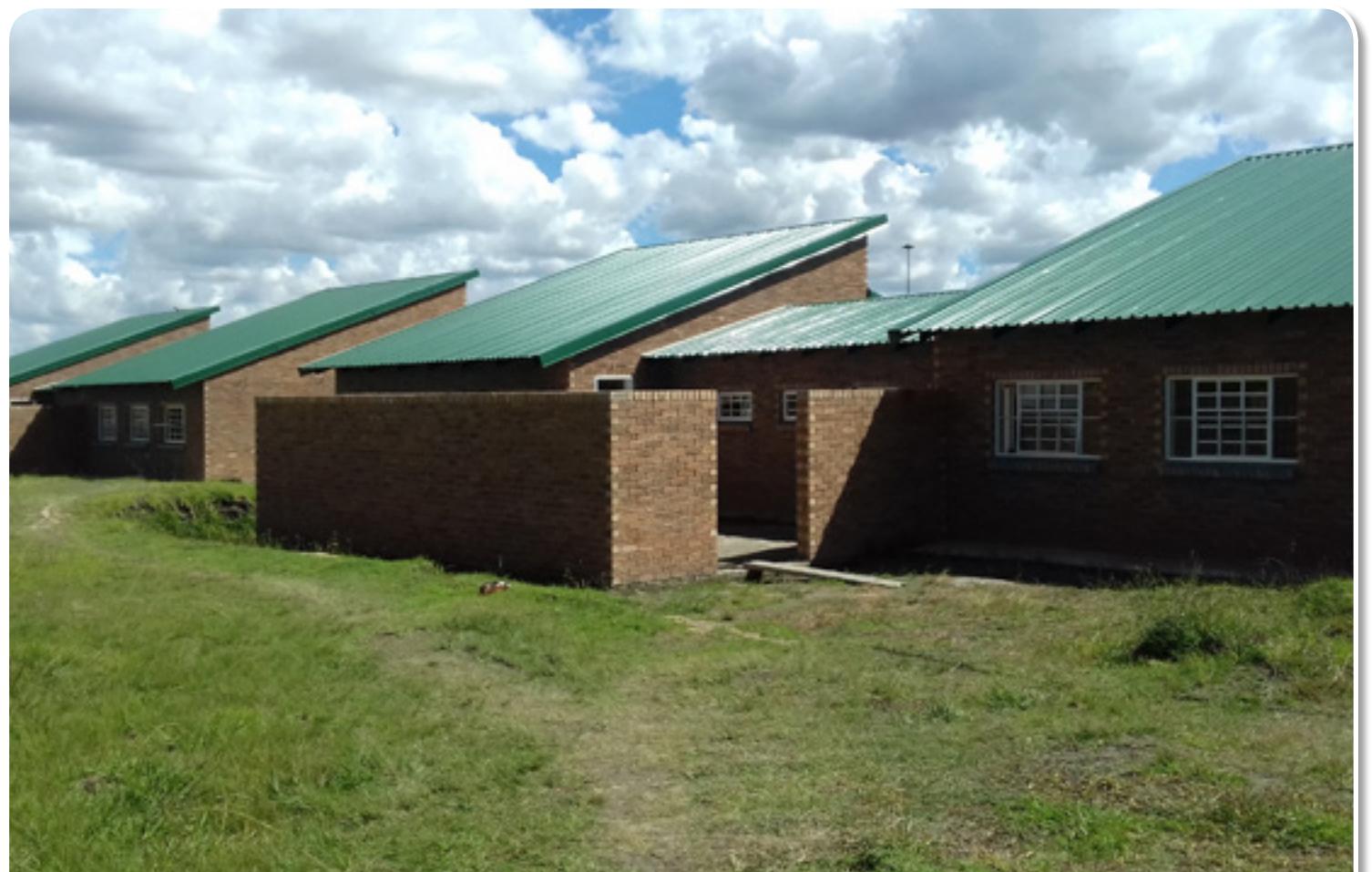
INCLUSIVE EDUCATION: Newly constructed classrooms for Basizeni learners.