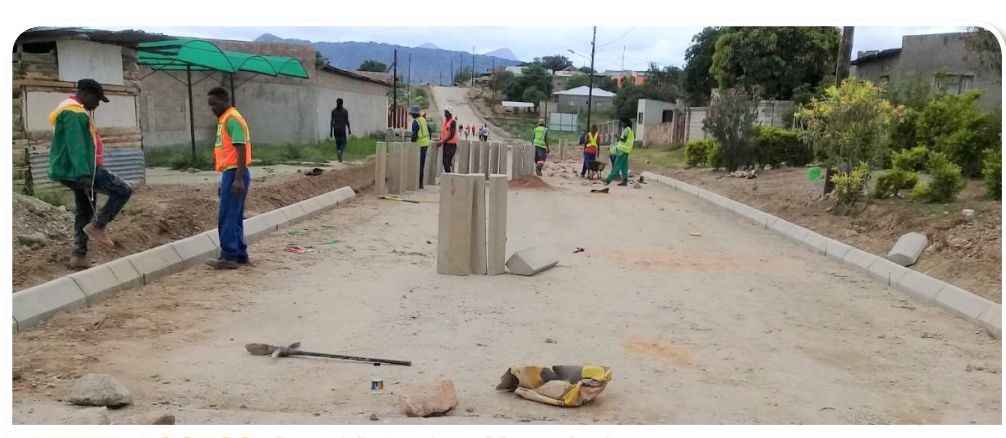
BETTR ACCESS: Road D2978 at Matsulu in progress.

construction of the new road. The D2978 road connects Matsulu A and Matsulu B at Ehlanzeni district in the City of Mbombela. This is one of the projects that showcases progress made in the delivery of transport infrastructure in the province. The Department invested at least R24 million towards the construction of this road.