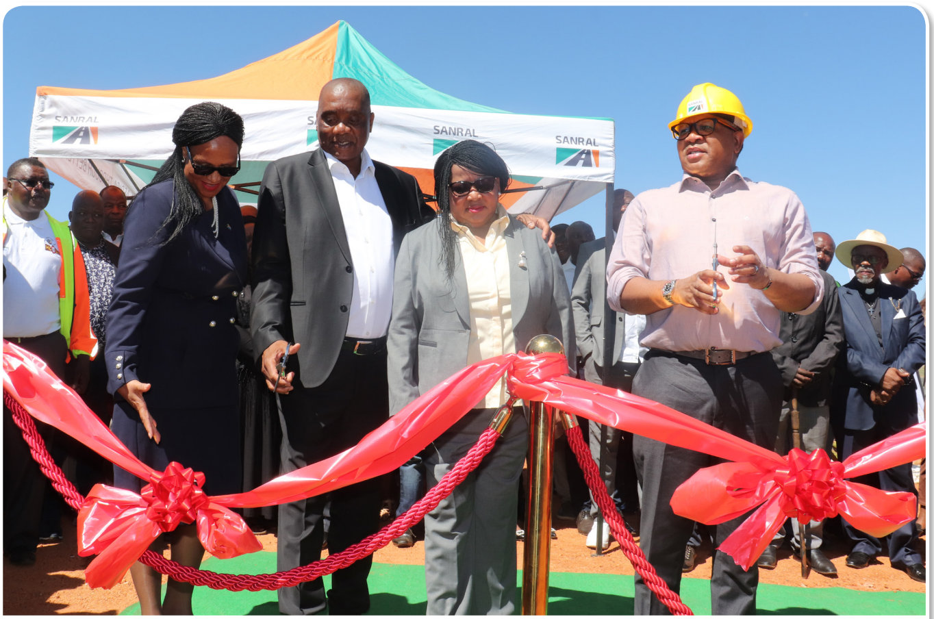
ONE: Minister Fikile Mbalula (pink shirt), MEC Gillion Mashego (black jacket) and other dignitaries dring the handover of Route R573 Moloto.

The fragmentation of Moloto road portions, belonging under the three provinces has on several occasions resulted in administrative discrepancies