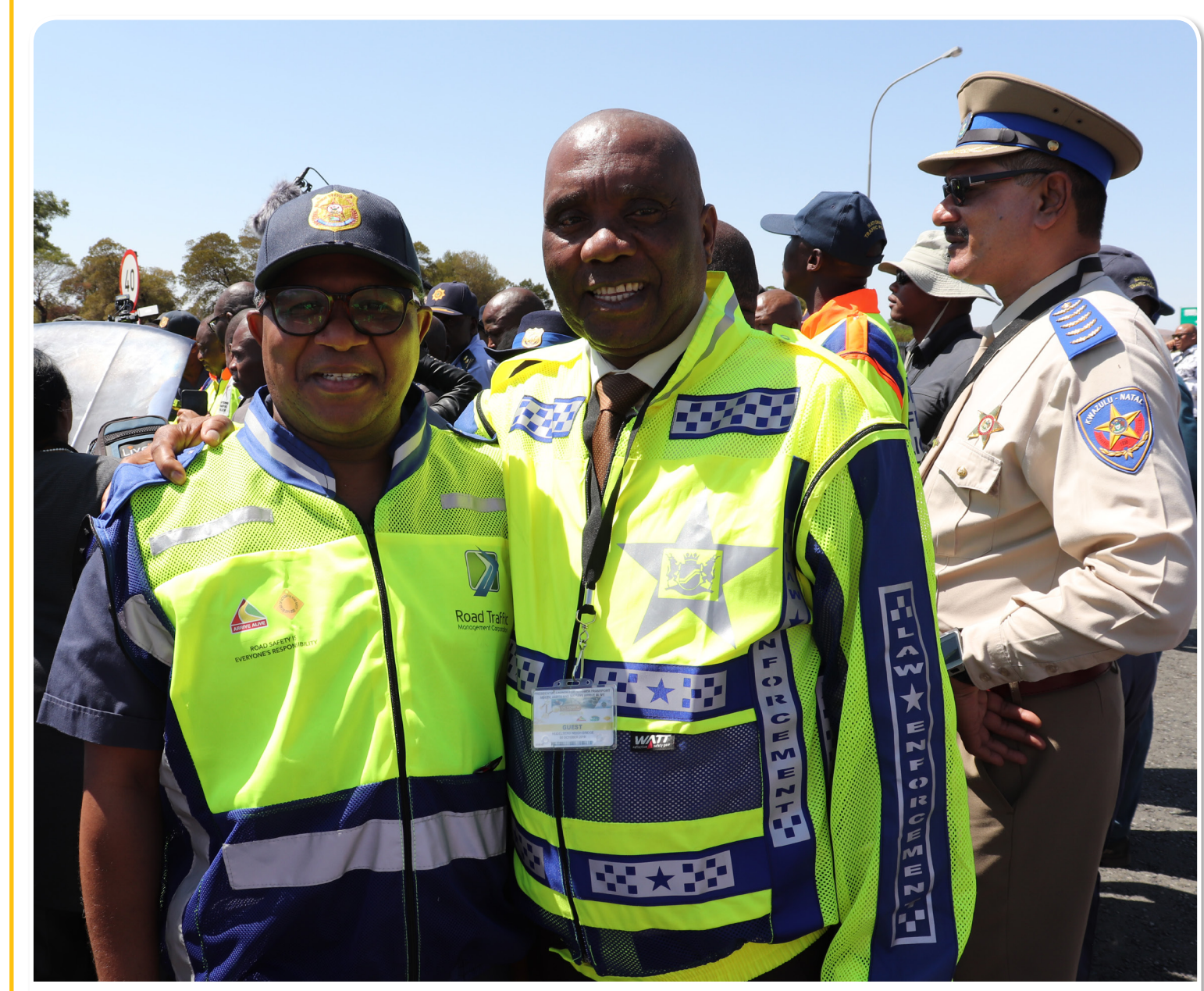
JOINT OPERATION: Minister Fikile Mbalula together with MEC Gillion Mashego during the launch of 2019 October Transport Month.