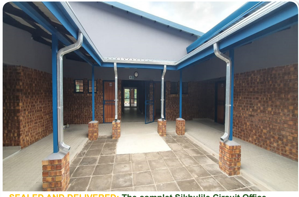
SEALED AND DELIVERED: The complet Sikhulile Circuit Office.

As an implementing agent, the Department has now completed the construction of Sikhulile Circuit Office at Msogwaba in Ehlanzeni District. The Department has done an exceptional job in delivering the state-of-the-art structure. This