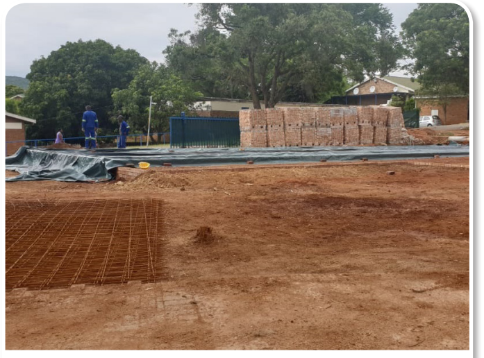
BRICK AND MOTAR: Construction Klipspringer Primay School take shape.

The scope of work includes the demolition of existing structures, alterations, construction of 6 classrooms, 2 grade R centres and 10 toilets. The project commenced in July 2019 and is projected to be completed in September 2020. The implementation of the project will be done at a cost of approximately R9 million. The project has already contributed significantly towards the local economy. In the process, the project created more than 40 jobs opportunities for local people and SMMEs through sub-contracting.