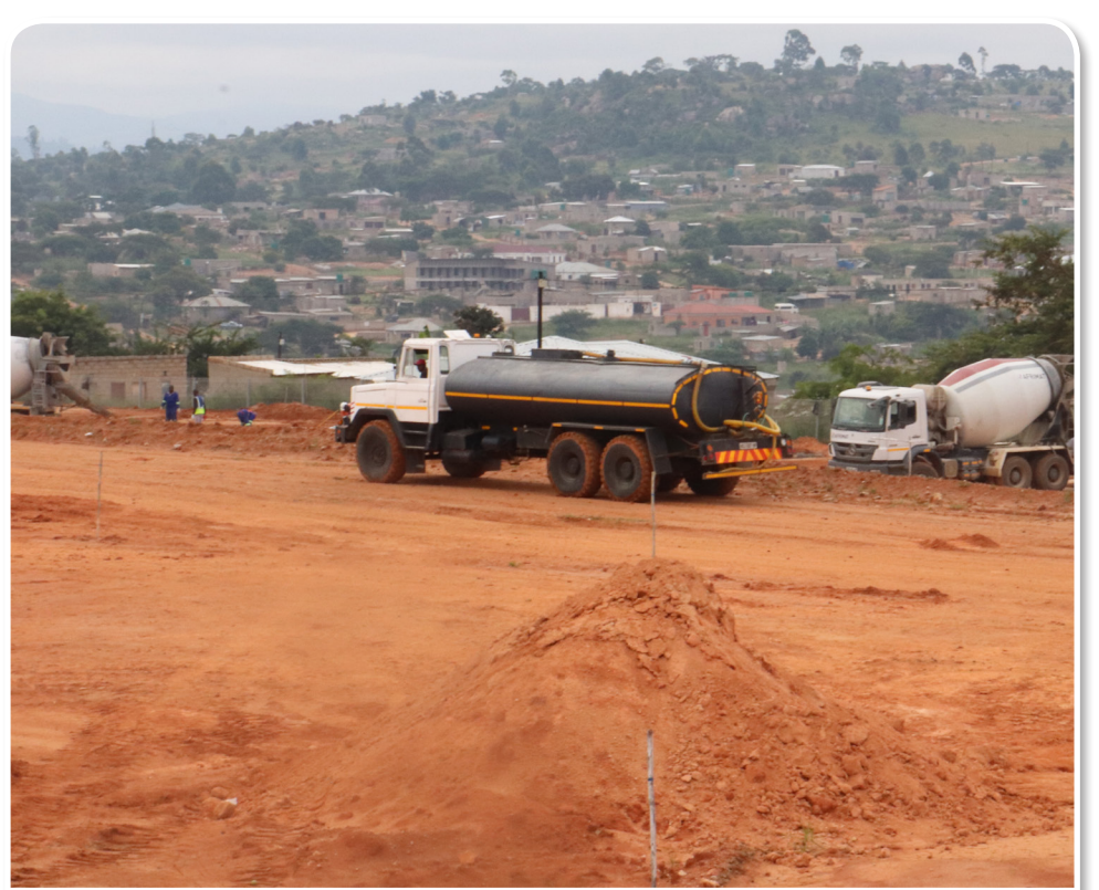
LAYING THE FOUNDATION: Construction of the new school in Msholozi in progress.

The construction of Boschrand primary school was scheduled to begin in August 2019 but got delayed due to stakeholders' engagements. The new school will be constructed at a cost of R51.7 Million and like many such projects, it is expected to create much needed job opportunities for the local people, provide training and help stimulate economic activity through subcontracting to local business people. The projected is scheduled to