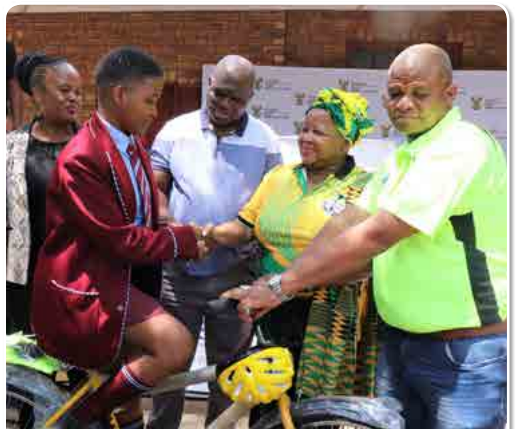
RIDING ALONG: Deputy Minister of Transport, Ms Dikeledi Magadzi together with Education MEC, Mr Bonakele Majuba and Victor Khanye Local Municipality Executive Mayor, Cllr KV Buda handing over bicycles to Swartklip Combined School learners.

Addressing the event, the Deputy Minister emphasized the importance of education as only dependable means to escape poverty. "This program of giving bicycles to deserving learners goes at the heart of a slogan that we are a caring government. We want to ensure that you ride the bike with an interest of gaining knowledge to prepare each of you for a better future, where you shall be equals to your counterparts anywhere in the country or in the world" , she stressed. She hinted that non-motorized transport system, was not only a mode of transport,