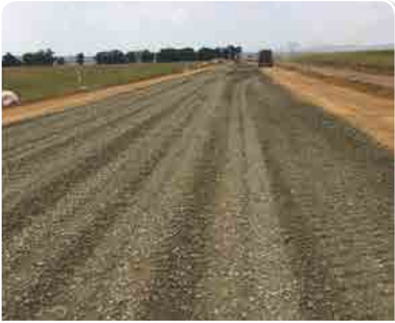
IN PROGRESS: Road D281 between Volksrust and Daggakraal taking shape.

There is light at the end of the tunnel, so goes the saying. The people of Daggakraal in Pixley Ka Isaka Seme Local Municipality are now singing this popular phrase as the endless struggle for a tarred road is paying dividends with the upgrading of road D281 between Volksrust and Daggakraal nearing completion.