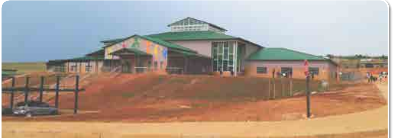
THE LILY OF MISTY MOUNTAINS: Thaba Chweu Boarding School has enrolled over 1000 learners from seven farm schools.

The most important aspect of any infrastructure project is potential to create as many jobs as possible. To date, the project created over 387 job opportunities for local people and poignantly youth constitute majority at 334 and over R22.9 million was spent on local small business fraternity.