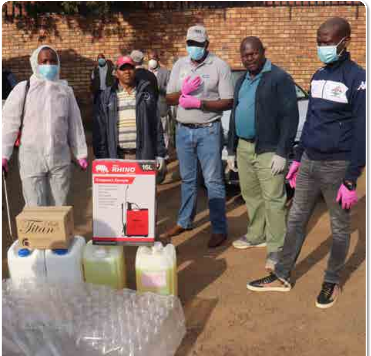
GETTING READY: Executive Mayor Muzi Chirwa (Gert Sibande District Municipality) allocating hygiene packs donated by MEC Gillion Mashego to various taxi associations in Gert Sibande District..

In line with the Department of Employment and Labour COVID-19 regulations, "The Handyman of the State" has established a steering committee to drive the COVID-19 programme in order to ensure a safe and healthy environment for both employees and clients visiting departmental offices. In line with the regulations, necessary precautionary measures are being implemented which include mandatory face masks, sanitising stations, temperature monitoring and registration of all individuals accessing Government buildings for tracing purposes. Furthermore, the Department has embarked on fumigation programme of all Government offices and vehicles.