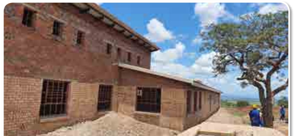
THE FORMULA OF SUCCESS: Lubombo Circuit is another success story amongst many with the aim of improving the quality of education in Mpumalanga Province.

The Department is persistent in its mandate of providing building infrastructure, as a custodian of the Provincial Government. The Lubombo community will soon join a long list of jubilant communities that will enjoy the privilege of receiving a new circuit office. This infrastructure was built with the aim of adding immense value to the community and improving academic knowledge around the area.