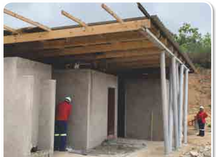
ROOF TOP: Construction of the R44 million Msogwaba Youth Centre is nearing completion.