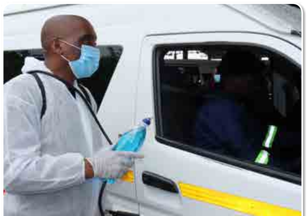
HYGIENE BEFORE HIGHWAY: MEC Gillion Mashego distributing sanitisers to taxi drivers in a bid to ensure that public transport is not a breeding ground for infections.

As the custodian of public transport in Mpumalanga Province, MEC Mashego emphasized that the intervention will go a long way in curbing the spread of infections.