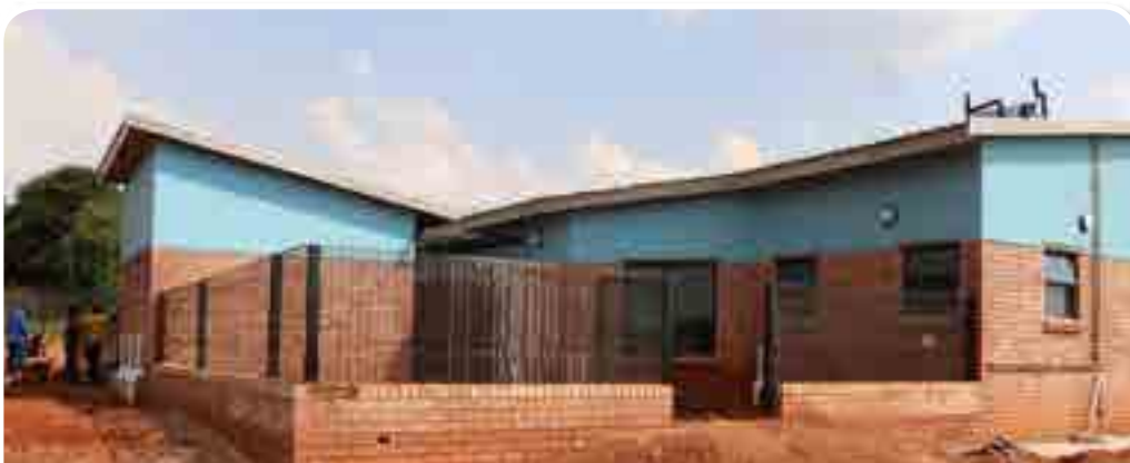
BREAD AND SALT FOR ALL: Aerorant Primary School construction project has placed local subcontractors at the pedestal of local economy.

The project consists of 24 classrooms, administrative block, library, computer center, 36 toilets, fence, electrical connection, water connection, kitchen, sports grounds, guardhouses, refuse rooms, staff parking and drop zone. As with all infrastructure projects, the most important aspect is job creation. In this regard, at least (146) Work opportunities were created during the construction process.