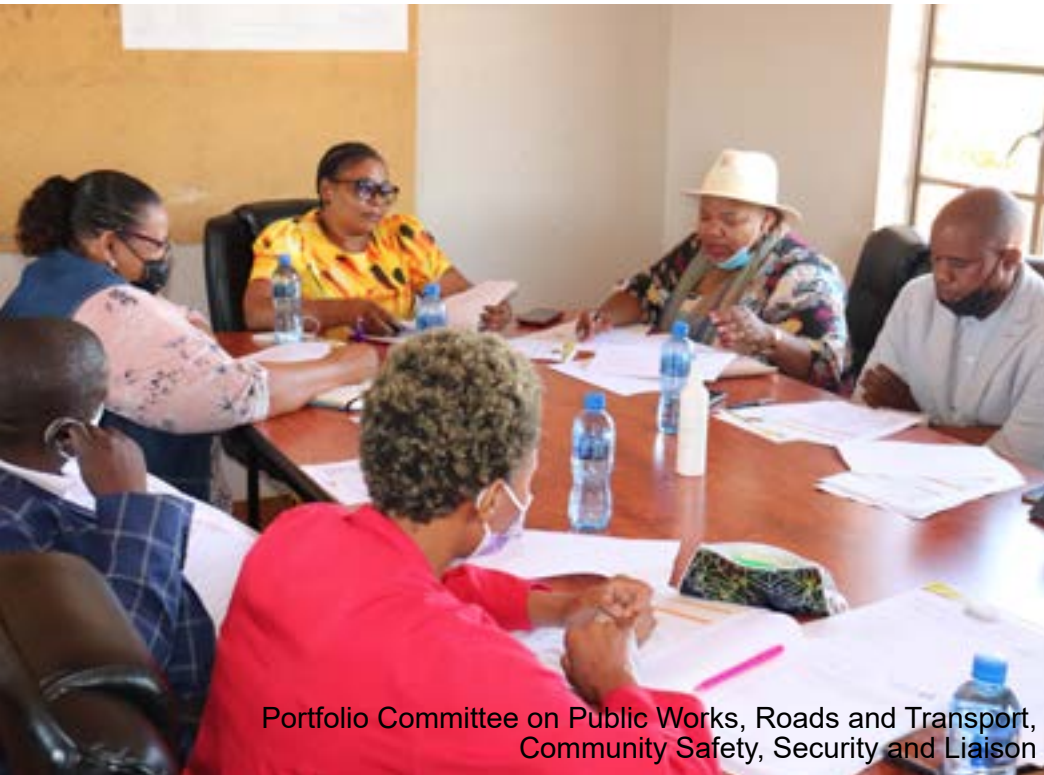
Portfolio Committee on Public Works, Roads and Transport, Community Safety, Security and Liaison