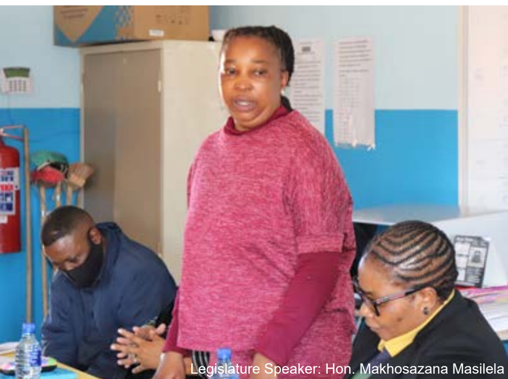
Legislature Speaker: Hon. Makhosazana Masilela