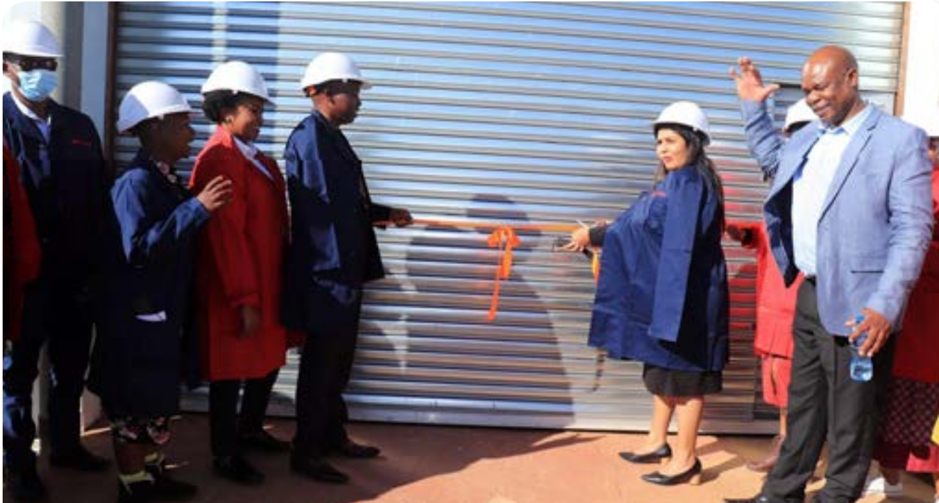
CUTTING THE RED TAPE: MEC Latchminarain cuts the ribbon to mark the official opening of KwaMhlanga Training Academy meant to equip young artisans with a variety of technical skills mostly required within the built environment.

The Department of Public Works, Roads and Transport cemented a public-private partnership with Strait Agri Solution as they opened a one stop training academy to tackle the high youth unemployment. The ceremony took place in KwaMhlanga (Thembisile Hani Local Municipality) on the 13th of June 2022.