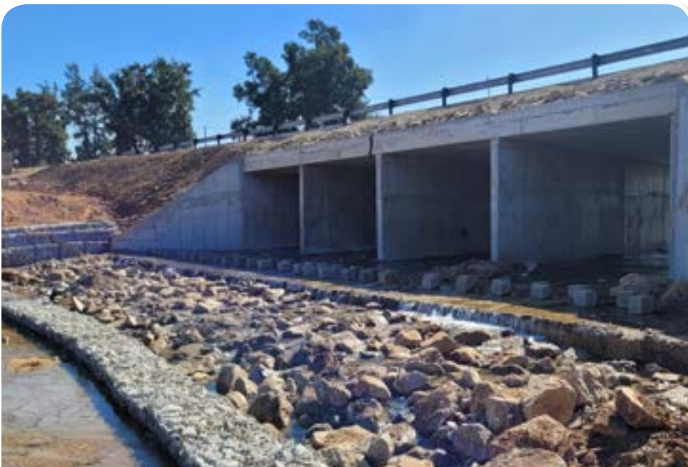
IMPENDULO: The newly constructed KaNyamazane-Tekwane bridge is Government's response to the community outcry after Tropical Storm Eloise completely damaged the previous one.

Traffic congestion due to the flood damaged bridge on D2296 road between KaNyamazane and Tekwane South outside the City of Mbombela is water under the bridge. Finally, the Department has completed the construction of the R22 million bridge which connects KaNyamazane, Tekwane South, Entokozweni and Kirino. This is after Tropical Storm Eloise ravaged Mpumalanga about two years ago and left a trail of destruction in the midst of COVID-19.