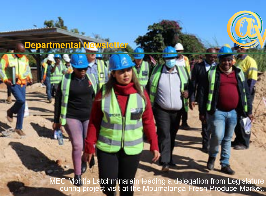
MEC Mohita Latchminarain leading a delegation from Legislature during project visit at the Mpumalanga Fresh Produce Market.