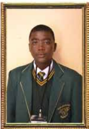
Mhlongo Banele Mahushe Secondary School 7 Distinctions