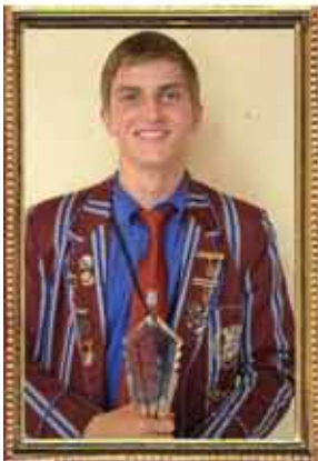
Kemp Dian Hoërskool General Hertzog 7 Distinctions