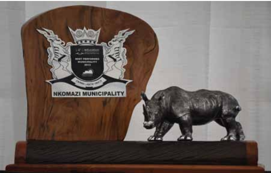
Special Trophy for the best Municipality