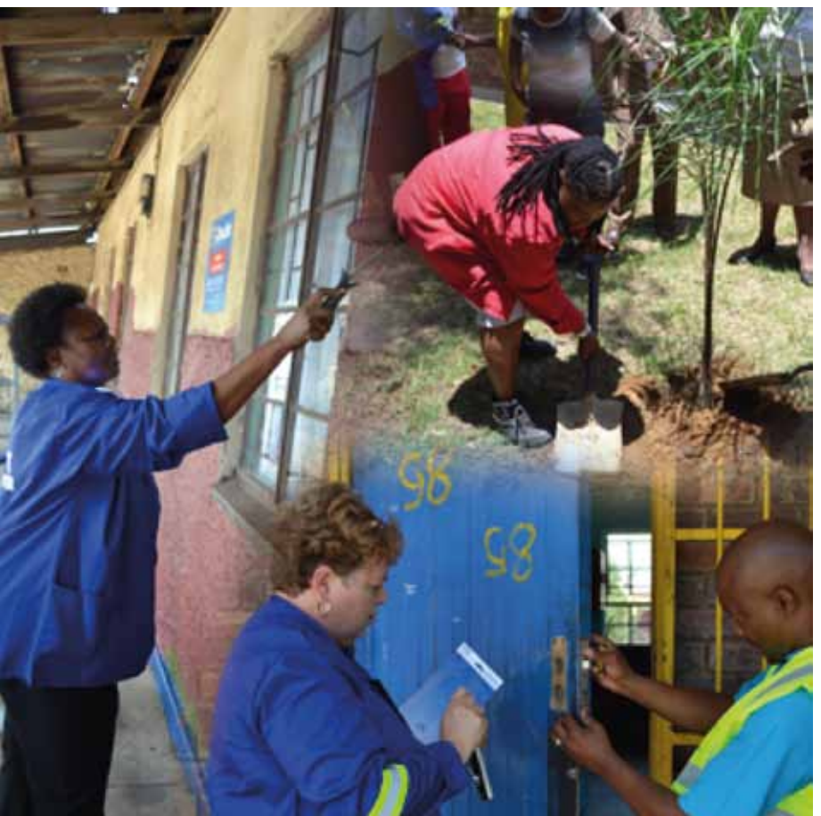
Hard at Work, MEC Mhaule and Team

The Department also encourages school communities to make their contributions be it in a form of building material, of monetary value or human skills ■