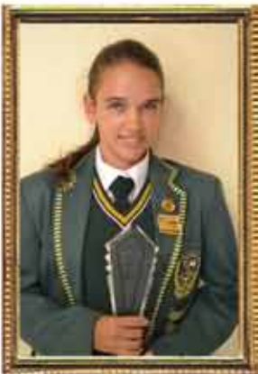
Stapelberg Alzette Hoërskool Piet Retief 6 Distinctions