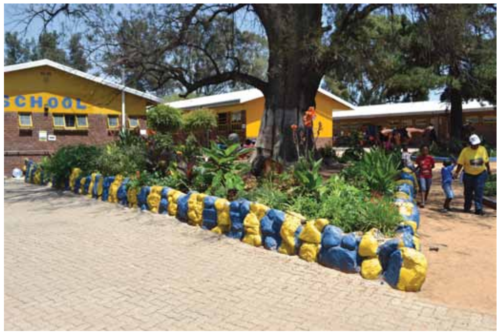
Maloma Primary School got a face-lift in January 2014

We still send our clarion call in this regard because we are of the view that unless all of us contribute meaningfully towards the upkeep of our schools, our dreams of a better future will be deferred.