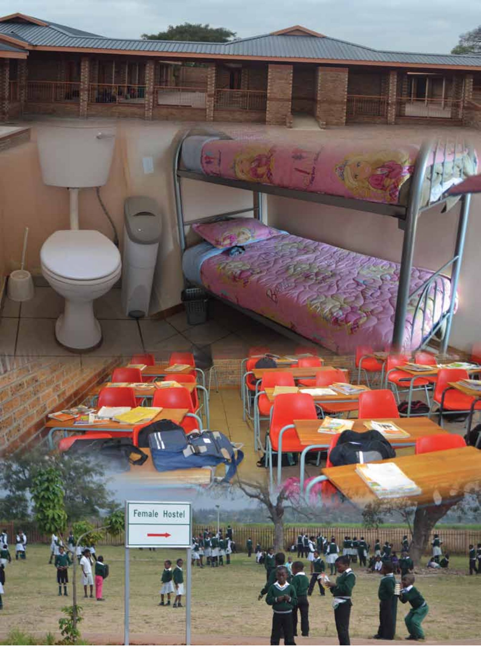
Shongwe Boarding School, Nkomazi Municipality