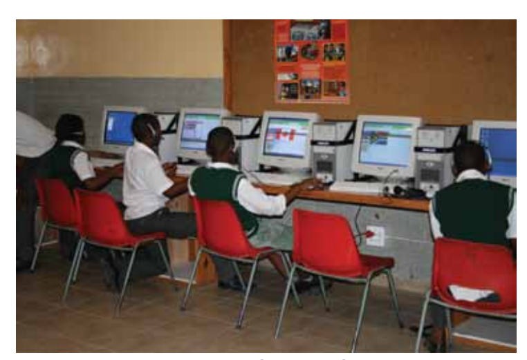
Mgwenyane Computer Centre

Four boarding schools are going to be operational next year to cater for children who are currently in multi grade schools, orphans and those who are required to walk long distances to schools. These are at Nkomazi, Mkhondo and Emakhazeni local municipalities with two already functional.