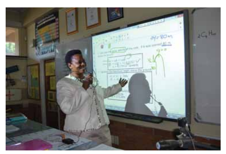
In appreciation of the Ligbron Project

Ligbron Academy of Technology is a multi cultural school since 1993 and is one of the leading schools in South Africa when it comes to the use of educational technology in the classroom.