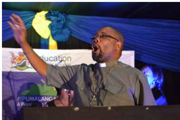
Delivering a convicting sermon

further stated that the office of a religious leader is regarded highly in government in general and in the Mpumalanga Department of Education.