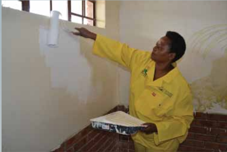
Hard at work: MEC Reginah Mhaule

W ith just a few days left for our schools to reopen, the Mpumalanga Department of Education in collaboration with the Department of Correctional Services stood tall and encouraged communities to also stand up and clean their schools as they prepare for a new year.