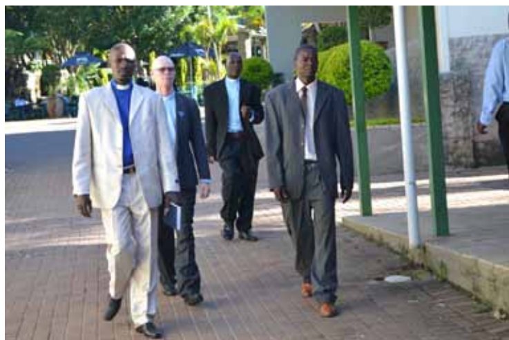
Pastors flocking to the event