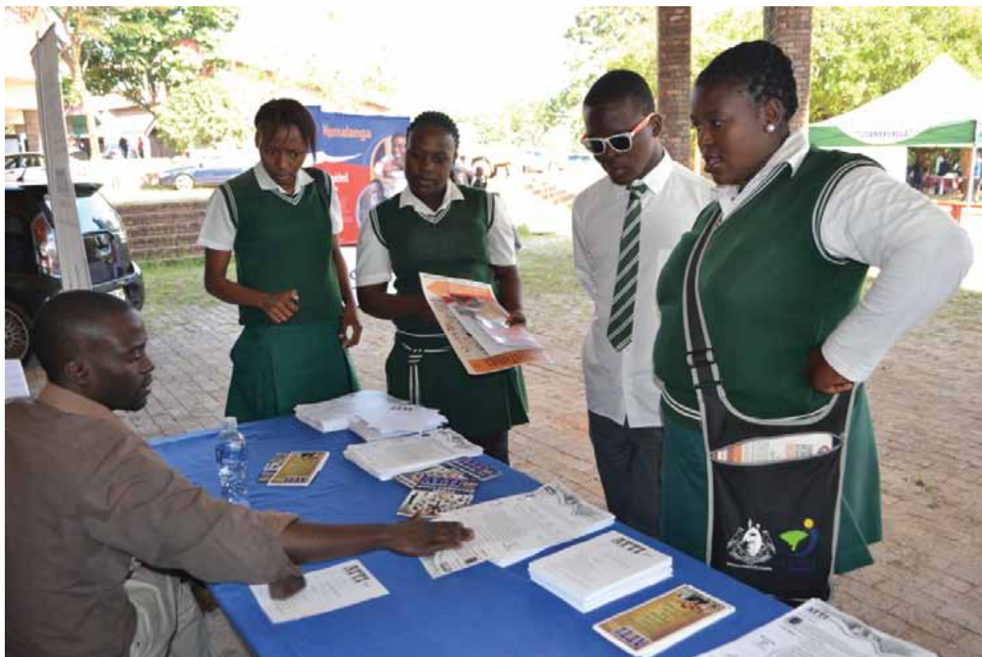
Learners at an Information Sharing Session

The Mpumalanga Department of education in partnership with The National Department of Mineral Resources, MTN, Anglo American, Vodacom and Eskom launched a career guidance and information communication technology resource centre In Emalahleni in 2010. The partnership aims to serve the school communities in the Emalahleni area in the Nkangala District. The collaboration wishes to educate learners within rural areas about ICT so as to improve and enhance their access to education while bridging the gap of communication which exists within rural communities. The project strives to enrich learners' way of connecting and close the communication gap that exists. The success of the project will ensure that schools are developed using Information Communication Technologies (ICT).