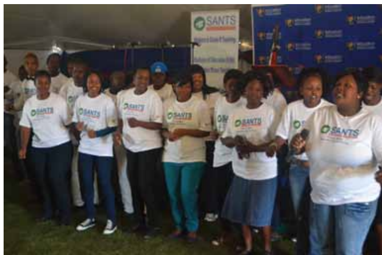
Beneficiaries of the programme, celebrating through song

This centre has been established to promote literacy and numeracy owing to poor learner performance following the Annual National Assessment (ANA) results for 2011, there were many voices of disquiet in the education and training sector about the levels of literacy and numeracy in our schools.