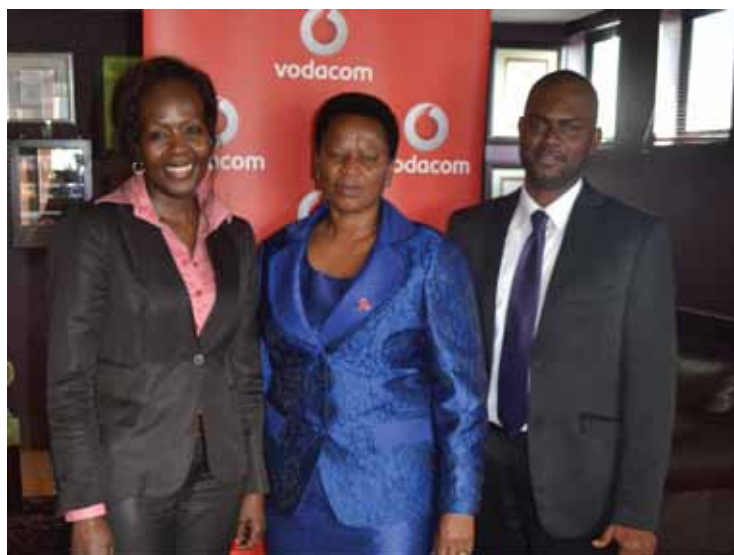
MEC Mhaule with Vodacom representatives