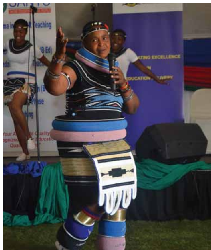
The Ndebele heritage, so colourful and beautiful

The King also signed a memorandum of understanding with Venda University to encourage students to take their studies seriously, promote and preserve IsiNdebele and other languages that are marginalized as well as to promote other learning programmes such as Maths and Science. He further collaborated with private institutions that deal with the training of Educators at Siyabuswa to also play a role in this initiative.