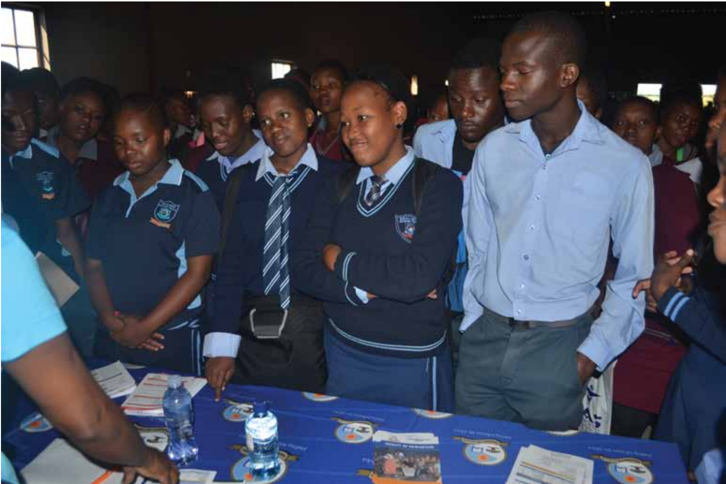
Searching for career knowledge and the future

The success of the project will produce access of information to learners in rural areas at a young and tender age gradually instilling in them the benefits of the use of information technologies.