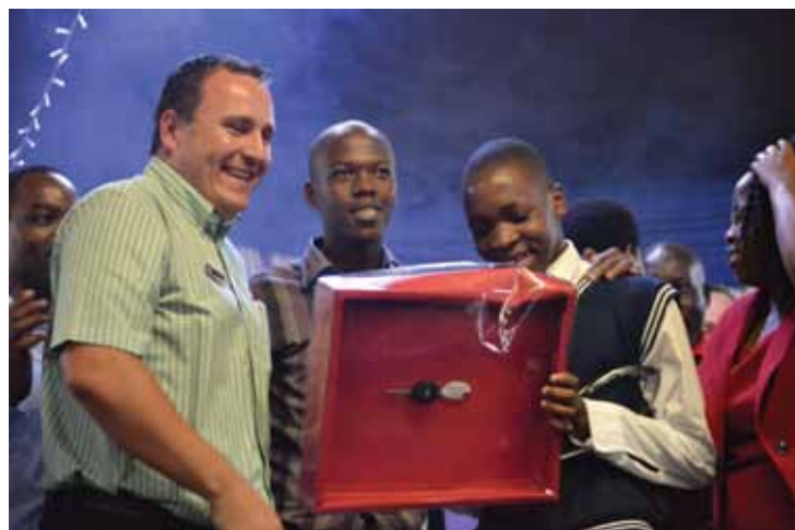
Imperial Toyota donated a car to the overall best learner in the province

of school infrastructure in the province, improved the Management of the Annual National Assessment including the Grade 12 Examinations, facilitated the establishment and the launch of the Siyabuswa Campus and improved the Grade 12 results to 70% pass rate just to mention a few.