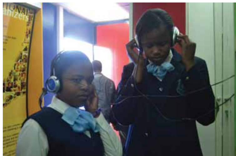
Learners putting the mobile career unit to good use

The expo also took into account the role that Government, Institutions of Higher Learning, Private Sector and the community needs to play in order to create awareness on the importance of education, targeting Grade 10 – 12 learners.