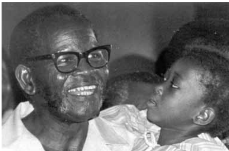
OR Tambo, the family man