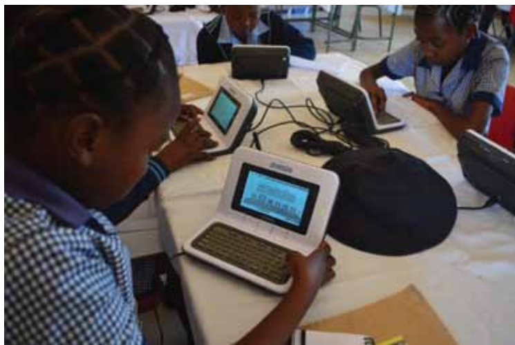
Bridging the Digital Divide

These Streetwise Computer Gadgets valued at R290 000 are programmed by a Cape Town based company called Content and are a real bridge to the digital divide for the community of Mzinti as other schools also get assisted through learning area topical research. The programme caters for all the