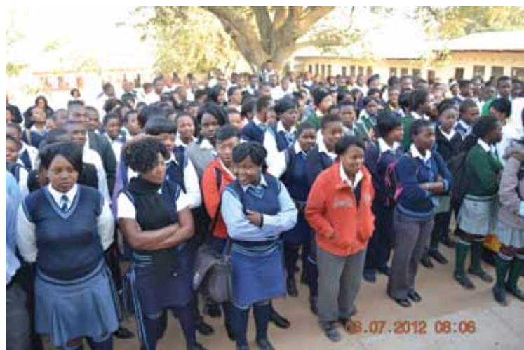
Mabharule Secondary School learners

The results will be released on 3rd January 2013.