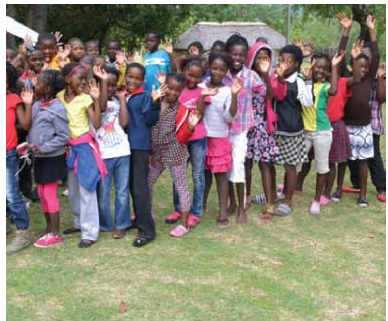
Its game time for these young ones