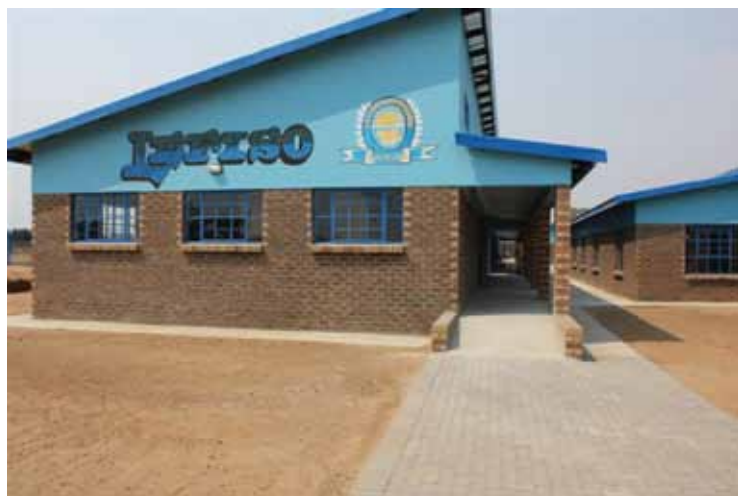
Lefiso primary school in Marapyane

Ditlhokwe Primary School (New Admin block)