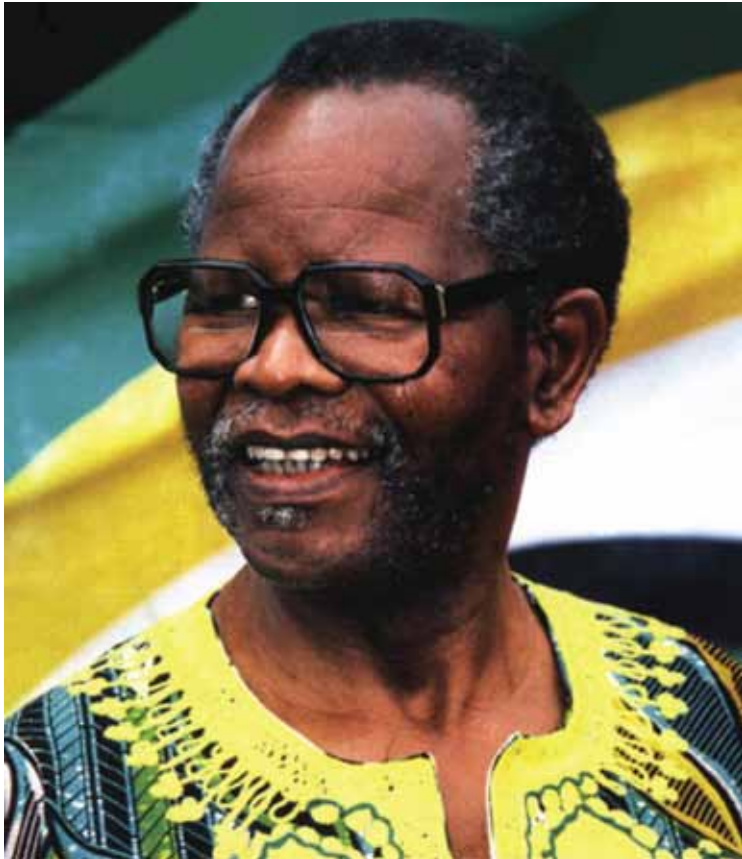
The Legendary Oliver Tambo

Oliver Reginald Kaizana Tambo (OR) was born in the village of Nkantolo, Bizana, in the Mpondoland (eQawukeni), region of the Eastern Cape, on 27 October 1917. His father had four wives and ten children and, although illiterate, was comfortably off. As a young boy, he was given the task of herding his father's cattle.