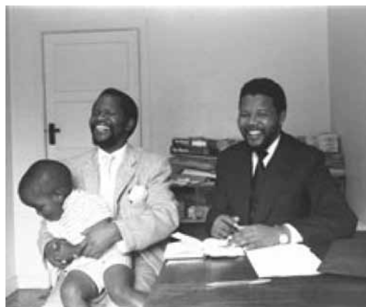
Mr OR Tambo with Nelson Mandela

Campaign issued a scathing memorandum, upon their release, of various senior ANC leaders and accused Tambo of failing to adhere to democratic principles. Tambo was disturbed by the memorandum and at the low morale in the camps. As a result, he decided to call a consultative conference of the ANC. He sent word, secretly, to the leadership on Robben Island about the conference. After months of intense preparation, the conference of about 700 ANC members in exile, MK and the Congress Alliance partners took place on April 1969 at Morogoro, Tanzania. In his address to the conference, Tambo emphasised that it was a consultative conference.