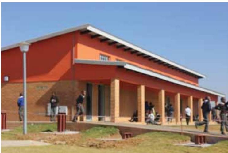
Vezimfundo Primary School in Delmas

Lekholane Primary School is another newly constructed school project within the Marapyane Circuit. The project entails 15 classrooms, an Admin block, a computer lab, a kitchen, ten learner's toilets, two 10 000 litres water tanks and palisade fencing.