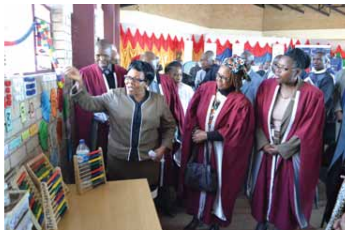
The entourage visiting the education stalls

Reality is that a learner's performance is directly linked to educators' knowledge and skills, as research indicated a positive correlation between