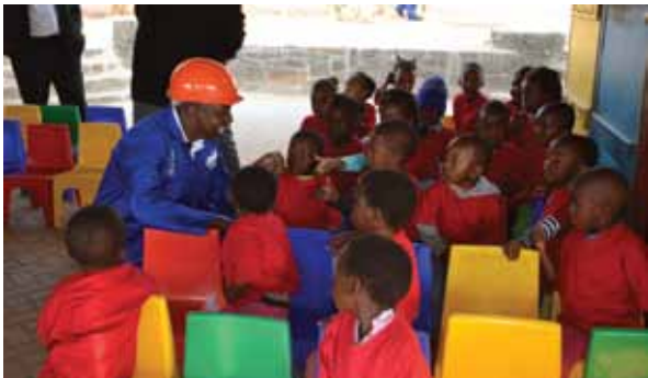
Our pride and Joy; our children

All these schools were visited by MEC and members of the legislature who observed the national directive of hoisting the flag and singing the Madiba special birthday song. The Premier visited Highveld High School where he encouraged learners to follow the path of Madiba and to remember where they come from. "I want to encourage you to focus on your studies and refrain from such bad habits as drinking alcohol and taking bad decisions that jeopardize your future. Focus on your studies because that is what your parents and government sent you to school to do," said Premier Mabuza before sharing the birthday cake with learners.