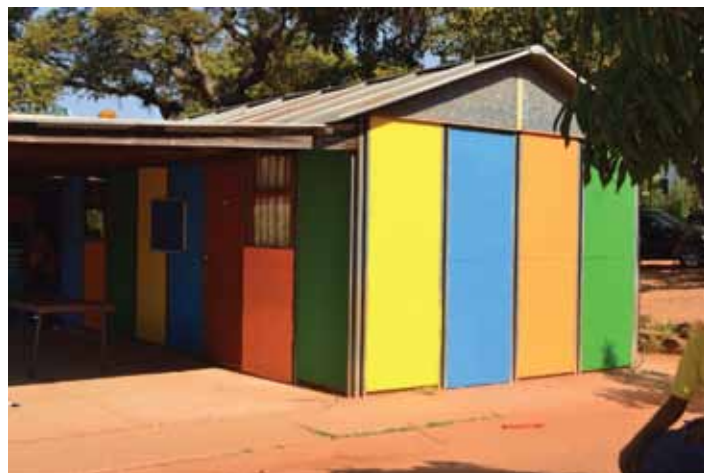
Colour and splendour restored at the centre

On 18 July 2013, which marked the birthday of the founding father of our democracy, former President Nelson Mandela, the department in collaboration with The Banking Association of South Africa Celebrated Mandela Day by launching the Teach Children to Save Programme which was held at Lundanda Primary School. The leadership of the Banking Sector rendered lessons as part of their 67 minutes contributions.