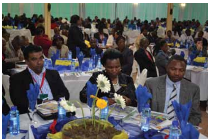
Senior Management formed part of the delegation to the Indaba

The Indaba took its queue from the significant fact that only education is the viable vehicle to fight the triple challenges of poverty, unemployment and inequality.