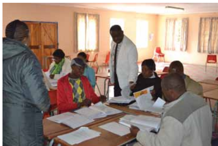
Imparting and acquiring knowledge and skills for a better future

CAPS form part of the National Curriculum Statement Grades R-12, which represents a policy statement for learning and teaching in South African schools and comprises the Curriculum and Assessment Policy Statements (CAPS) for all approved subject, national policy