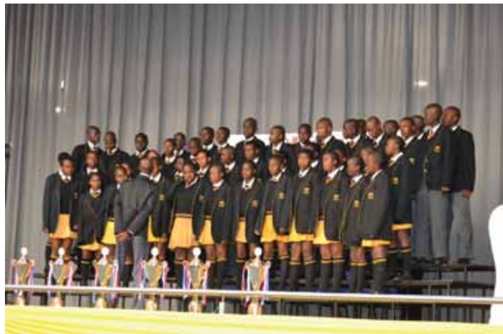
Ready to let their Angelic voices out for the audience