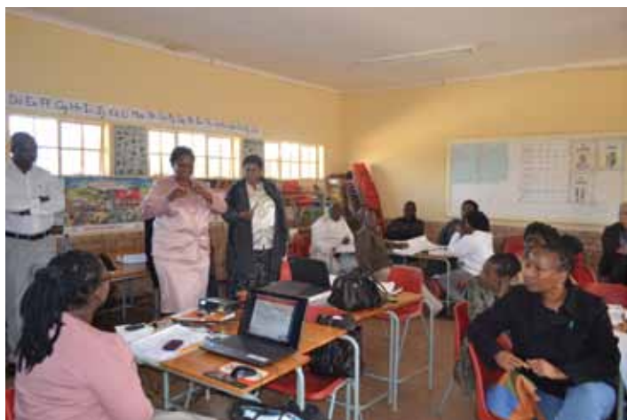
MEC Mhaule encourages educators during one of her visits to the workshops

The National Curriculum and Assessment Policy Statement is a single, comprehensive, and concise policy document, which will replace the current Subject and Learning Area Statements, Learning Programme Guidelines and Subject Assessment Guidelines for all the subjects listed in the National Curriculum Statement Grades R - 12.