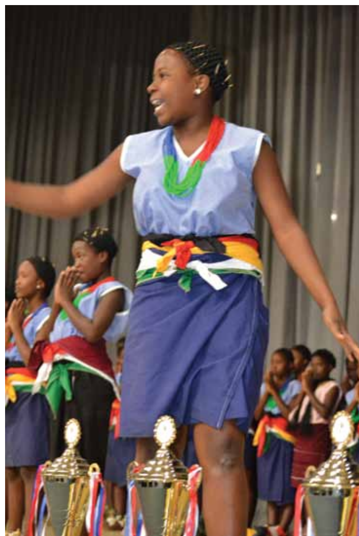
The splendour and colour of the Eisteddfod

Only choirs that obtained position one will proceed to represent the province in the National Championships which will be held at Rhema Bible Church Johannesburg from 02-05 July 2013.