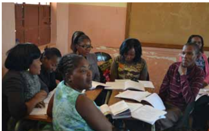
Doing it for the love of our kids and future, teachers attending a CAPS workshop

The Mpumalanga Department of Education has embarked on a workshop course in all four districts of the province to empower teachers with regards to the Curriculum and Assessment Policy Statement (CAPS). These workshops were conducted during the winter school holidays so as not to disrupt teaching and learning.