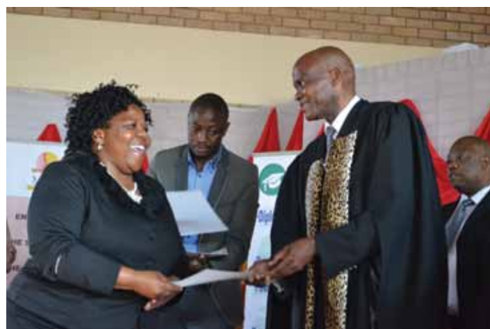
King Makhosoke II handing over a certificate to a beneficiary of the programme

are now more motivated and dedicated and the programme made a vast difference in the