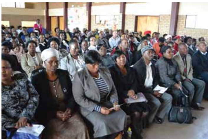
Family and friends came to offer their support to graduates of the programme