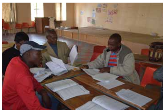
Teacher development in action at a CAPS workshop

Educators were amongst others workshopped on getting to know the content of all subjects, planning and assessment, getting to know national policy pertaining to the programme and promotion requirements of the national curriculum statement grades R-12 as well as monitoring and support.