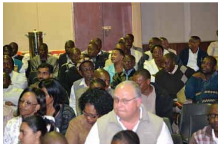
Delagates at the consultative meeting

The MST Academy will be launched in 2014.