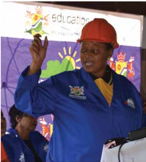
MEC Mhaule speaking at the launch