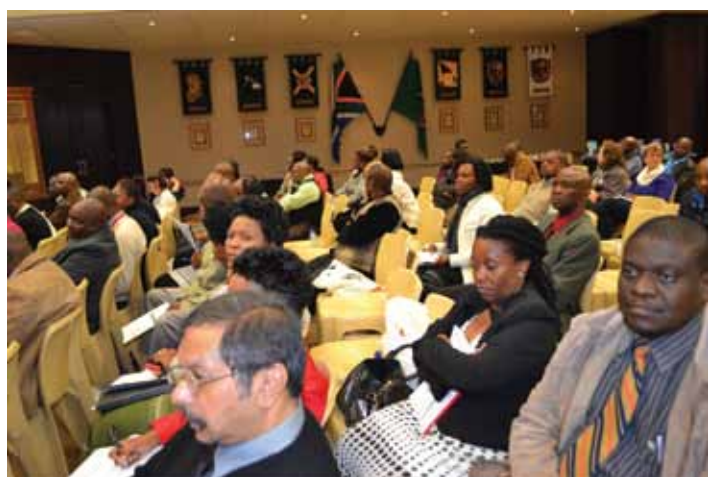
Some of the circuit managers in attendance

Following her pronouncement in the 2013/14 Policy and Budget Speech that there will be no tolerance for schools which are performing below 50% in the 2013 academic year, MEC Reginah Mhaule embarked on a road show to engage circuit managers per district (i.e. Bohlabela, Ehlanzeni, Gert Sibande and Nkangala) and on learner attainment improvement. The department has defined schools which are performing below 60% as poor performing and those below 50% as dysfunctional.