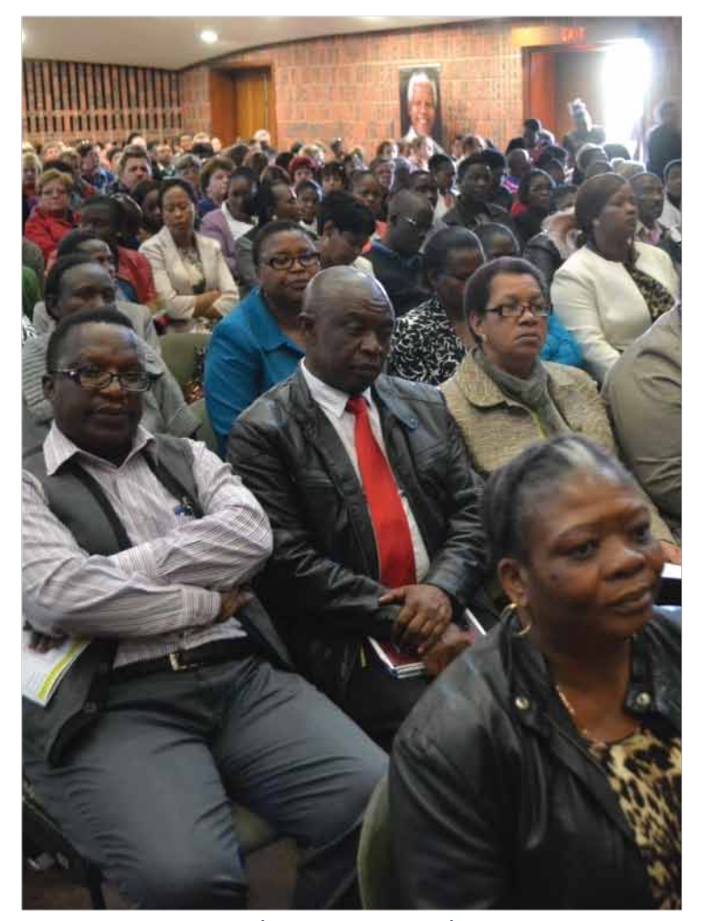
Educators in attendance

The initiative has been positively received as educators are afforded the opportunity to voice out their concerns and frustrations in a safe platform to relevant stakeholders.