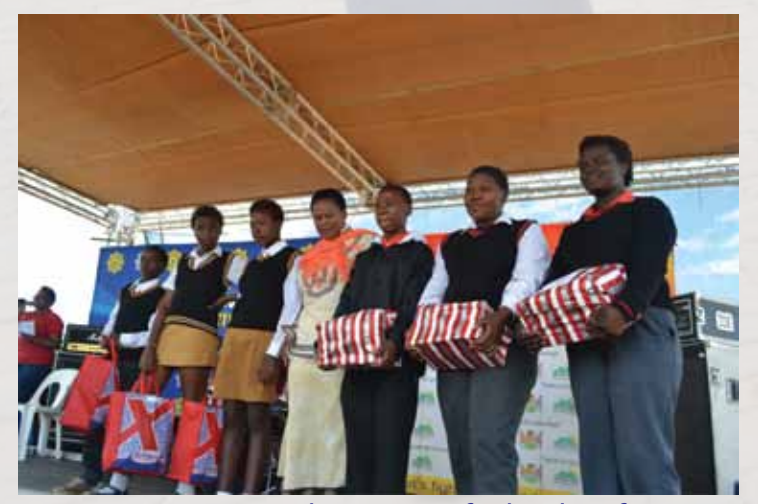
Learners received new sets of school uniform

Hlalisanani Primary School is a fully fledged primary school in Tweefontein South Circuit in the Thembisile Hani Local Municipality, Nkangala District. The school project is comprised of 18 Classrooms, 2 grade R facilities, an Administration block, a library facility, a computer laboratory, fencing, water, rails and ramps, 27 toilets, a