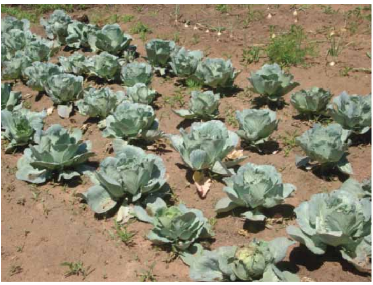
The Cabbage Patch brought abour by the donation former Airport area. Many of the learners in the area rely on the school nutrition programme to get their daily sustenance and, without it many will go hungry and will not be able to focus on their education.

The indispensable tank flanked by learners Cyril Clarke Secondary is located in the heart of Mattafin, Nelspruit and hosts 844 learners and has a staff compliment of 30 teachers. All 844 learners come from the disadvantaged backgrounds and come from the surrounding areas such as Ngodwana, Schagen, Cairn, Phumlani, Msholozi, Elandshoek, Sudwala Caves, Mattafin and the