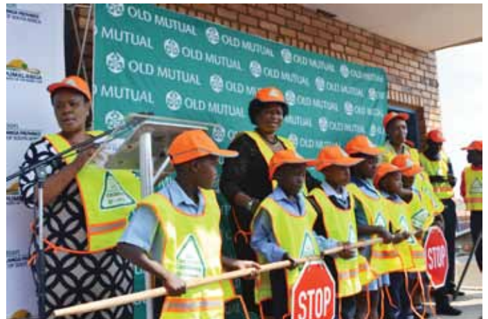
Making school crossing safer

There are a total of eight schools in Mpumalanga that benefited from his initiative in 2015, namely Belfast Academy, Ukhwezi Primary School, Cana Combined School, Qhubekani Combined School, Piet Retief Combined School, Yellowstone Primary School, Kwamashamhlophe Primary School and Ndawonye Primary School.