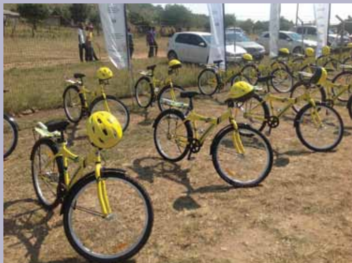
I want to ride my bicycle!

As part of the Shova Kalula programme, the National Department of Transport has weighed in to ensure that no stone is left unturned for learners to attend their teaching and learning classes in present day South Africa through donating 375 bicycles to needy learners at Maqhawuzela Secondary and Mkolishi Combined Schools in Tjakastad, Gert Sibande District.