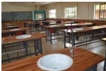
The new laboratory