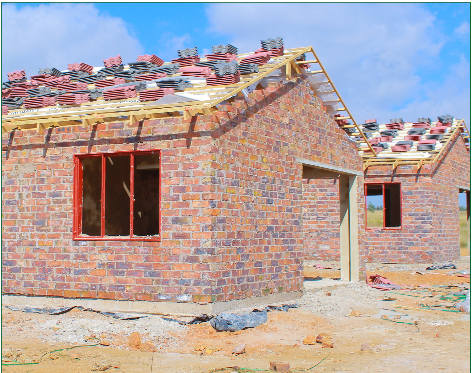
CONSOLIDATE: Department ensuring the completion of unfinished houses at various localities.

The Department planned to deliver 31 324 housing units over the MTSF period, however has to navigate pertinent challenges such as the slow economic growth, the Covid-19 pandemic to mention but the few. It is again worth mentioning that the Department has downscaled on the delivery of top structures and moved towards more delivery of serviced. Thus, over the last seven financial years there has been a steady decline (69%) in housing delivery targets.