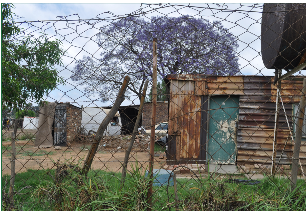
PREVENT: Illegal invasion of land leads to the mushrooming on informal structures.

They include among others: Zandfontein in Govan Mbeki; Outshoonstroom and Burhrmanns in Msukaligwa; Esparado, Karino, Farm Biggar in Mbombela; and Loueville in Nkomazi. The Department's new approach is to focus on rapid release of land by servicing stands to encourage self-built by beneficiaries