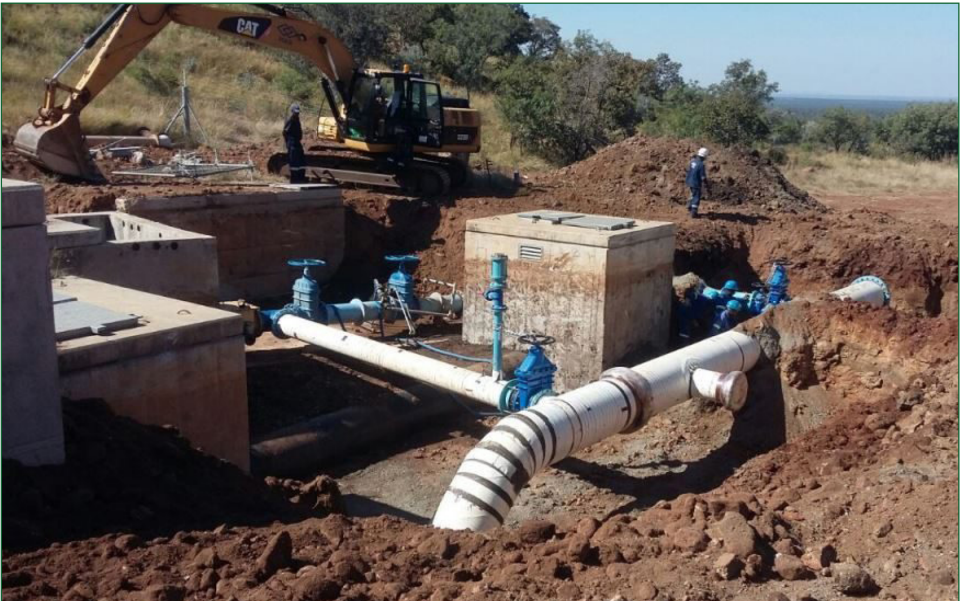
INFRASTRUCTURE: Another water infrastructure project delivered at Dr Pixley Ka Isaka Seme Local Municipality.