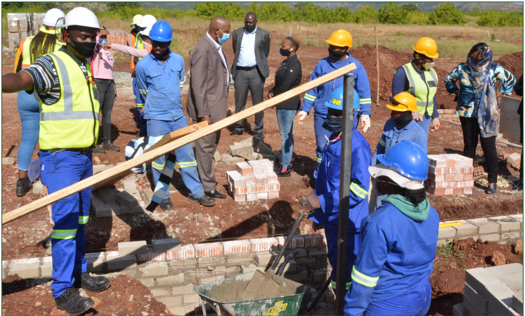
TAKING STOCK: MEC SK Mashilo on an ongoing municipal roadshow campaign in municipalities.

“Efforts to focus on infrastructure delivery”