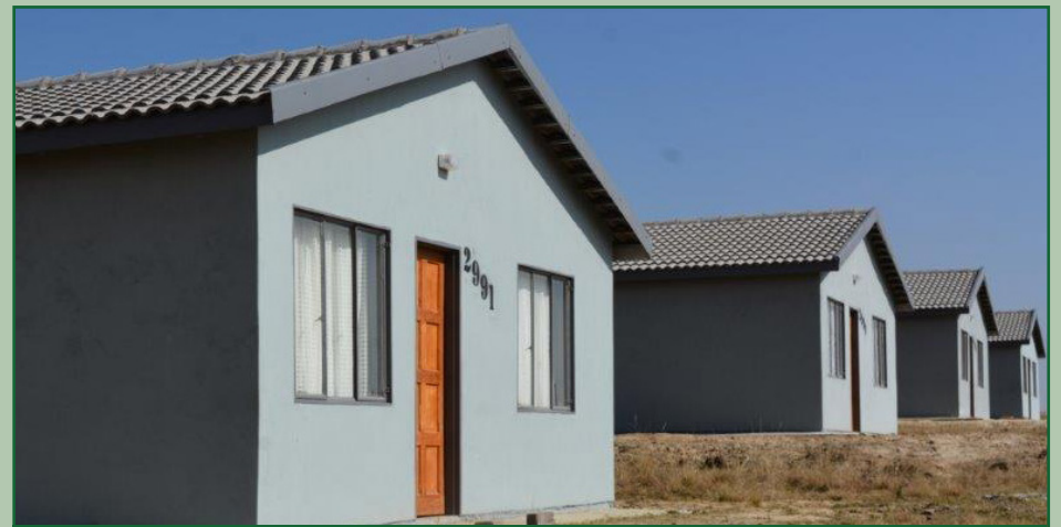
HOUSE: An informal settlements project delivered at Breyten, Msukaligwa Local Municipality.

The Msukaligwa Local Municipality in Mpumalanga has been urged to address sanitation challenges as it remains a hindrance to the successful completion of the 500 units informal settlements project currently being delivered in KwaZanele, Breyten. Human Settlements MEC Speed Mashilo made this remarks when he was accompanied by the Local Executive Mayor Cllr. Joseph MkhaliPhi recently to visit the project and assess progress on human settlements delivery in the municipal jurisdiction. This visit included the unearthing of persistent challenges and finding amicable interventions in some of the local and underlying community disputes which has affected the smooth construction of a sewer pipeline.