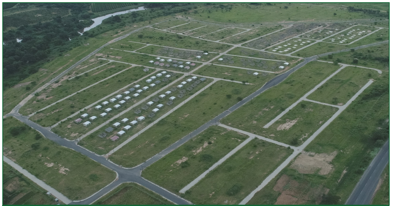
PROPER PLANING: An ideal approach to ensure land is properly serviced.

A budget of R259 million will be directed towards the upgrading of informal settlements throughout the province. Furthermore, the department plans to deliver 3800 serviced sites/stand under the integrated human settlements, during the course of the current financial year, seven bulk infrastructure and sanitation projects