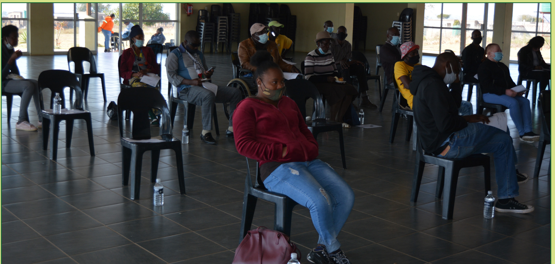
SEEKING SERVICE: Beneficiaries in attendance during the Round-table discussion summit in Nkomazi.

The livelihood of people living with disability in the areas of Nkomazi, Mpumalanga Province leaves much to be desired as far as government services and programmes of development are concerned. This outcry recently grabbed the attention of many and sundry during a round table discussion programme organized by the Department of Human Settlements to help discuss issues pertaining to the development and life changing interventions for persons living with disability in the build sector.