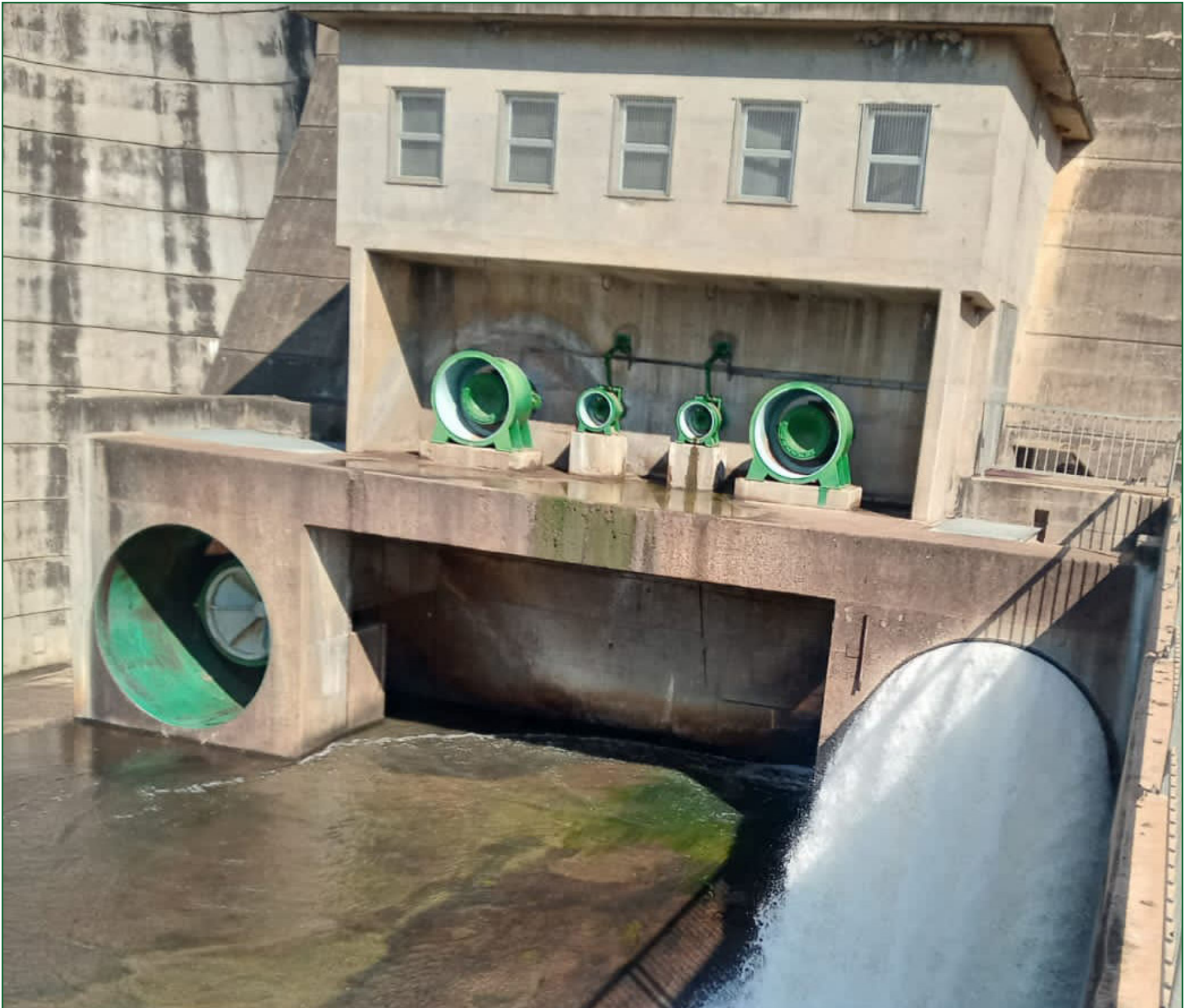
SCARCE: The Mkhombo Dam is one of the biggest water reservoir at the Dr JS Moroka Local Municipality.