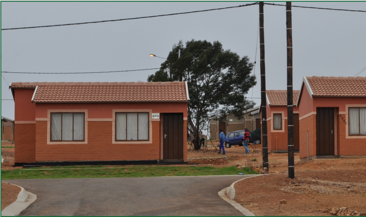
SUSTAINABLE: The Klarinet integrated project is one of the successful integrated delivery in the province.