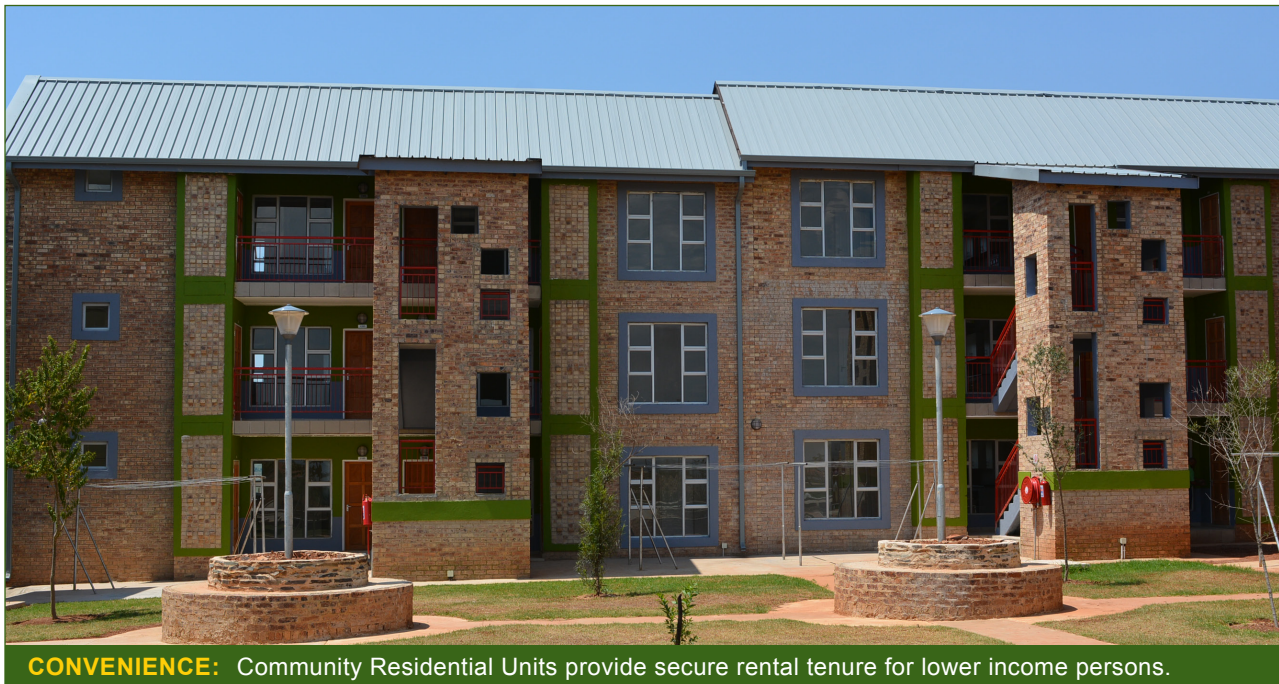
CONVENIENCE: Community Residential Units provide secure rental tenure for lower income persons.

The regulatory authority was established by the National Department of Human Settlements as prescribed by the social housing Act (No 16 of 2008). Its mandate is to “capacitate, invest in and regulate social housing sector. The primary intention of the Social Housing Act is to deliver affordable rental housing for low to moderate-income groups and achieve spatial, economic and social integration of the urban environments in South Africa.