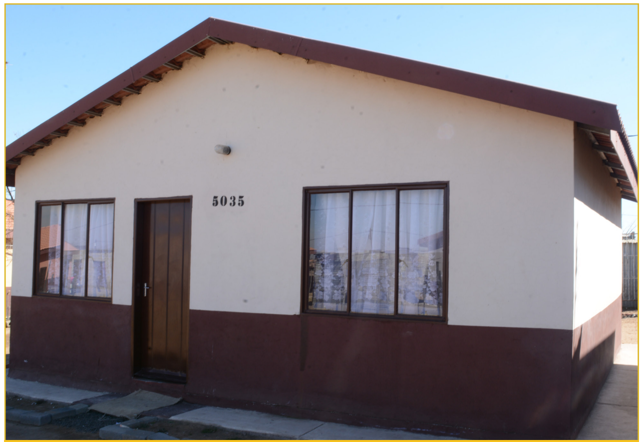
DEVELOPMENT: One of the 200 units constructed at Silobela Township, Carolina.

The ever-increasing population of Silobela a township within the Chief Albert Luthuli Local Municipality benefitted housing units within the township through the Informal Settlements Upgrading Programme. A total number of 200 housing units were constructed at Silobela Extension 2, 3 and 4 with serviced sites, access to water, sewer and road networks. Beneficiaries, were identified through the municipality and the Housing Subsidy System (HSS) for verification and approval, are already occupying their newly built housing units in a formalised settlement. In order to address the Municipal housing challenge the units were constructed under an approved total budget of R25 080 800 and total expenditure