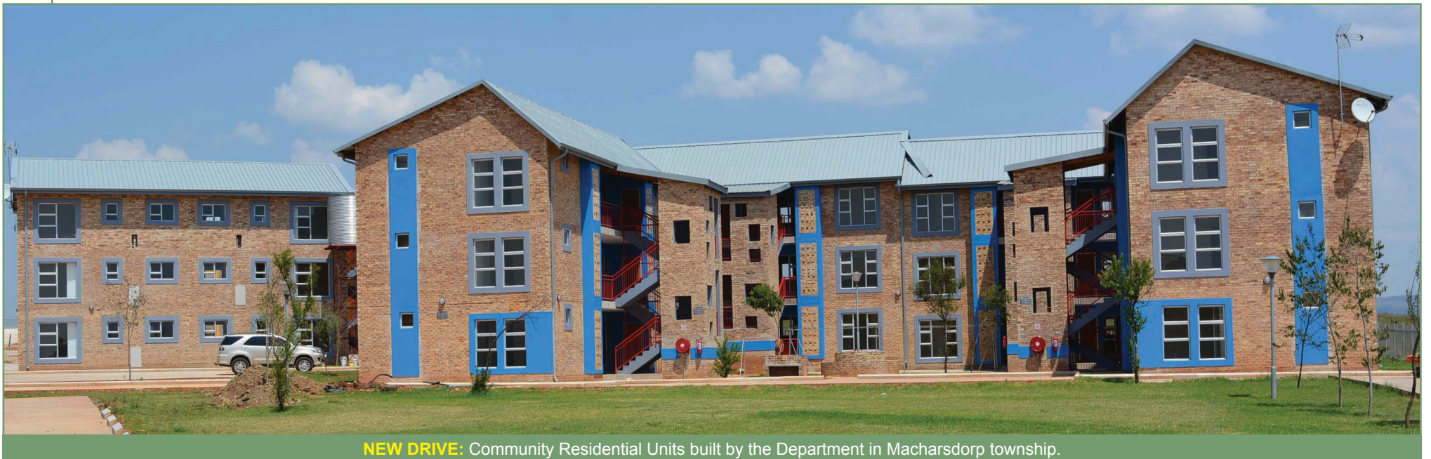
NEW DRIVE: Community Residential Units built by the Department in Macharsdorp township.

O f the R1.766 billion budget allocated by the provincial Department of Human Settlements, a fine share of R227 million would be put aside to build about 11000 integrated sustainable units in the province during the 2015/16 financial year. This was articulated during the budget speech presentation by MEC Violet Siwela at the provincial Legislature on the, 28 May 2015.