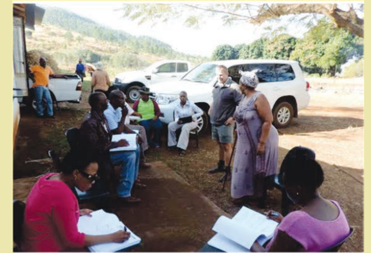
The adjudicating team physically visiting farms nominated for the 2015 FEA.