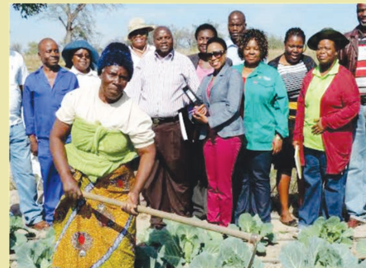
2015 FEA verification and adjudication team on the field.