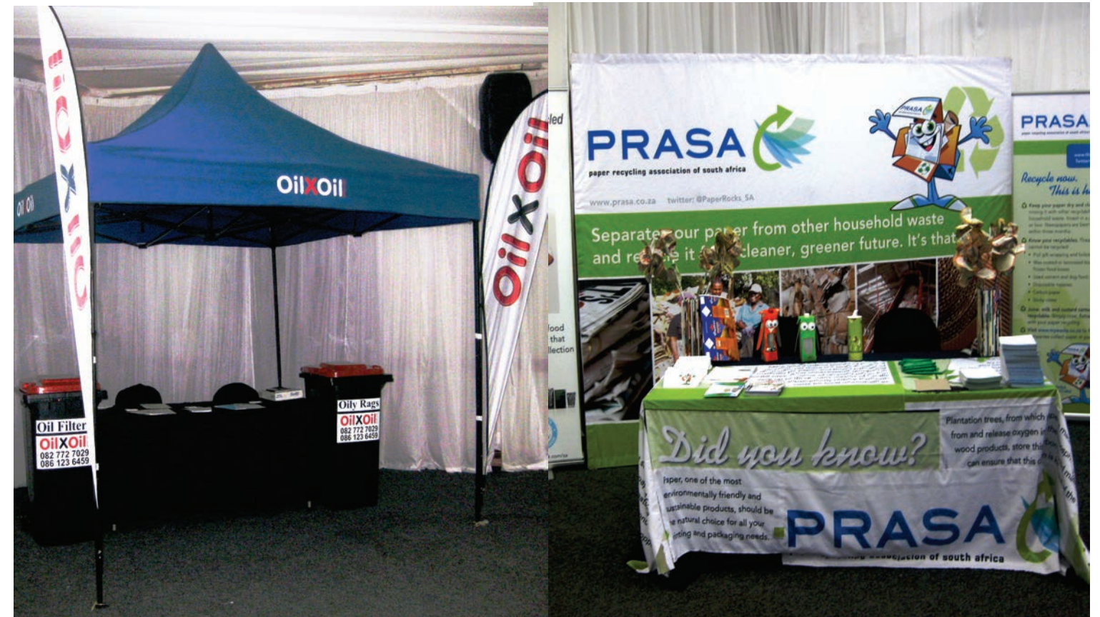
Exhibition Stands at the Environmental Summit.