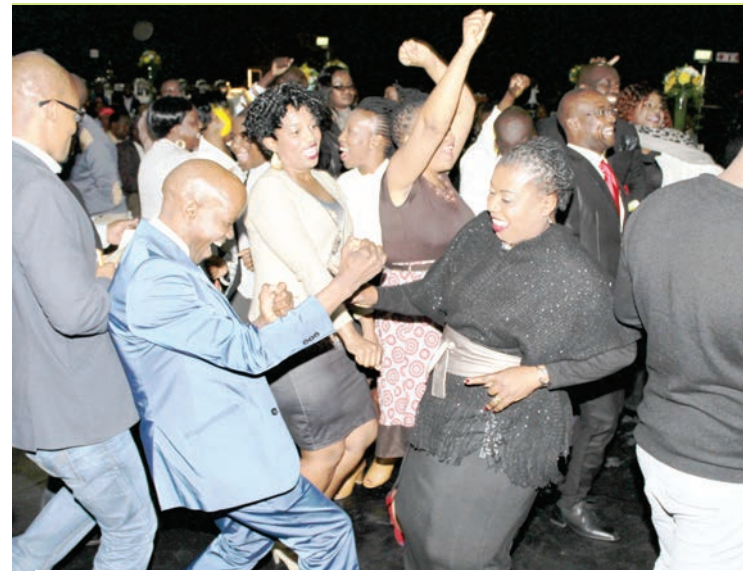
Dardlea colleagues from Nkangala District couldnt contain themselves after the FEA Overall winner was announced.

The initiative is aimed at rewarding the efforts and contribution of women, youth and people with disabilities in matters of food security, job creation, economic growth and poverty alleviation.