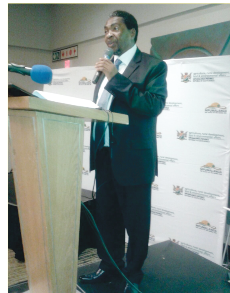
MEC MA Gamede addressing the COP -21 Stakeholder Engagement Workshop in Mbombela.