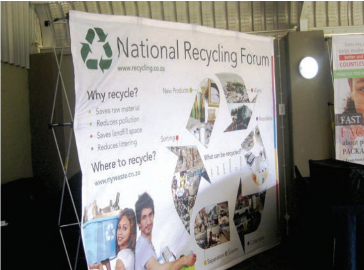
Above and below: Exhibition Stands during Environmental Summit.

But the province faces ever growing pressure on the environment; and if the current challenges are not effectively addressed, they will exacerbate the rate of environmental degradation.