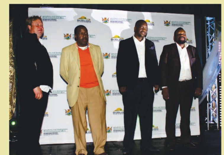
The four main sponsors of the 2015 Provincial FEA were acknowledged.