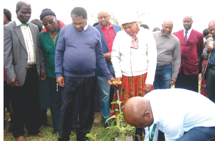
A demonstration to the MEC and the Mayor on how best a tree can be planted while saving water.

The DARDLEA MEC MA Gamede with the different stakeholders attending the event planted 10 trees at the Masibekela Recreational Park. MEC Gamede further handed over 100 indigenous and fruit trees to local schools, clinics and 25 households for planting to alleviate poverty and contribute to food security. Gamede had called on stakeholders to ensure that the partnership and the commitment of government, the private sector and civil society must be sustained in the implementation and management of greening programmes. The National Arbor Week Campaign is celebrated annually from 1 to 7 September.