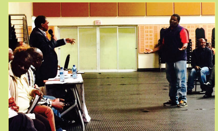
Emotions heating up at a CPA meeting in Nkangala.