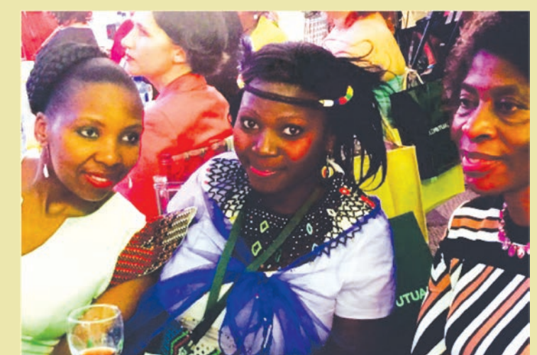
FEA winners representing Mpumalanga in Durban.