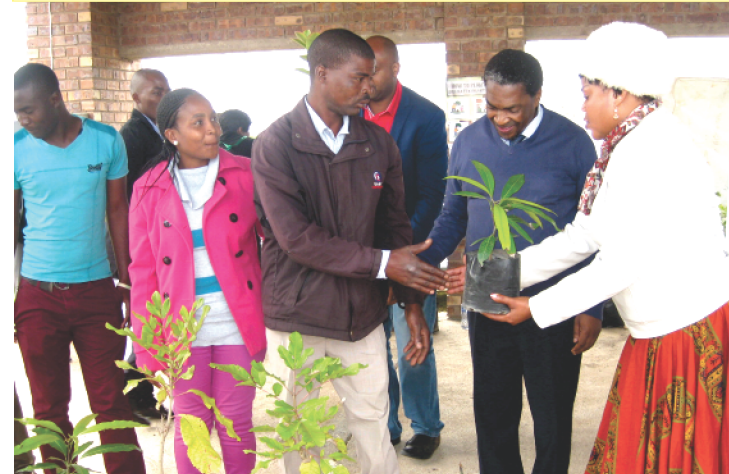
More than a hundred trees were donated to locals to encourage the planting trees.