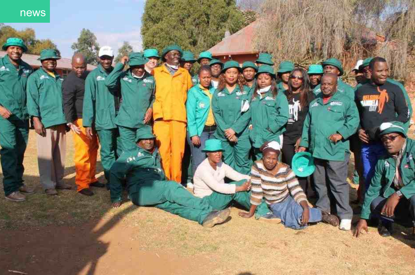
Officials of the Department who participated during the painting of Bosfontein Laerskool just outside Mashishing