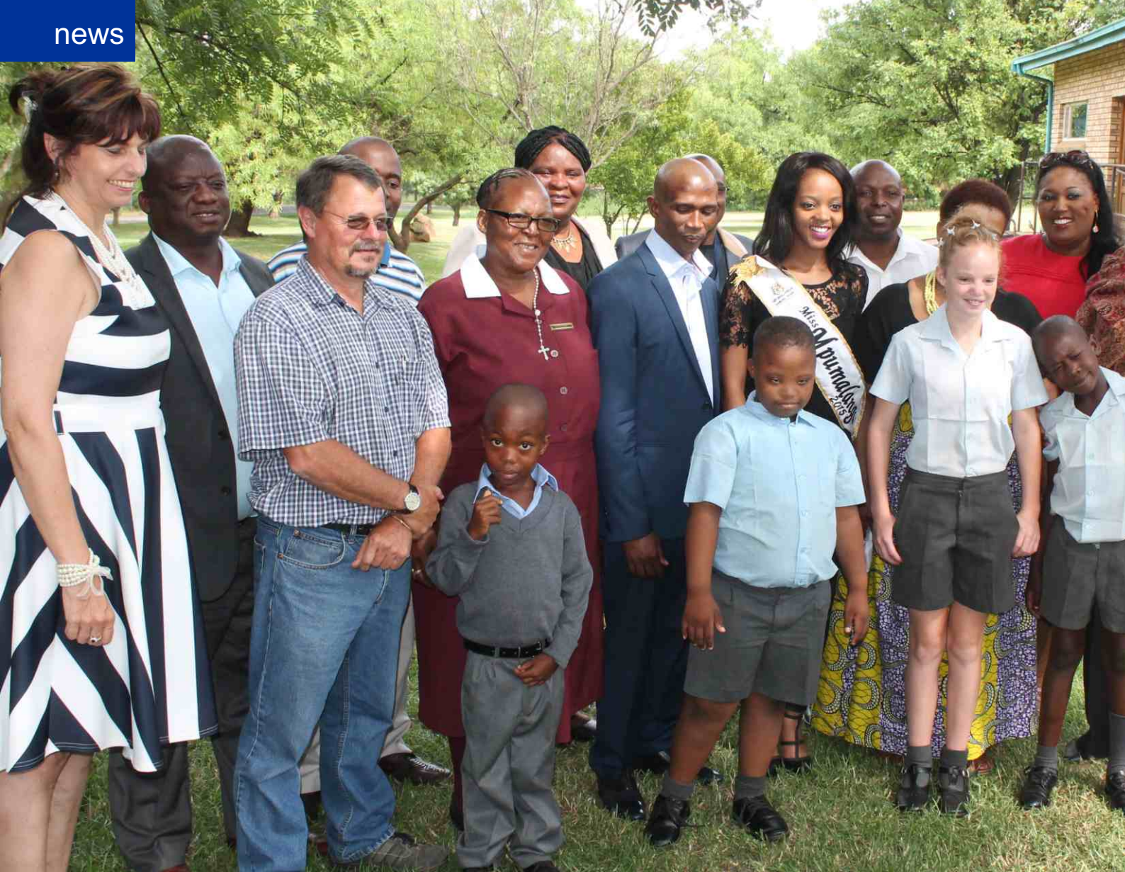
MEC Kholwane school visits in pictures