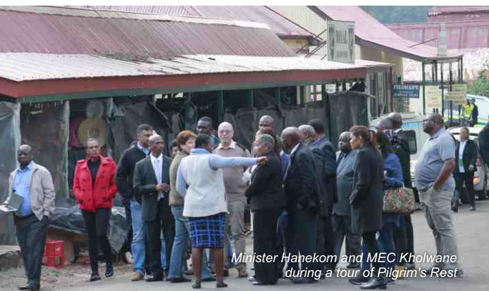
Minister Hanekom and MEC Kholwane during a tour of Pilgrim's Rest