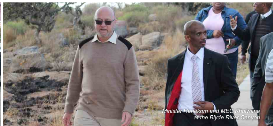
Minister Hanekom and MEC Kholwane at the Blyde River Canyon