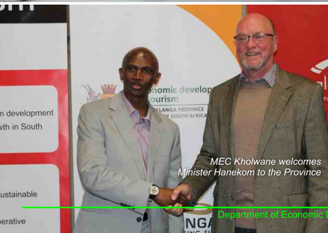
MEC Kholwane welcomes Minister Hanekom to the Province