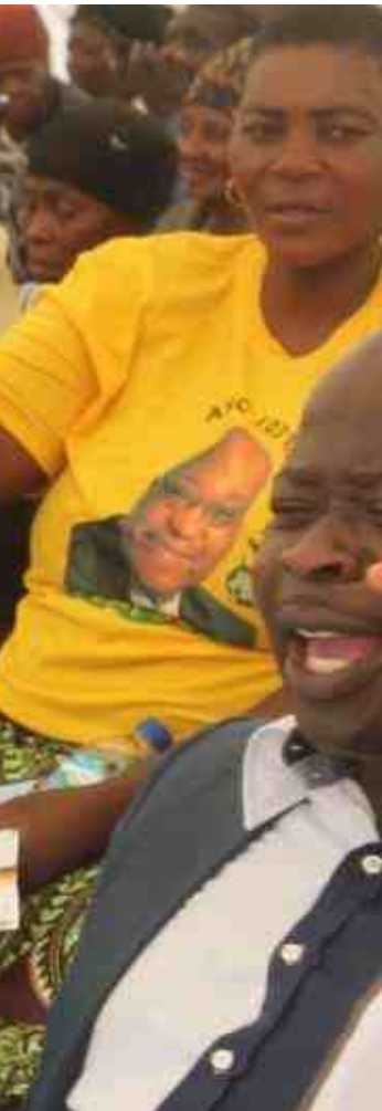
MEC in a jovial mood at the Provincial disability rights awareness