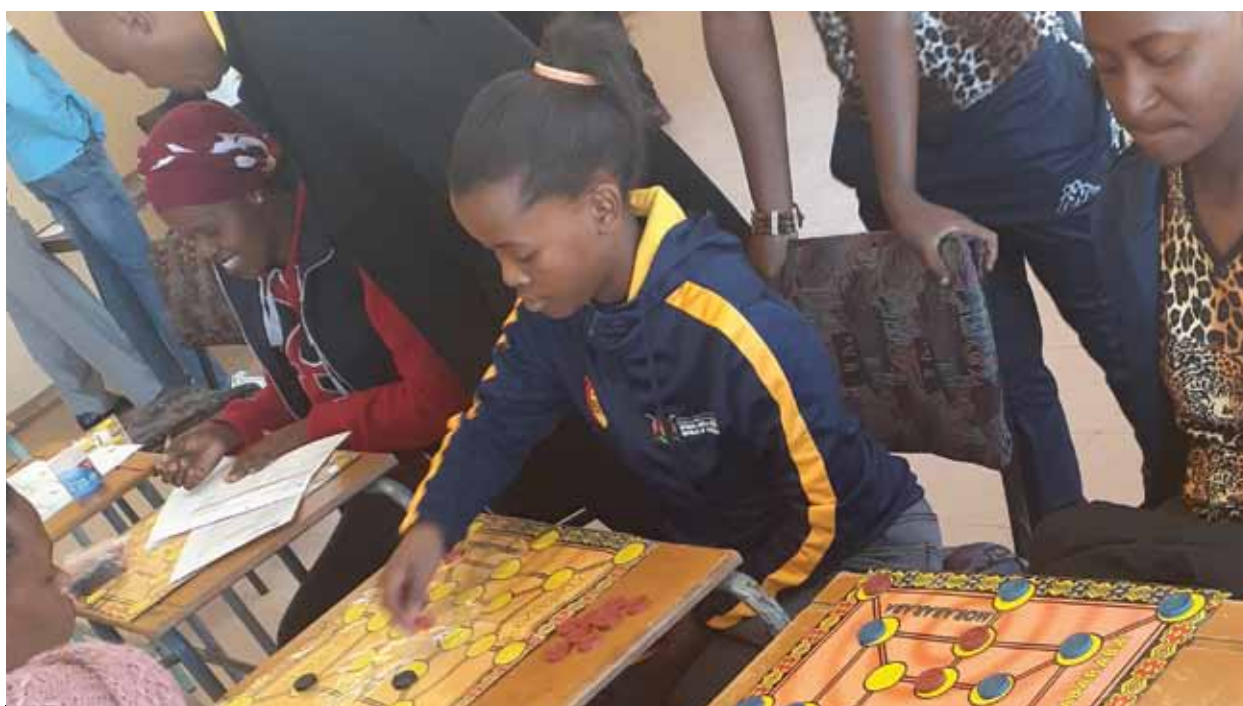
Morabaraba players during the trials.