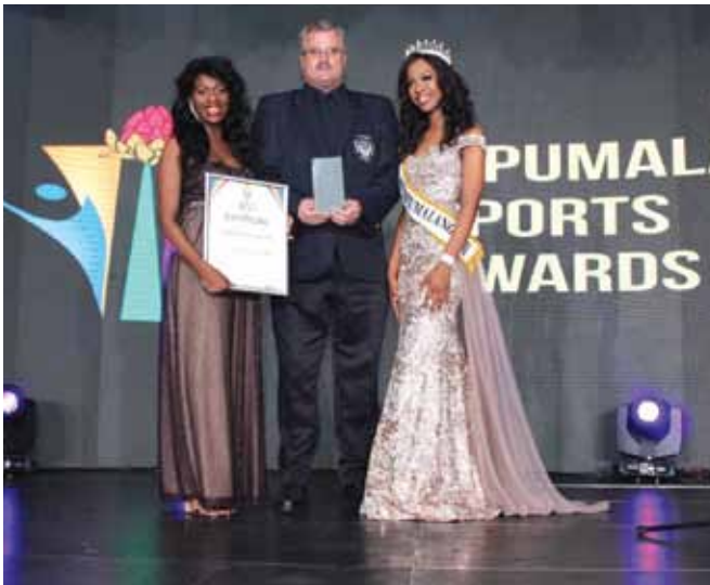
School Team of the Year: Morgenzon Agricultural High