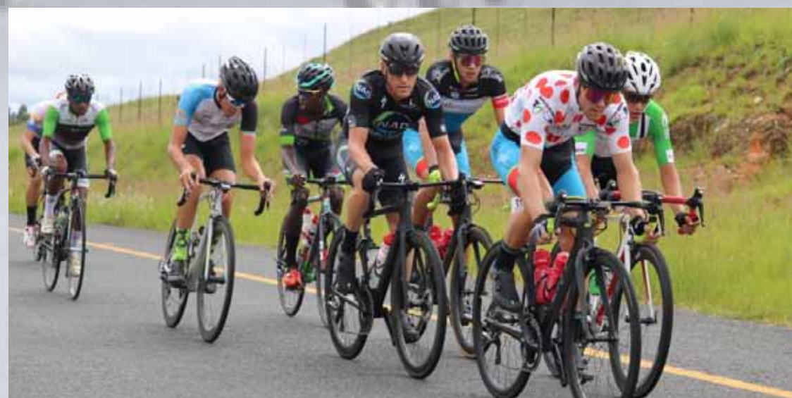
A peloton sprinting towards the finish line in one of the stages of the fourth edition of Mpumalanga Cycle Tour.

“Six Stages, Six days and more than 750 Kilometres which takes riders to the beautiful corners of Mpumalanga.”