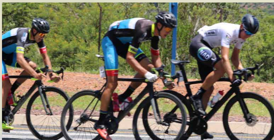
Cyclists jostle for top honours.