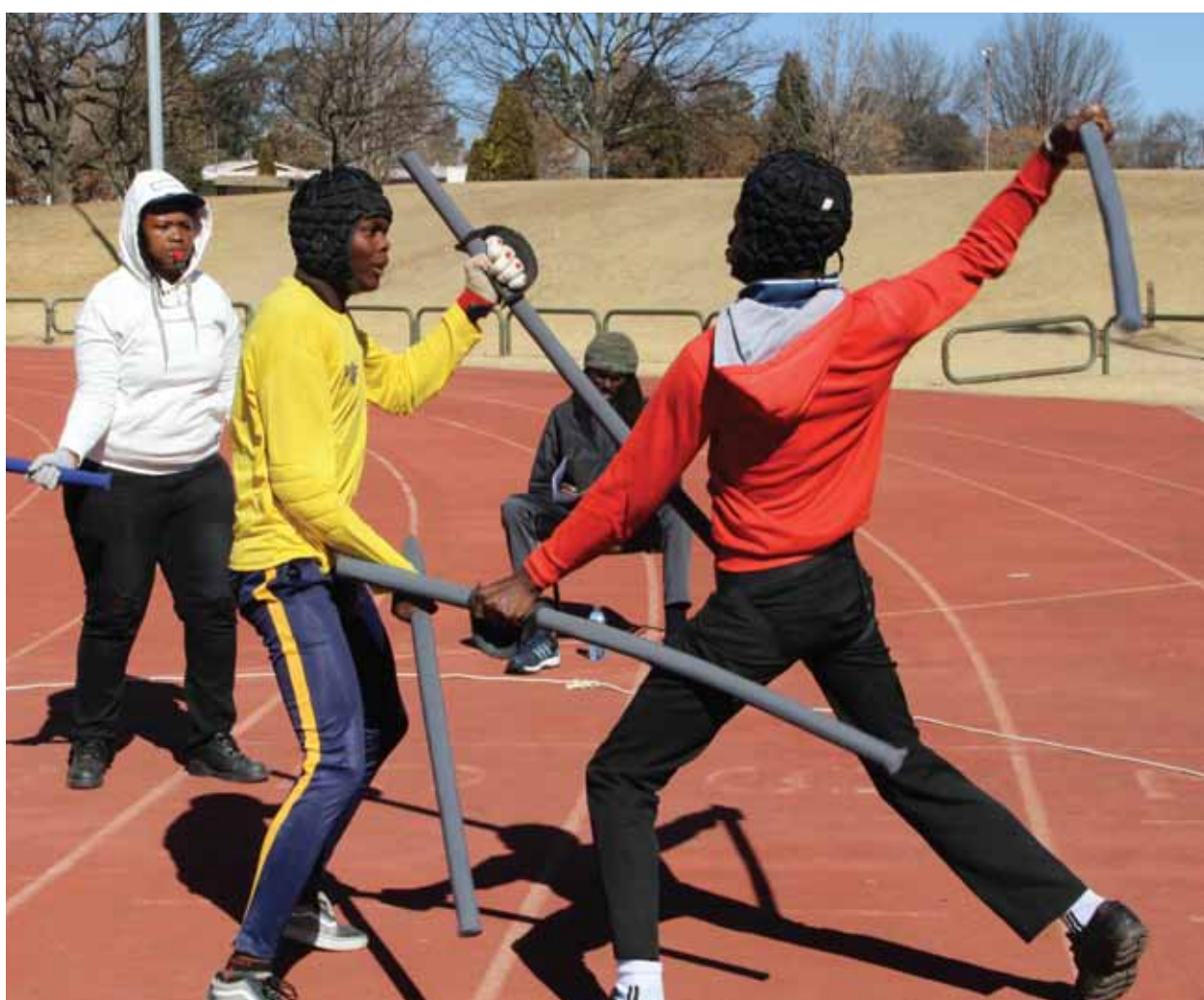
Two boys fight during Intonga trials.