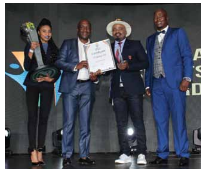
Team of the Year TS Galaxy