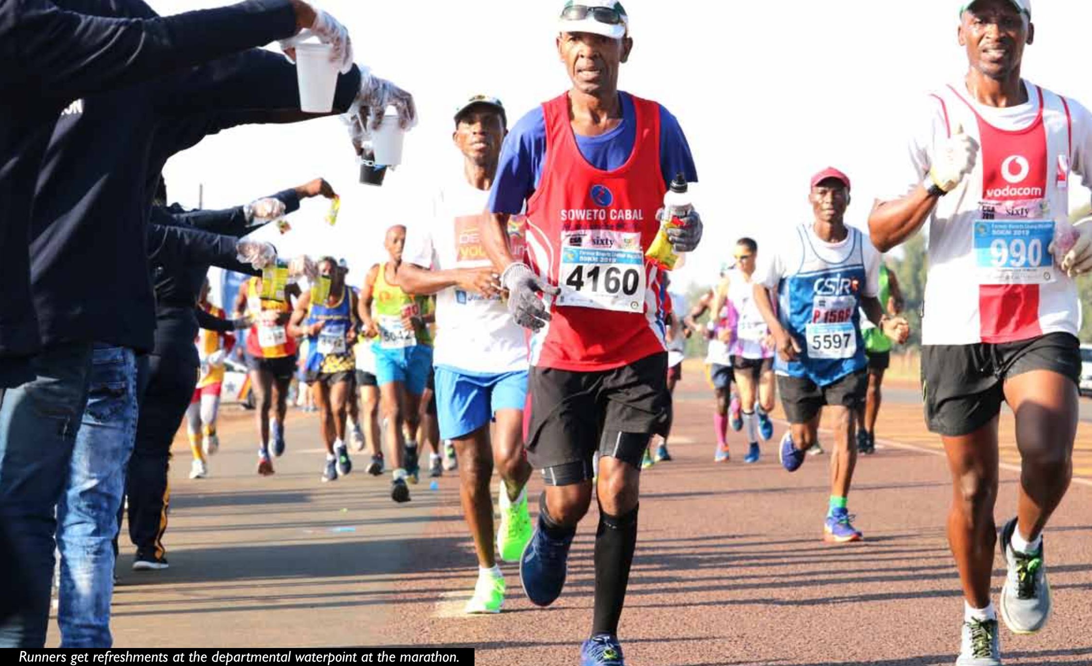
Runners get refreshments at the departmental waterpoint at the marathon.