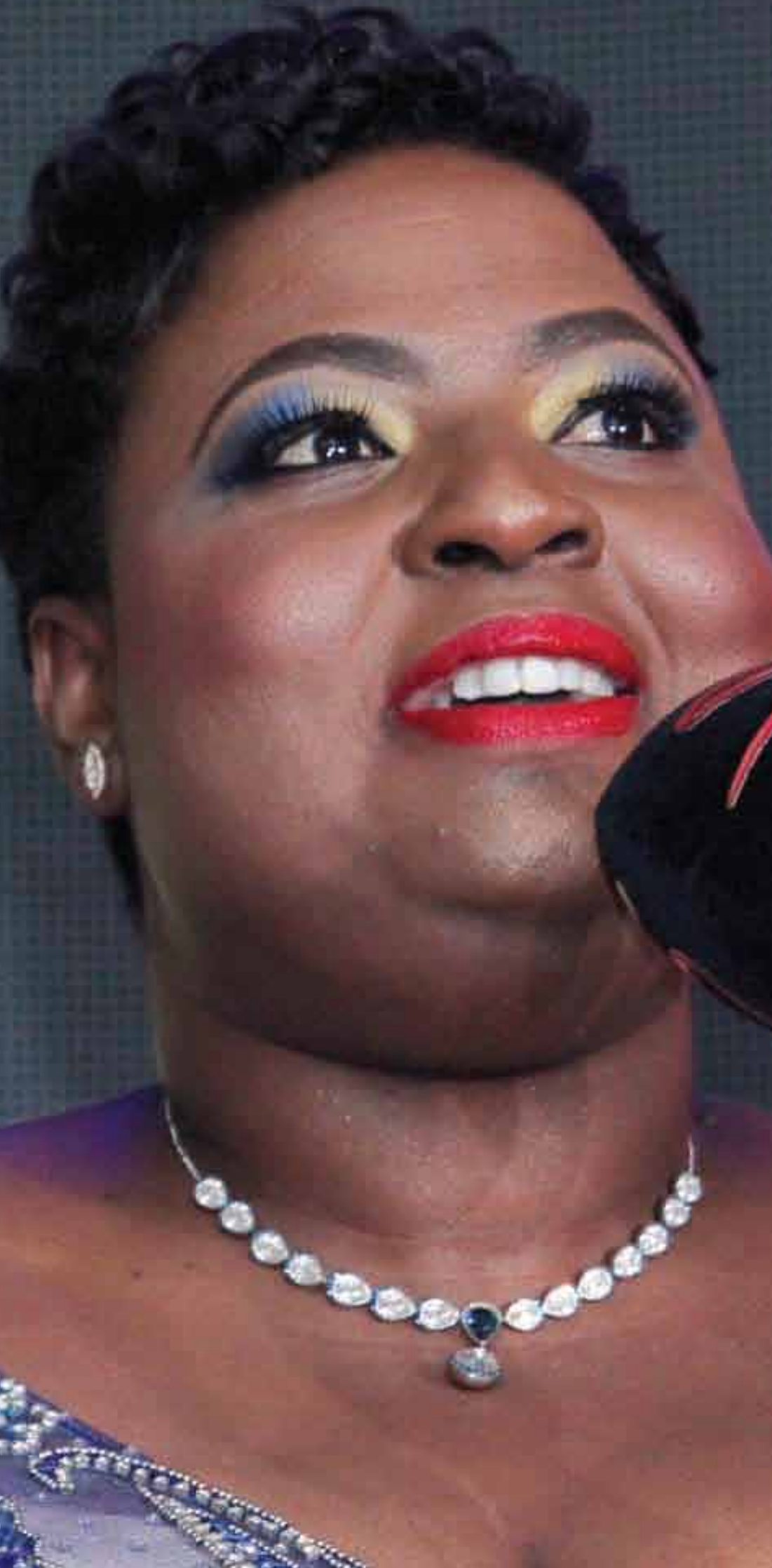
MEC Lindiwe. L Ntshalintshali