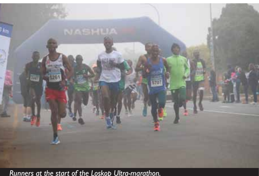
Runners at the start of the Loskop Ultra-marathon.