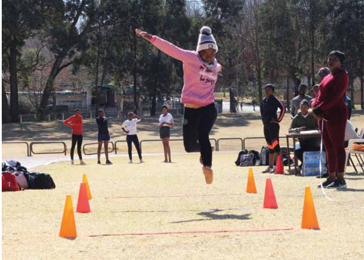
An athlete tries her luck in Drie stokkies.

Indigenous Games are aimed at promoting cultural activities that have a particular appeal to vast sectors of the South African community – young and old, black and white. It goes without saying that they are more than a recreational sport as they play a pivotal role in promoting national unity and social cohesion.