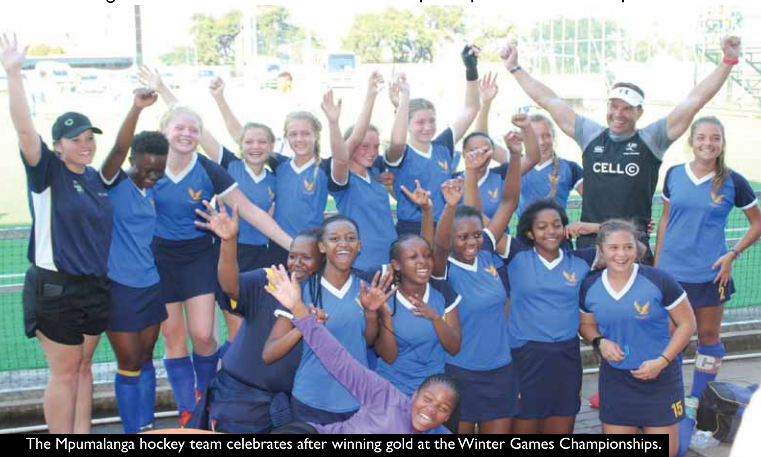
The Mpumalanga hockey team celebrates after winning gold at the Winter Games Championships.

Some of the athletes from Mpumalanga were also selected for national teams during the winter games due to their excellent performances.