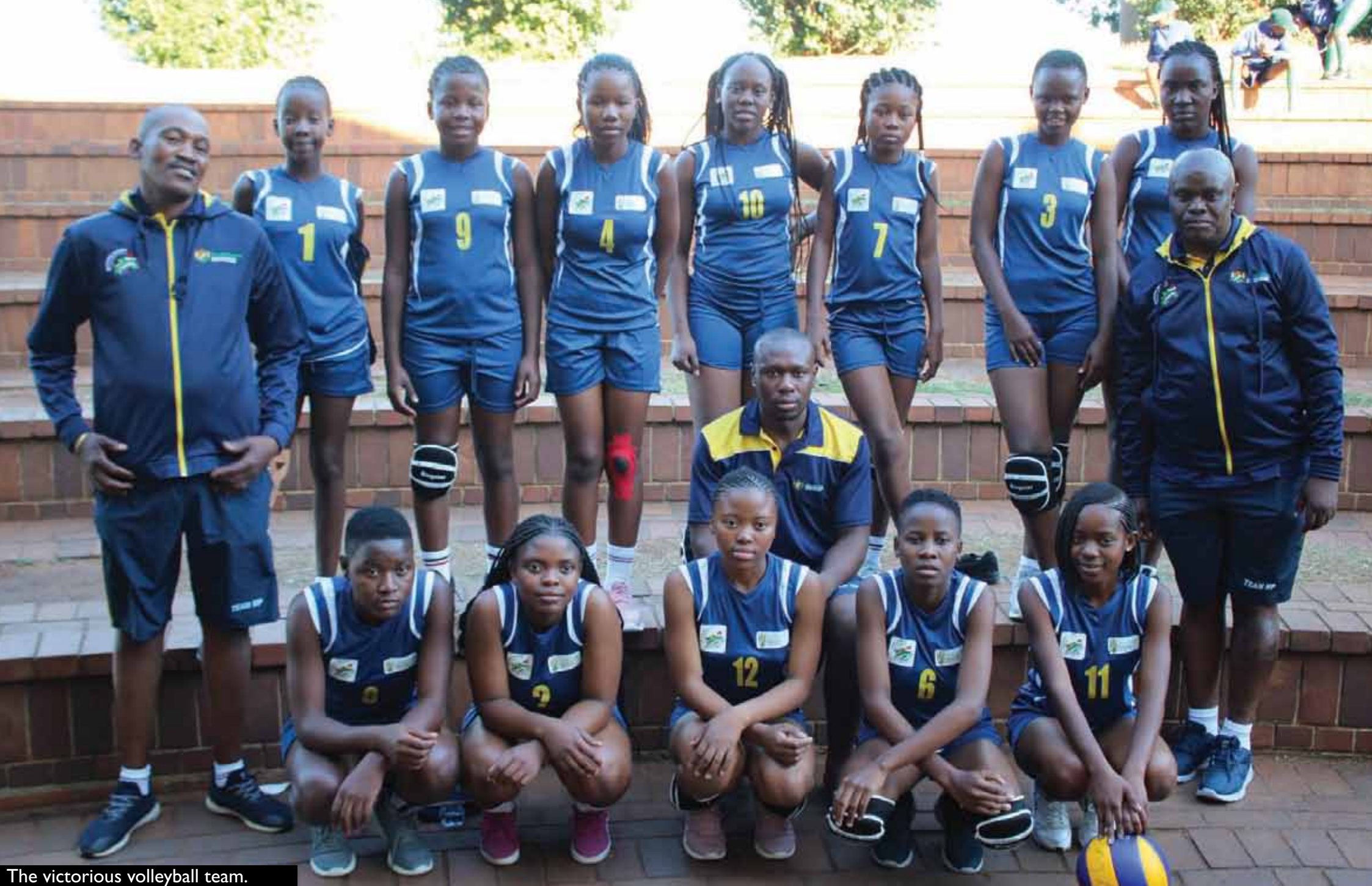
The victorious volleyball team.