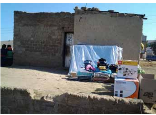
Relieving families from poverty