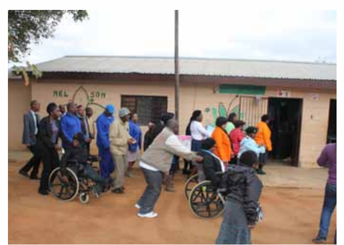
Giving them a meaning in our communities