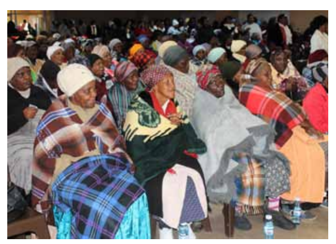
Older persons taken good care of