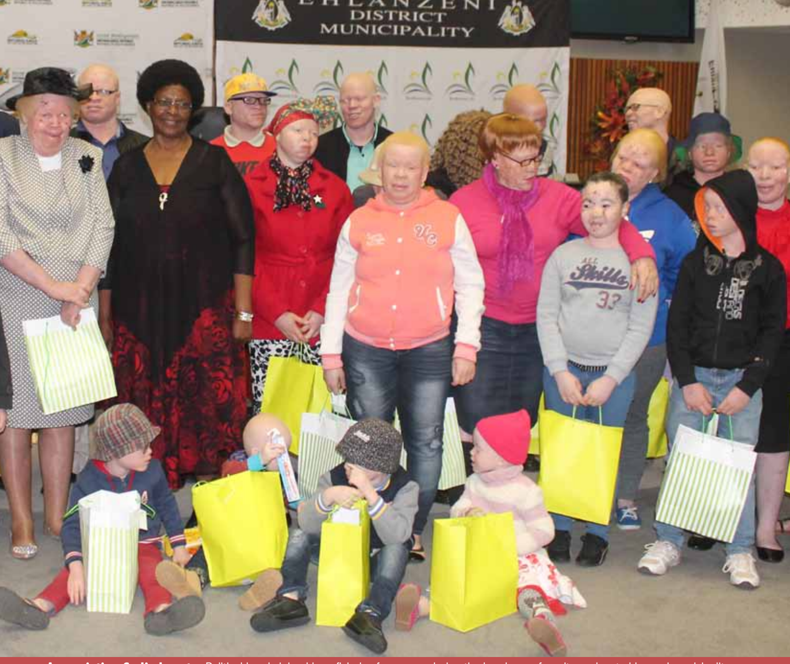
Appreciating God's beauty: Political heads joined beneficiaries for a pose during the handover of vanity packs at ehlanzeni municipality