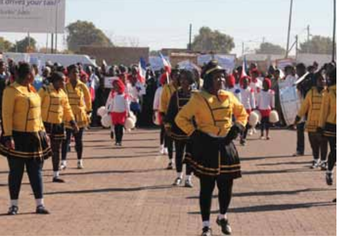
Youth at a glance