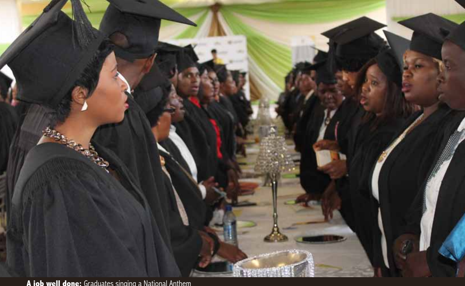
A job well done: Graduates singing a National Anthem