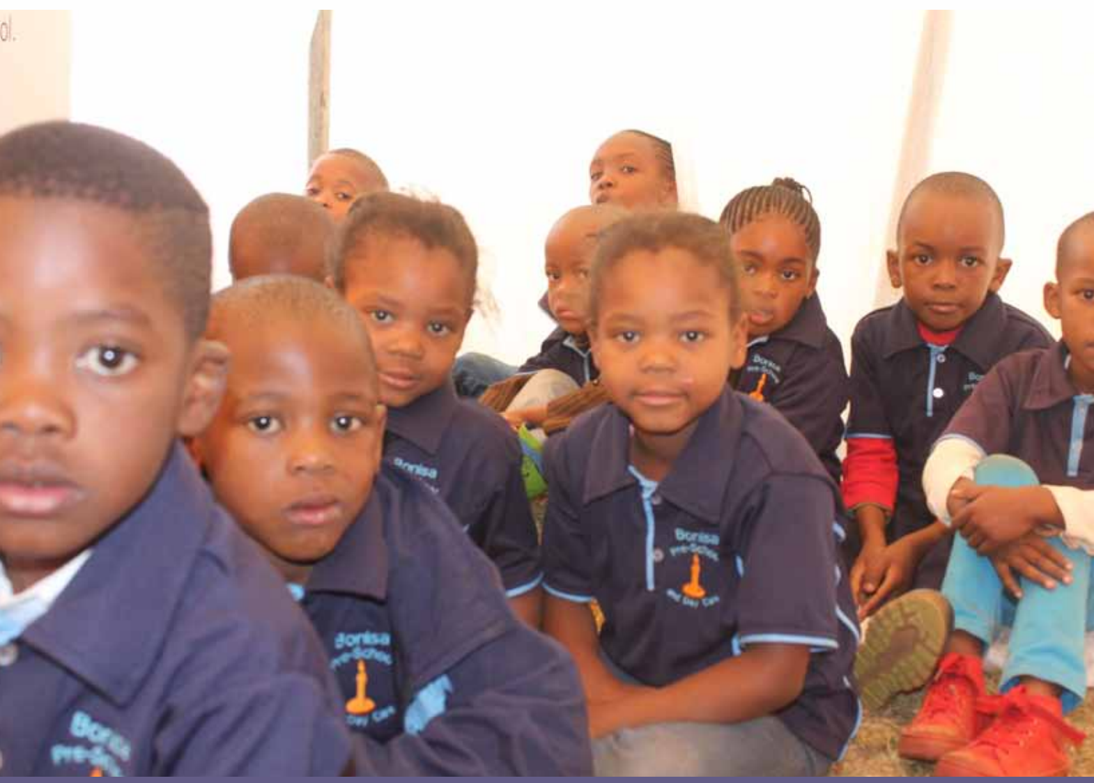
Putting children first: VIPs of the day listening attentively to the speech delivered during the day

beginning of a new exciting journey between the department of social development and National Lotteries Commission (NLC).