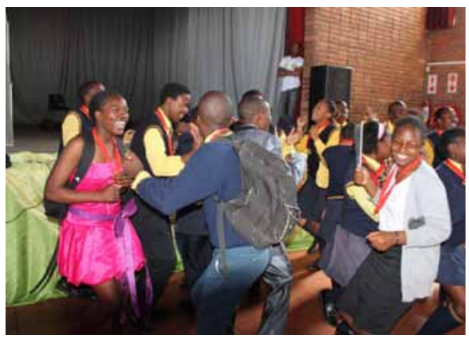
Youth development services