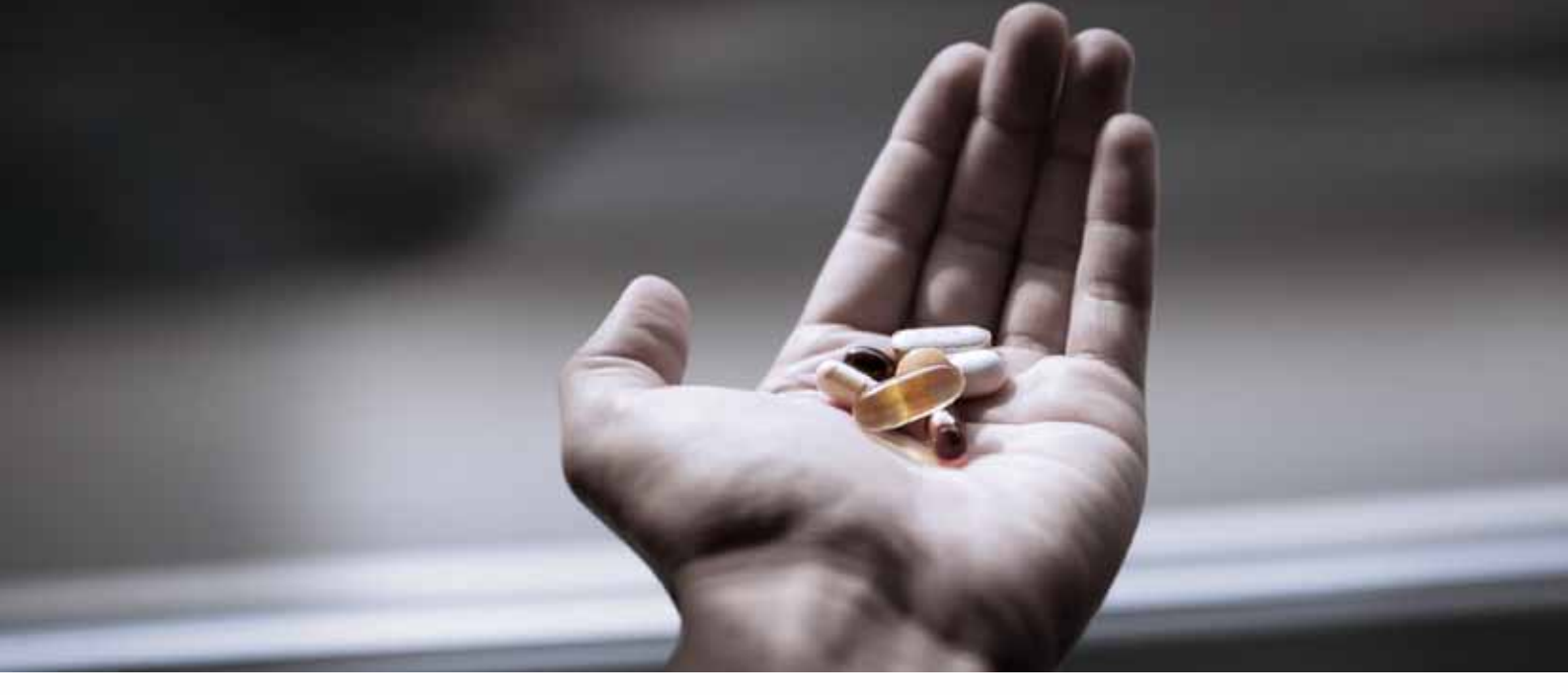
Eliminating Gender based Violence and substance abuse amongst the youth in communities of Mpumalanga