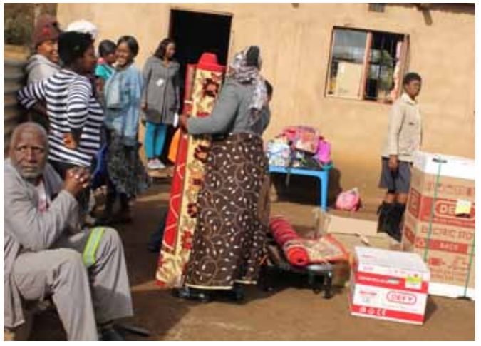
Bringing families and fighting poverty