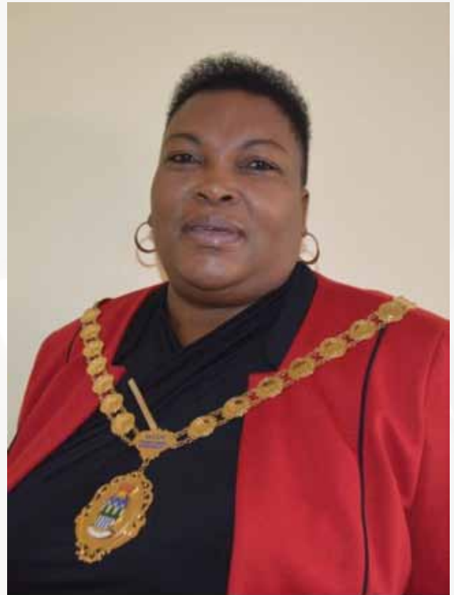
Honorable Executive Mayor Cllr Selina Mashingo-Sekgobela