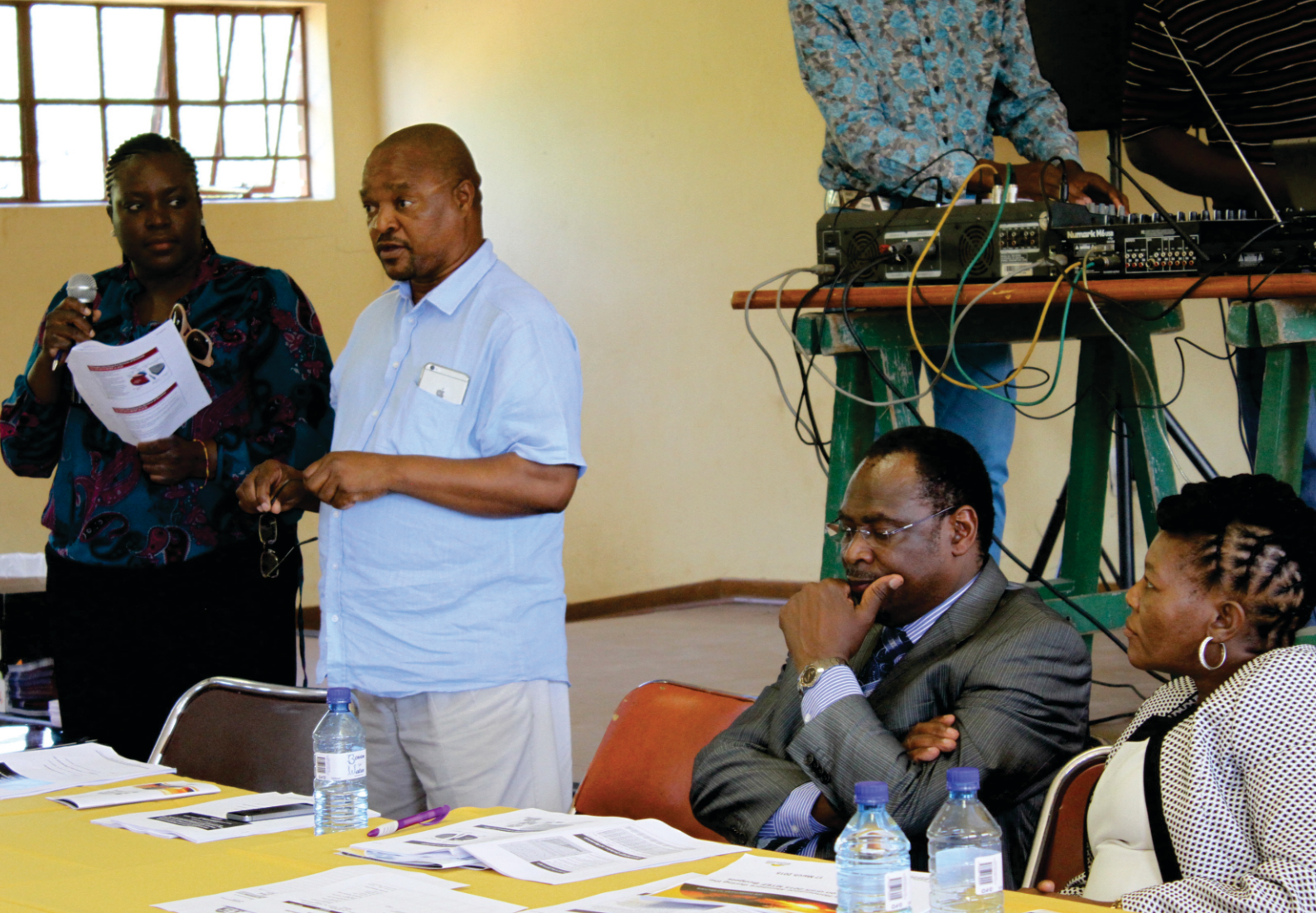
PUBLIC HEARING: Proceedings at public hearings on budget process which took place in all three districts