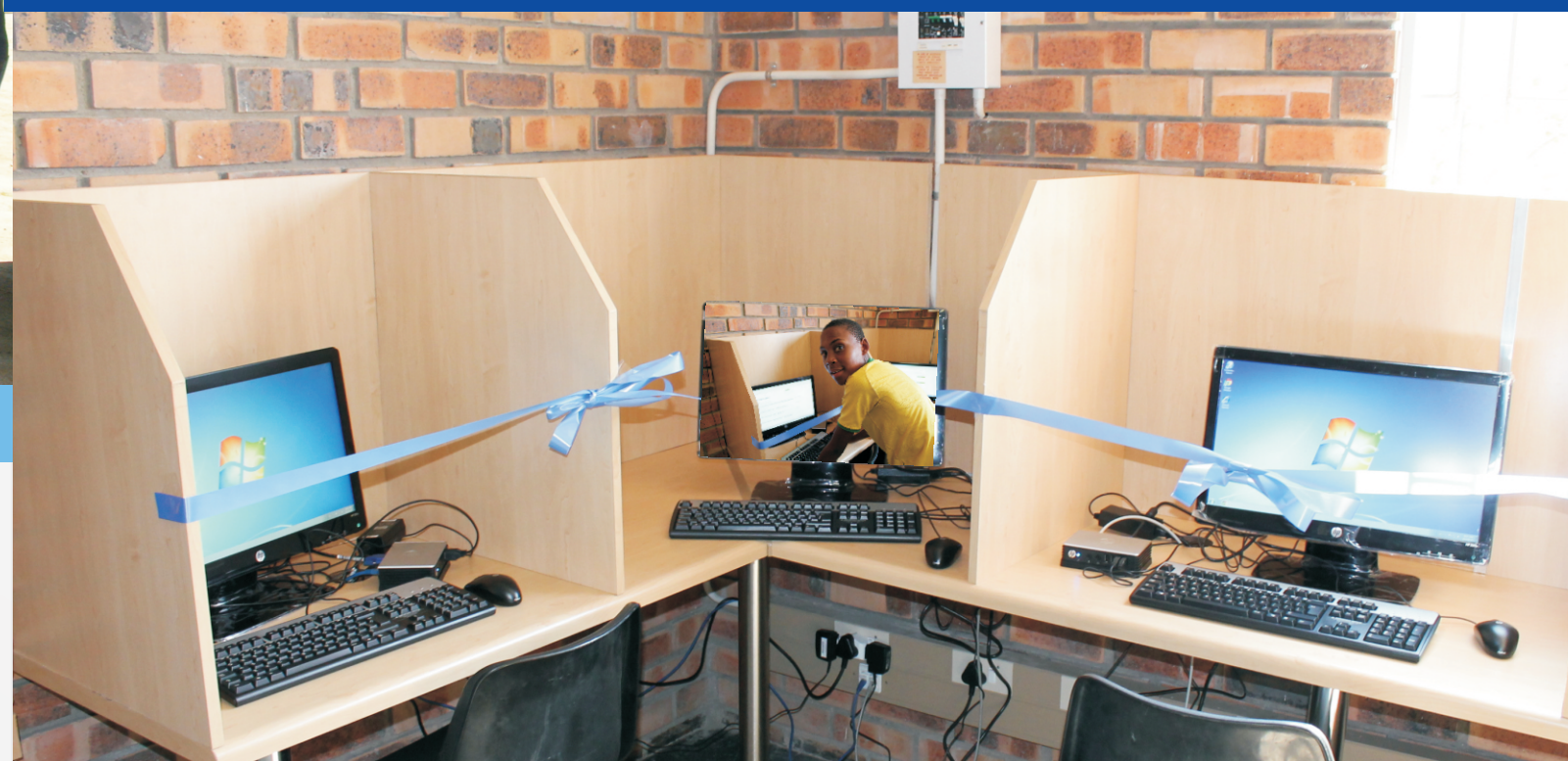
Here it is and some of the computers at the new Elukwatini internet kiosk centre

"In 2007, 3.7 per cent of households in Mpumalanga had access to or used the internet compared to 7.2 per cent of South African households.