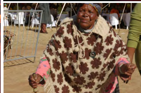
17 JULY 2011 BUILDING UP MANDELA DAY CELEBRATION AT TWEEFONTEIN H (Top right) Abo'Gogo were competing against each other on the dance floor!