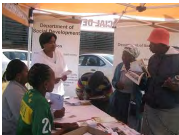
Social Workers assisting Communities in Piet Retief.