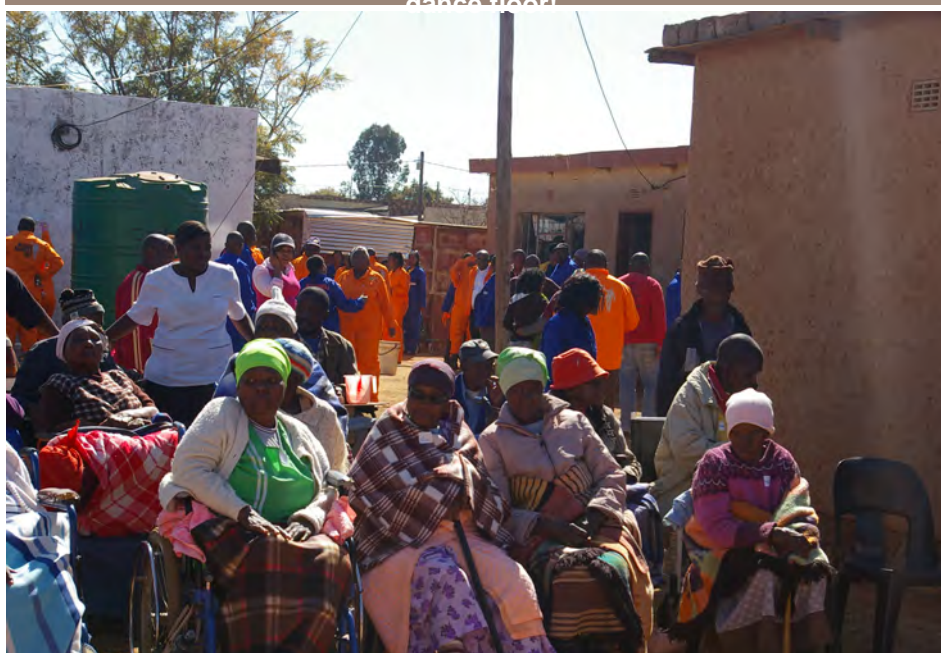
Older people of Ekukhanyeni Assisted Living (which is not only an Old Age Home but assist people with disabilities as well)