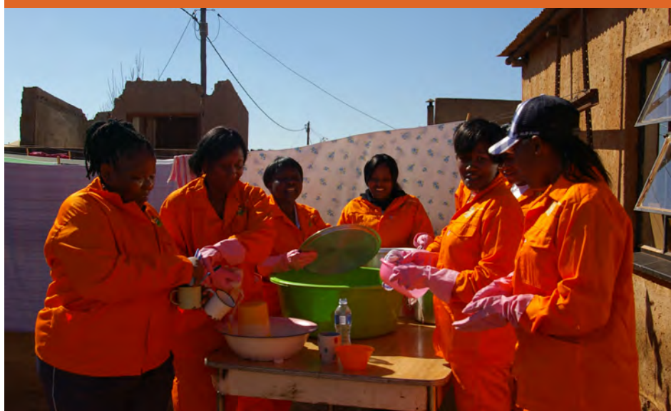
DSD Official's dedicated their 67 minutes washing dishes, cleaning, dishing up and painting walls